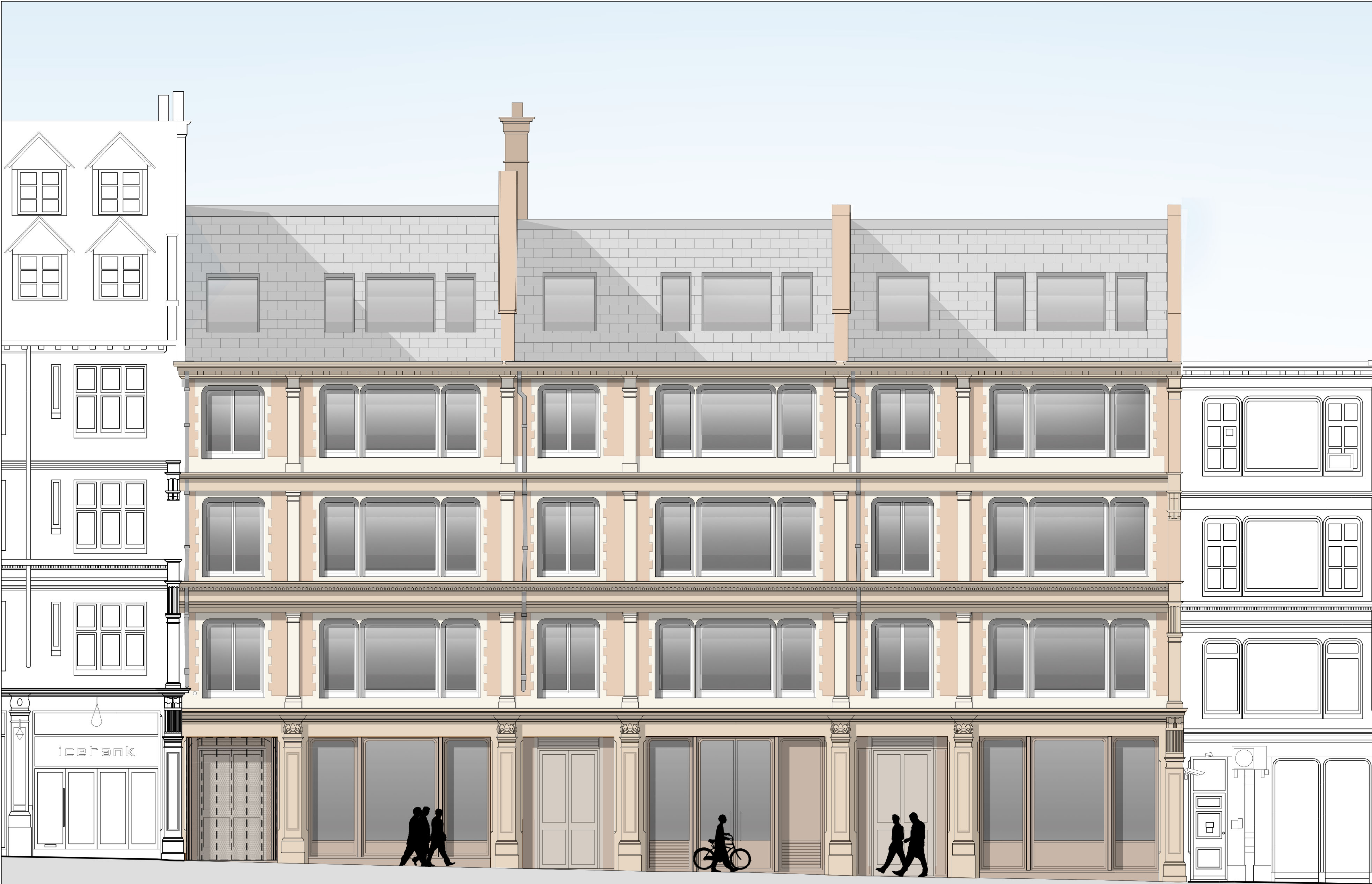
01 Proposed West Elevation (Grape Street), Coloured 1:50

Disclaimer Do not scale from this drawing. Check all dimensions on site before fabrication or setting out. This document is copyright and may not be reproduced without permission of the owner.