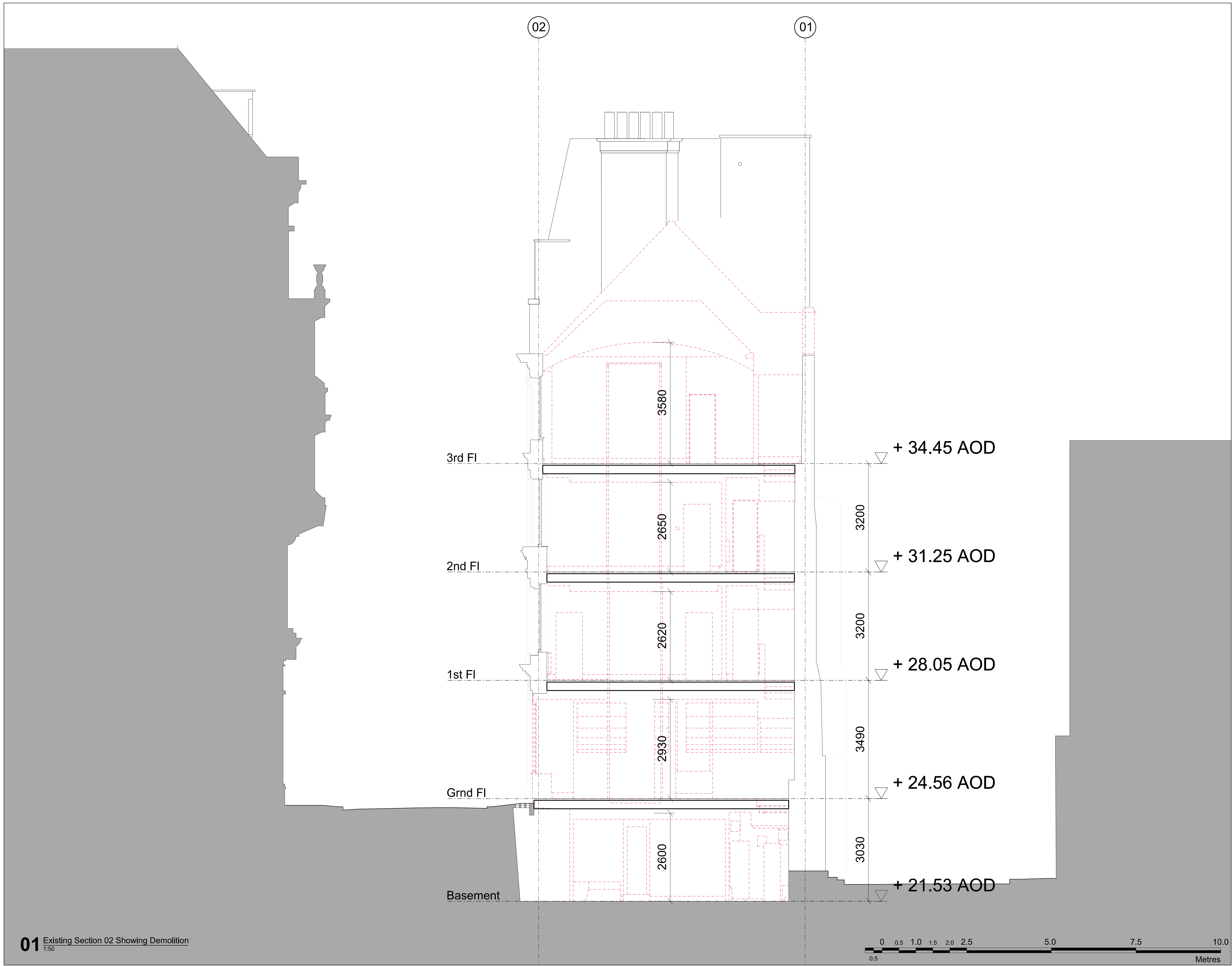
01 Existing Section 02 Showing Demolition 1:50