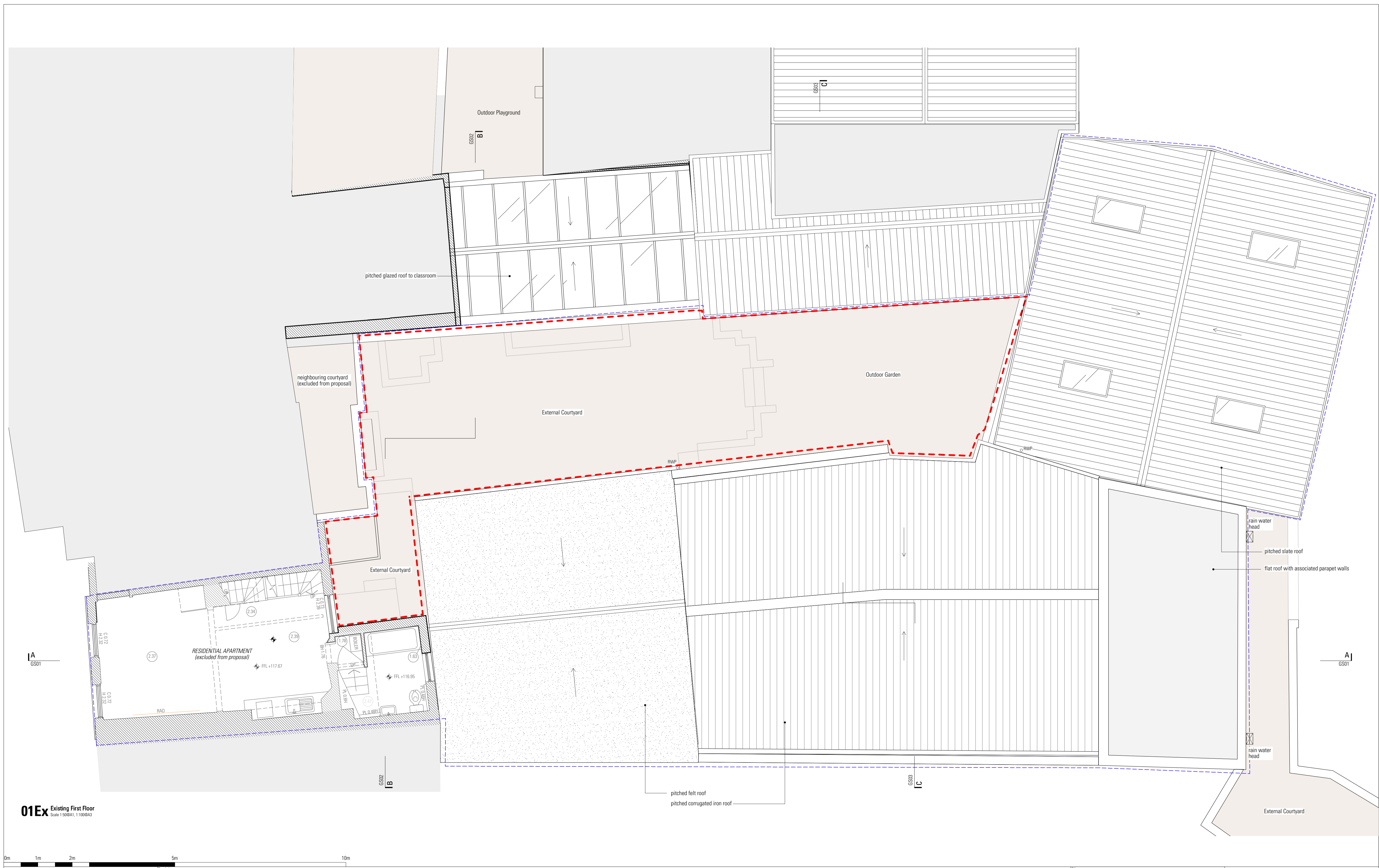
01Ex Existing First Floor Scale 1:50@A1, 1:100@A3