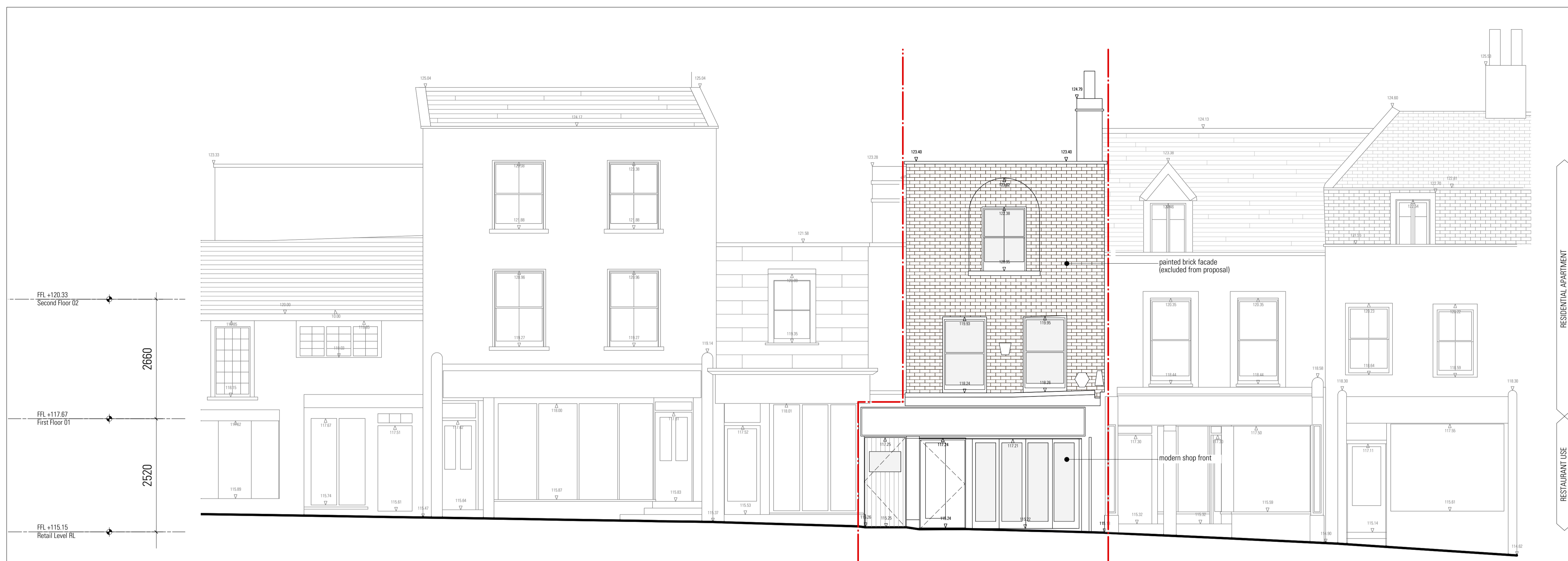
Ex01 Existing Elevation 01 Scale 1:500(A1, 1:1000(A3))