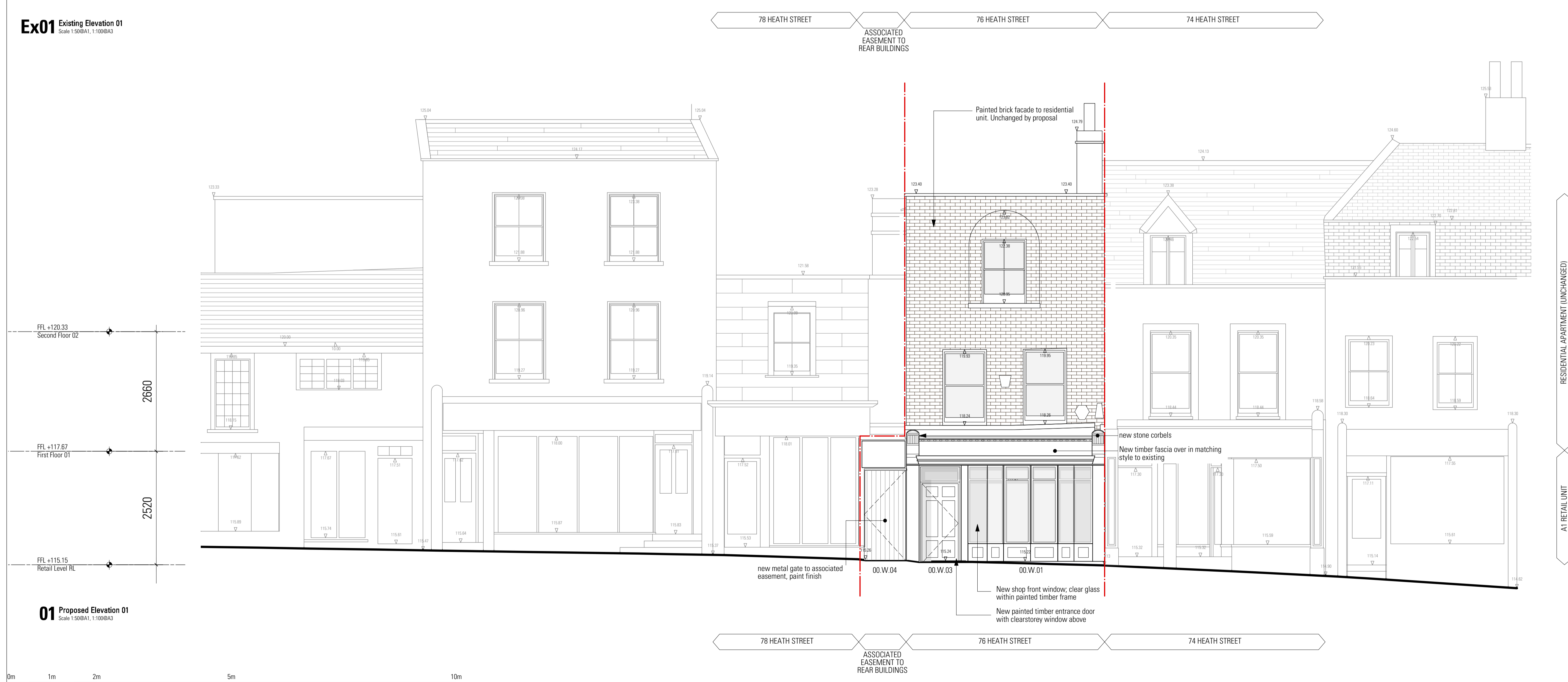
01 Proposed Elevation 01 Scale 1:500(A1, 1:1000(A3))