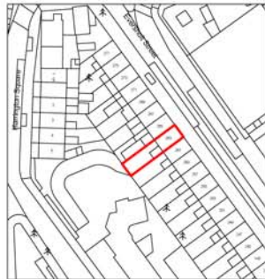
1 Location Map 1 : 1250