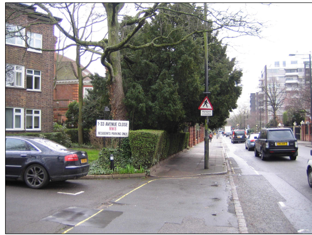
Existing front entrance