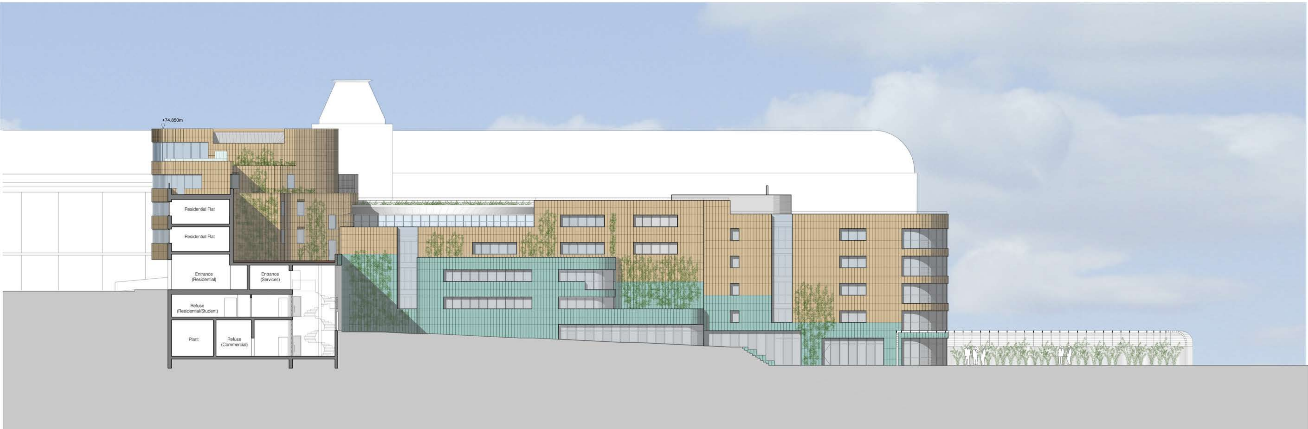
North Elevation - Inside Boundary