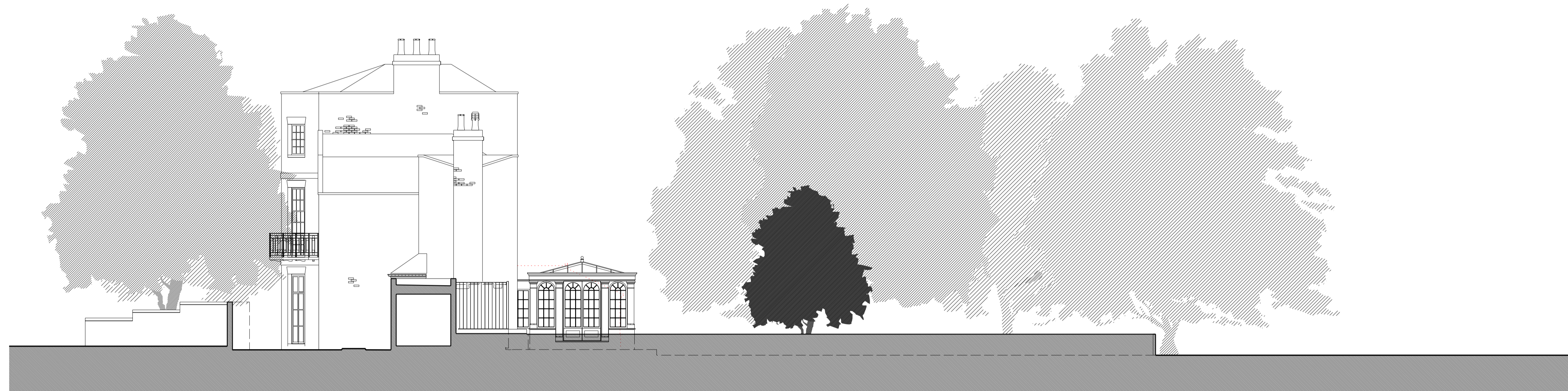
PROPOSED NORTH-WEST ELEVATION