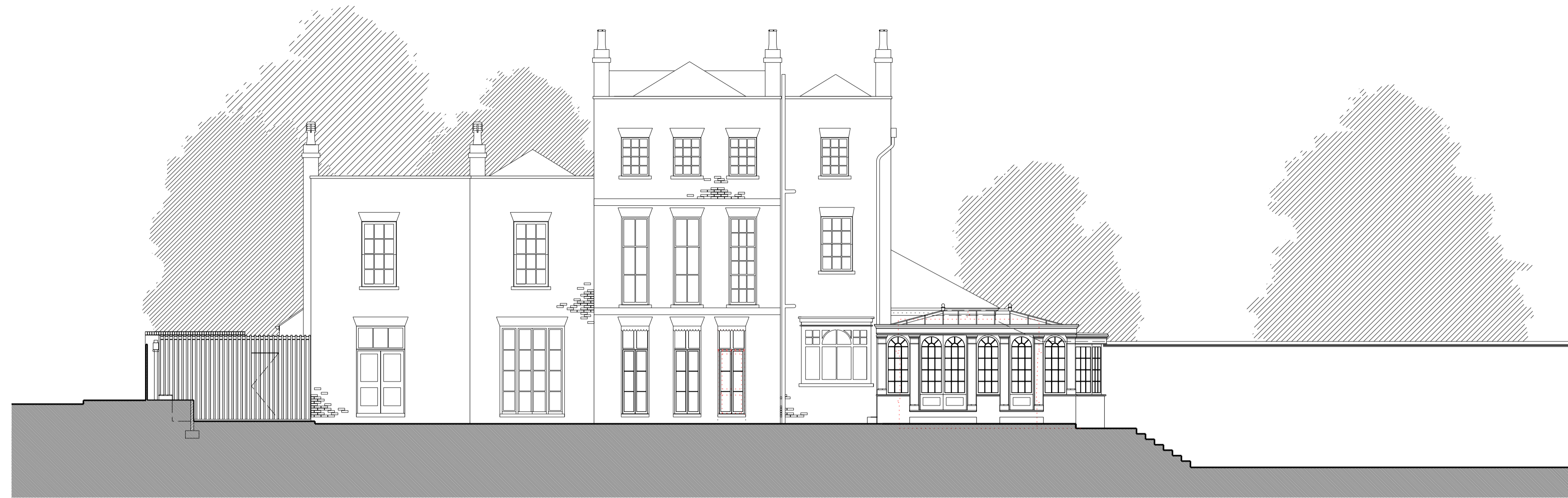
PROPOSED SOUTH-WEST ELEVATION