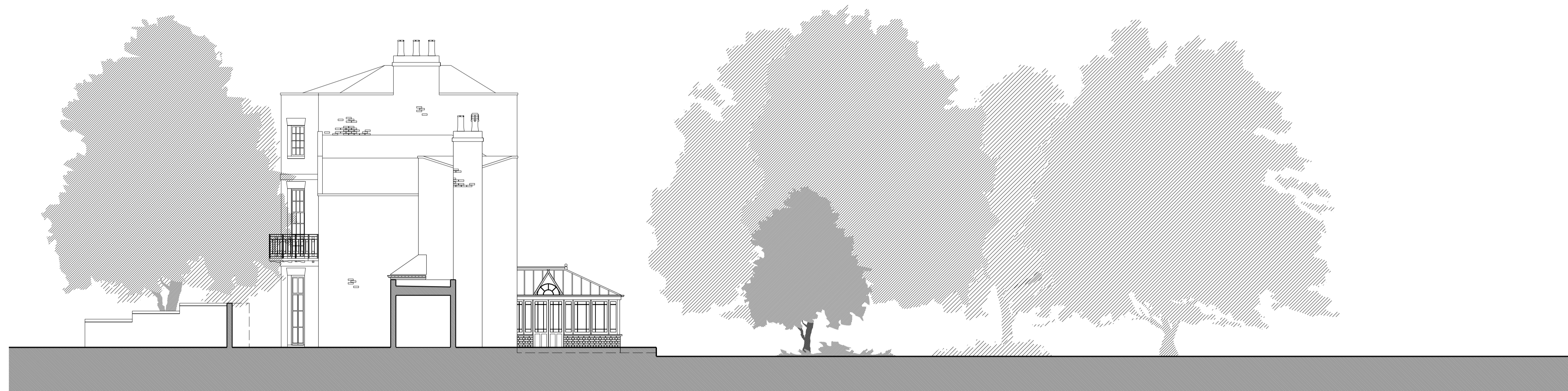
EXISTING NORTH-WEST ELEVATION