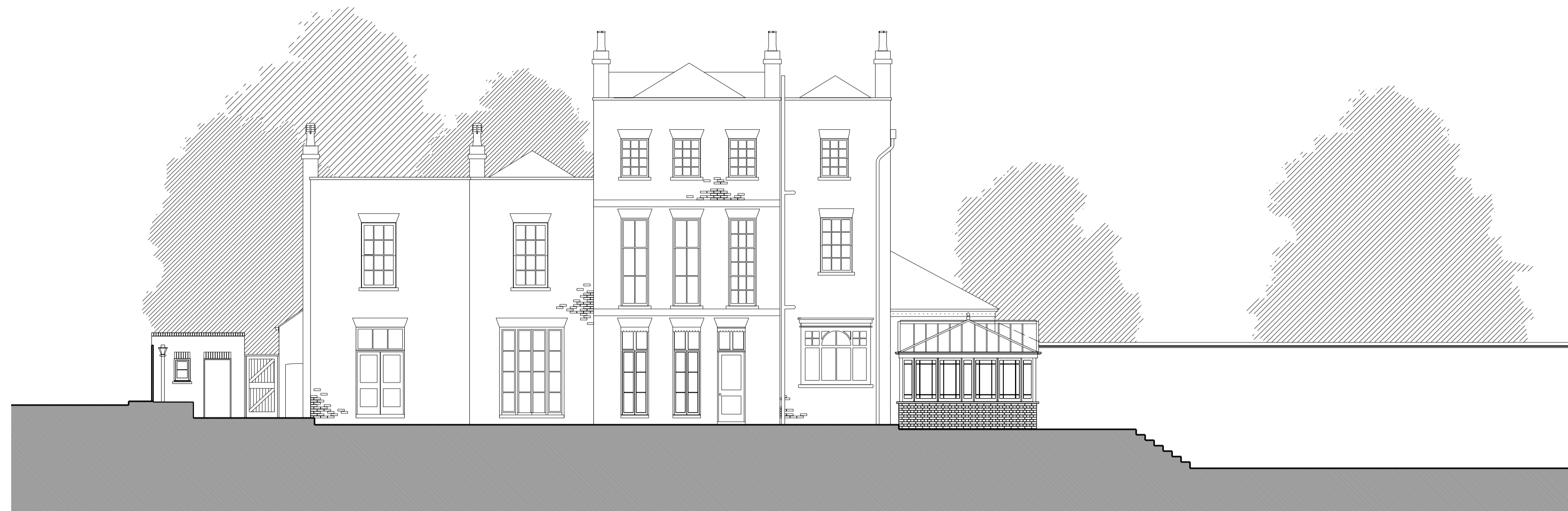
EXISTING SOUTH-WEST ELEVATION