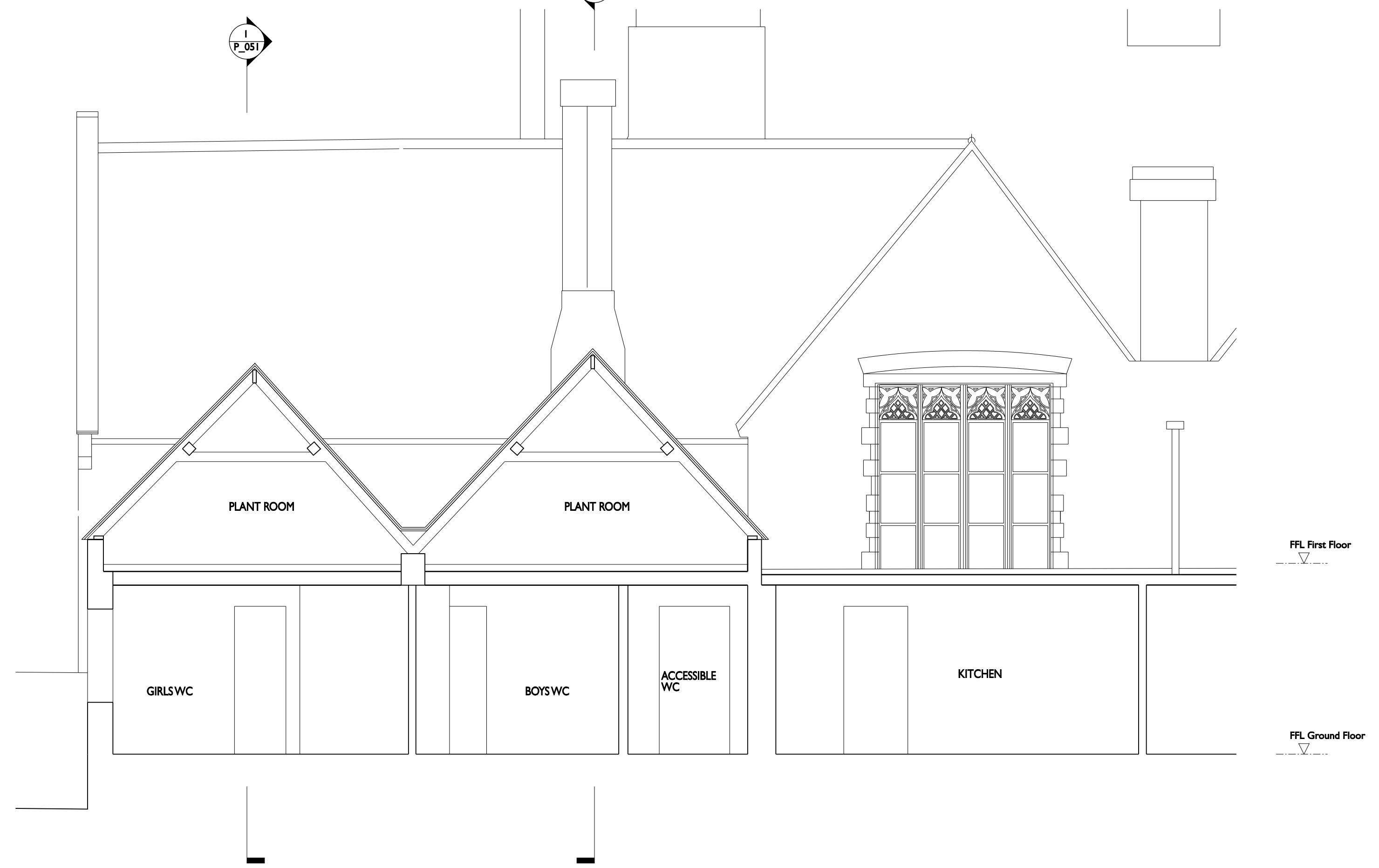
4 Section R-R P_051 Scale 1:50