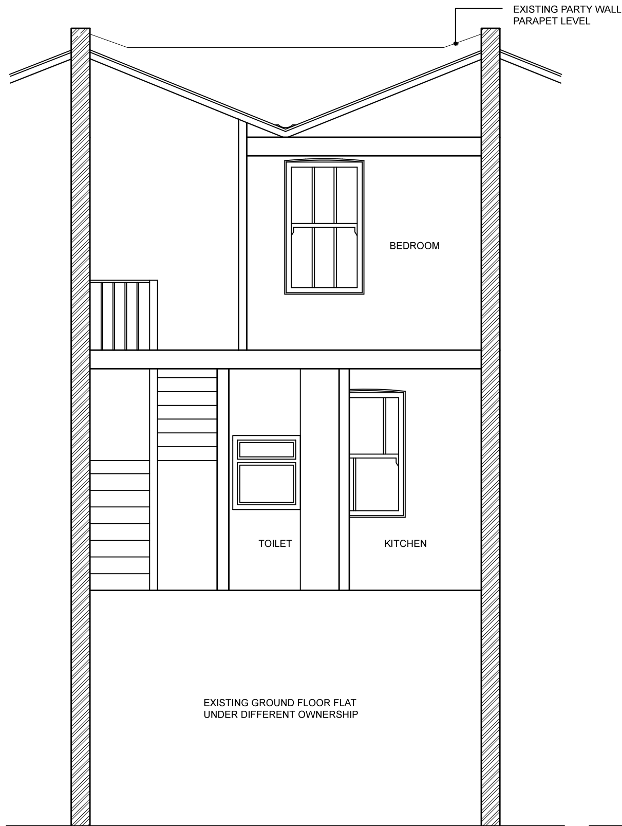
EXISTING SECTION CC