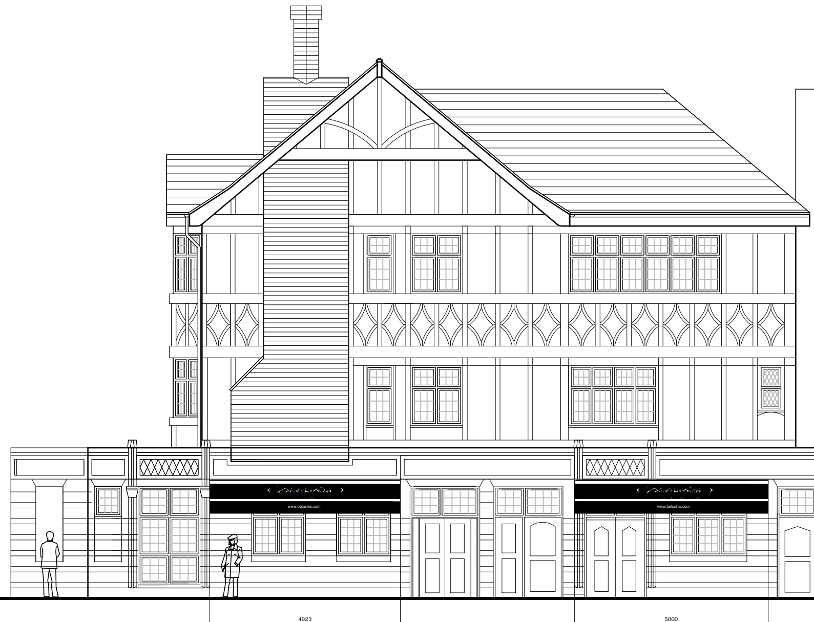
PROPOSED elevation to Plender Street E 1:100