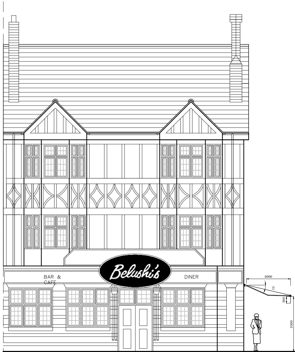
PROPOSED elevation to Camden High Street E 1:100