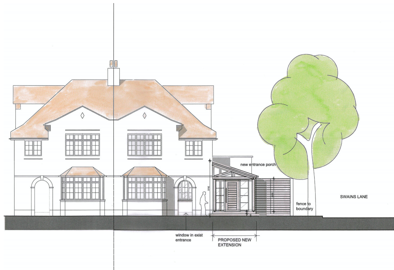
Front Elevation South to Bromwich Avenue showing new entrance porch