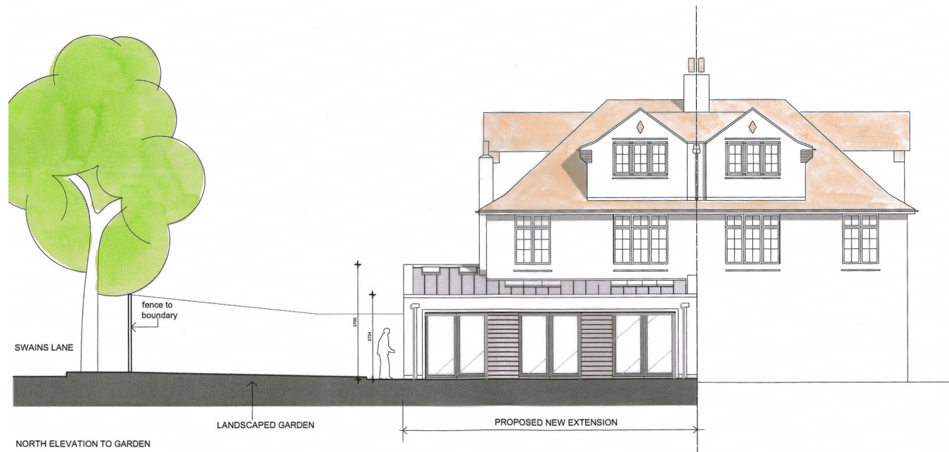
Rear Elevation North from garden showing proposed rear & side extension