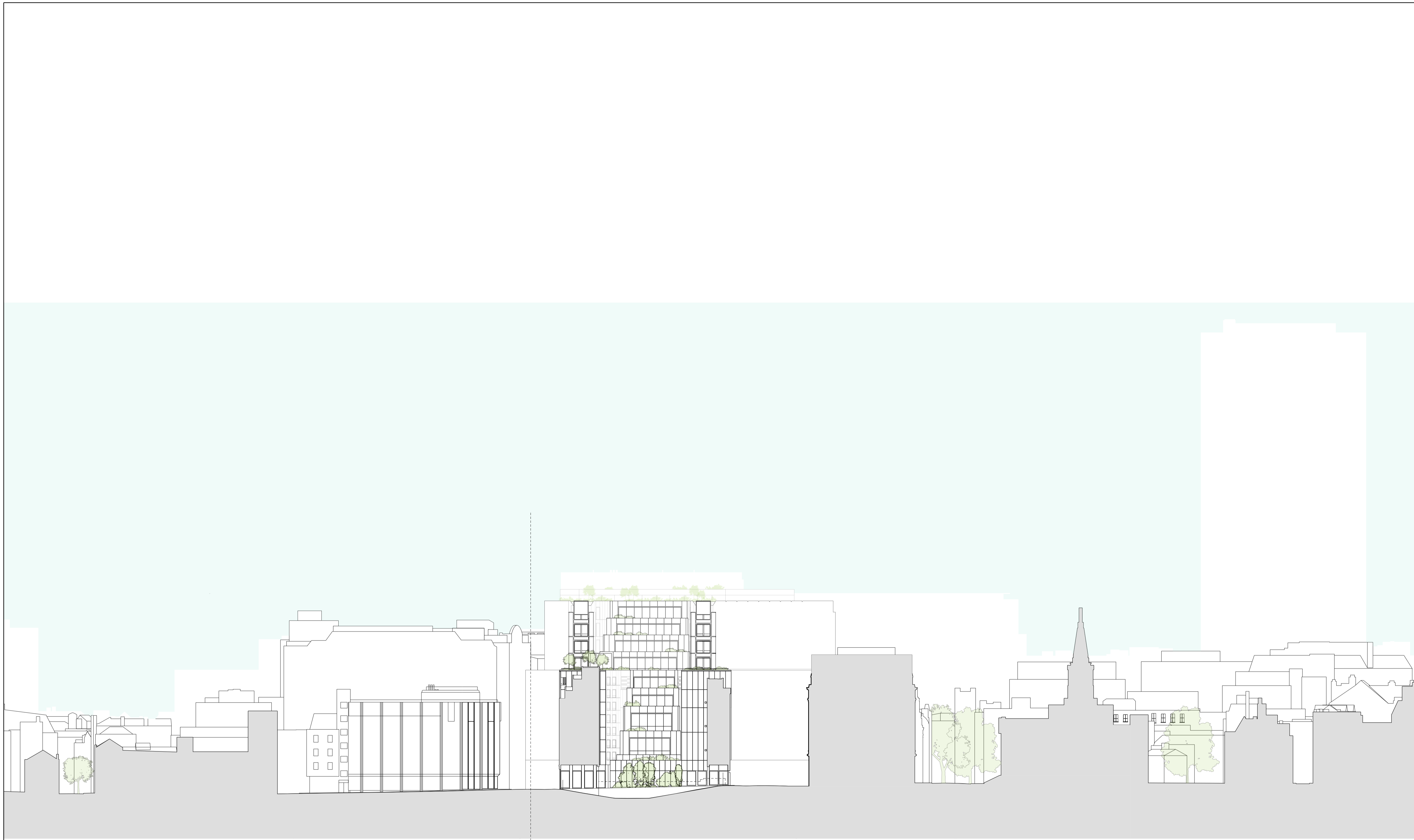
SITE CONTEXT - EAST ELEVATION