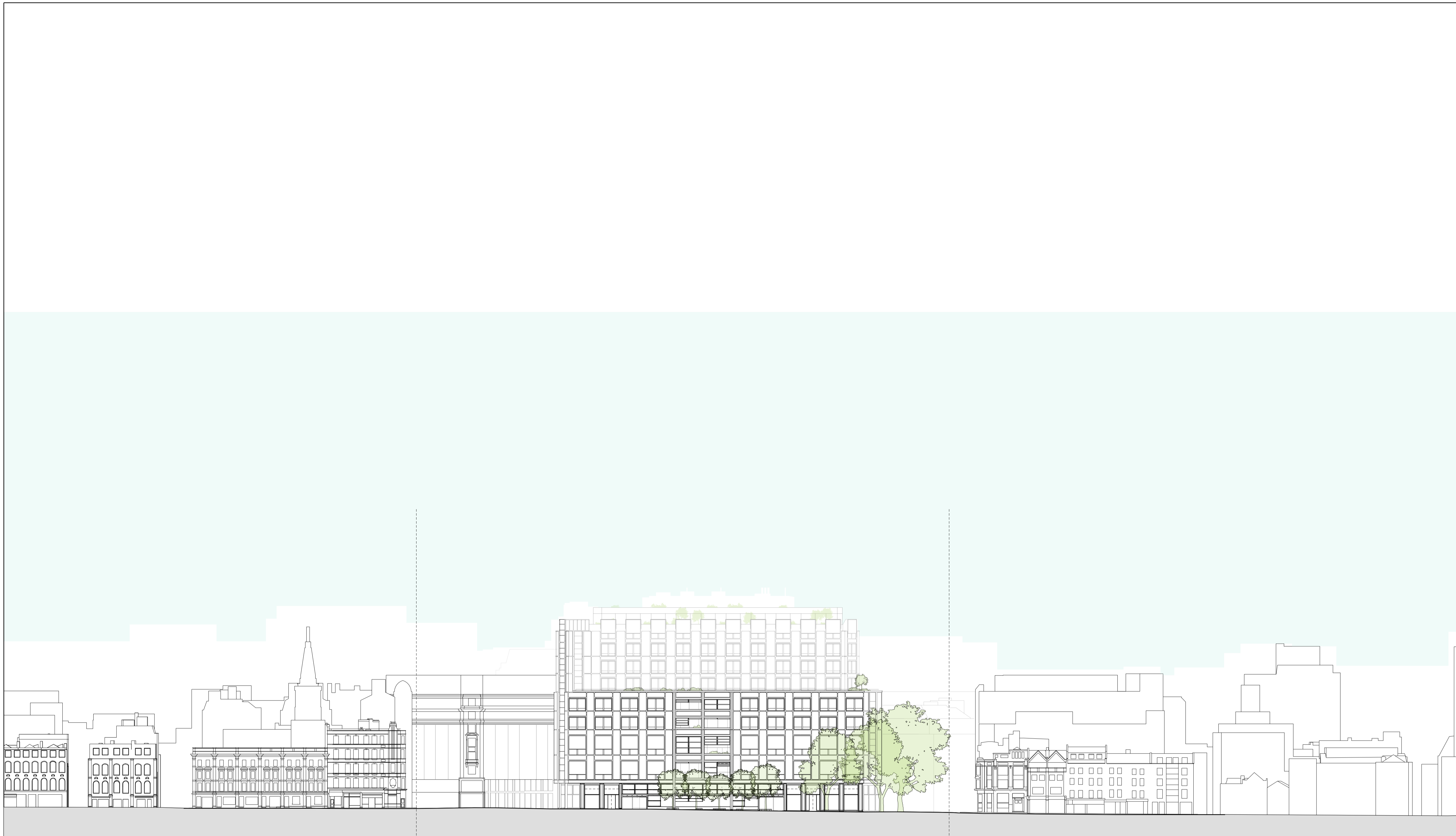
SITE CONTEXT - WEST ELEVATION

LITTLE RUSSELL STREET BLOOMSBURY WAY NEW OXFORD STREET HIGH HOLBORN STUKELEY STREET