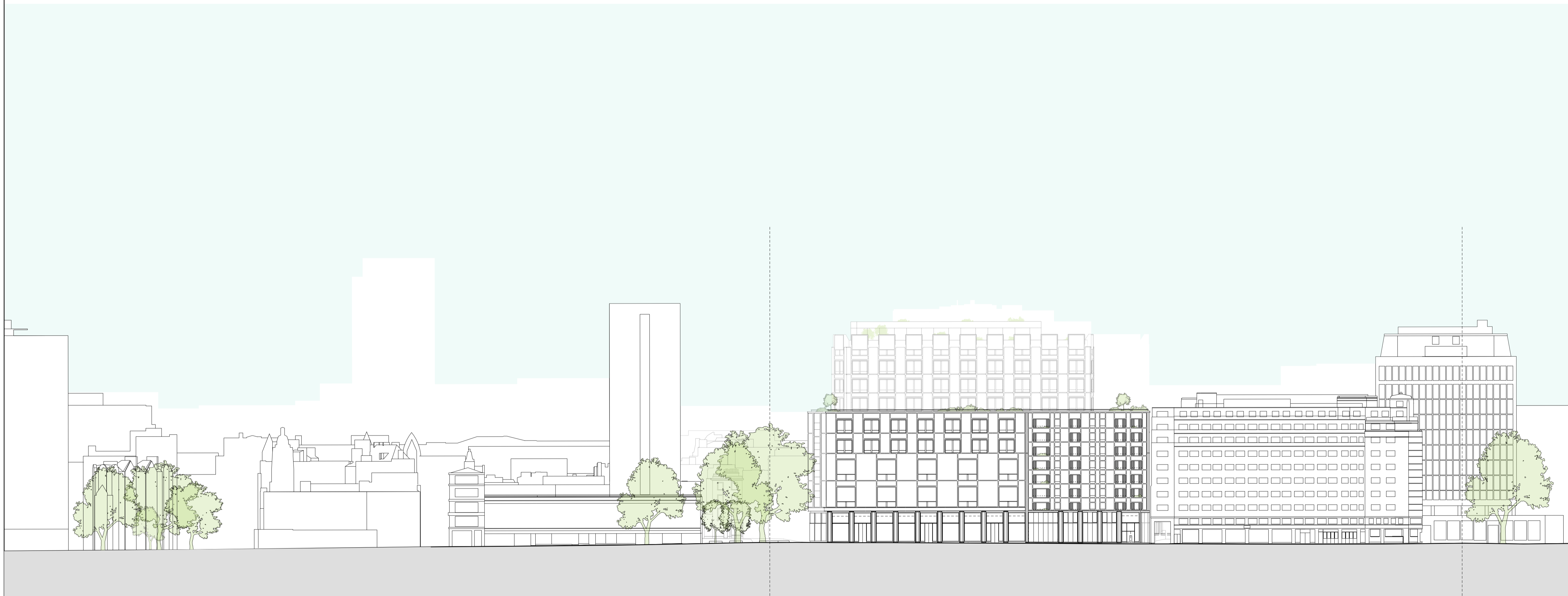
SITE CONTEXT - SOUTH ELEVATION