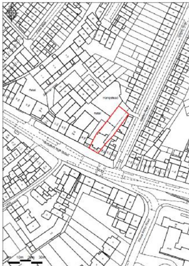
Figure 1: Site Location Plan