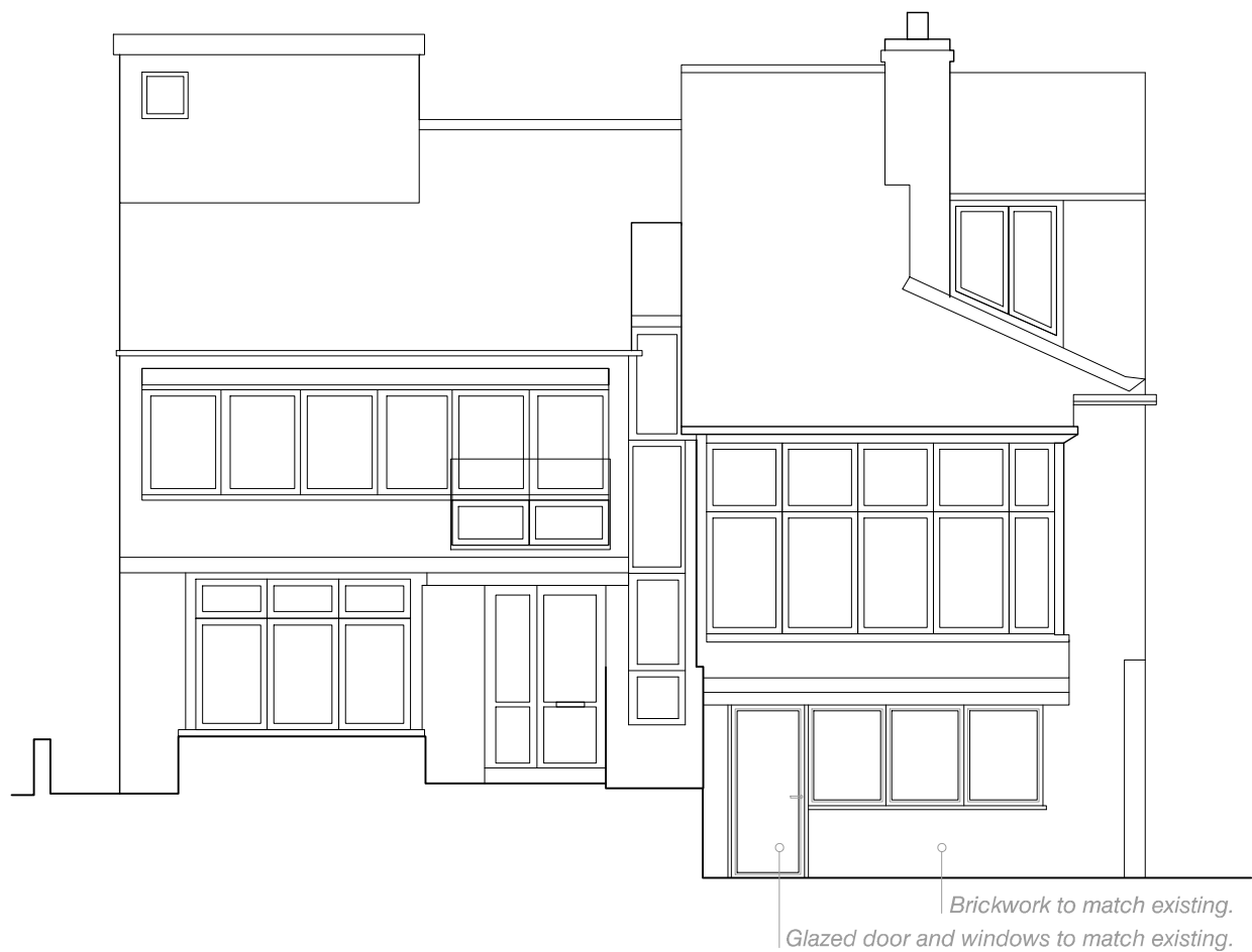
PROPOSED FRONT (SOUTH) ELEVATION