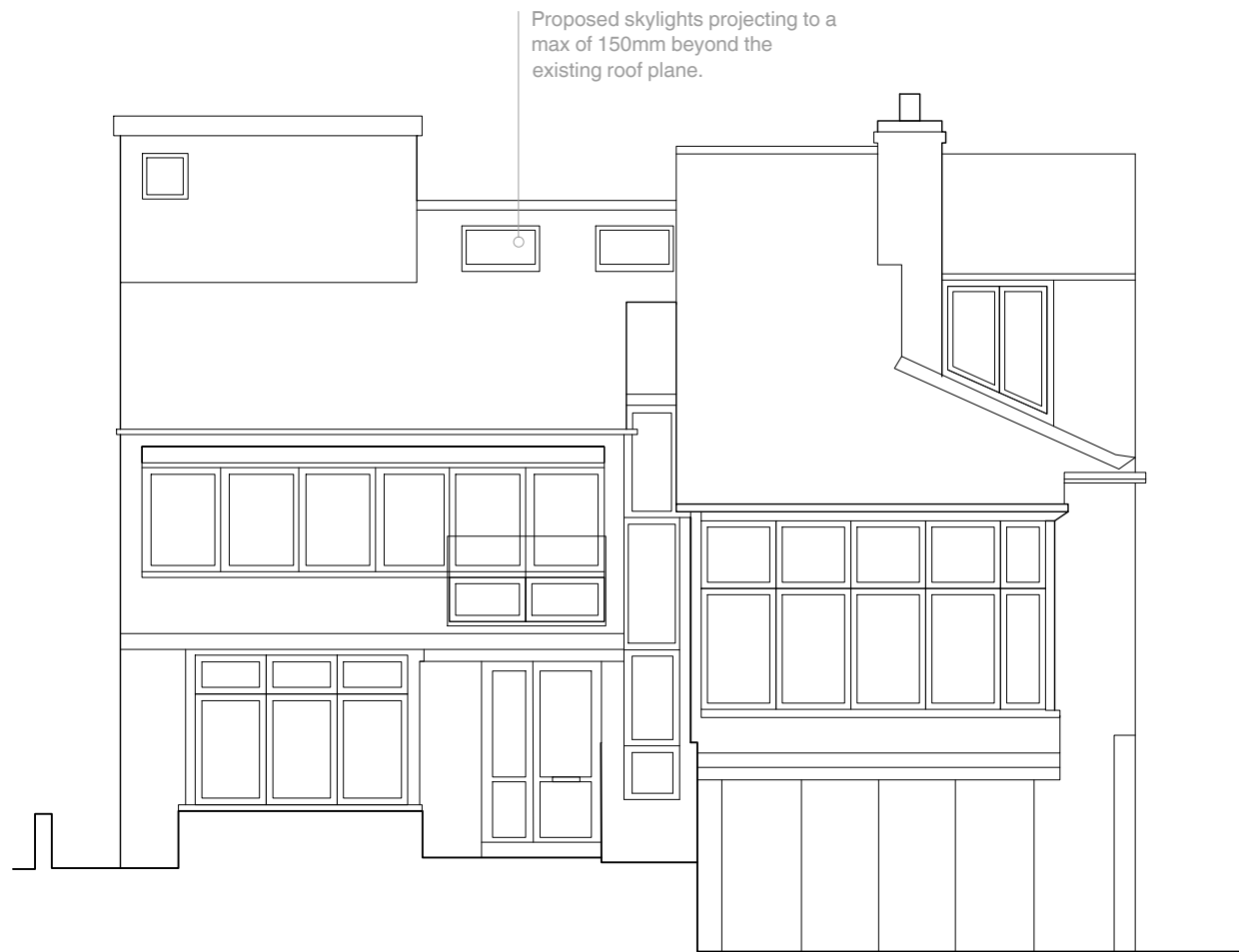
PROPOSED FRONT (SOUTH) ELEVATION