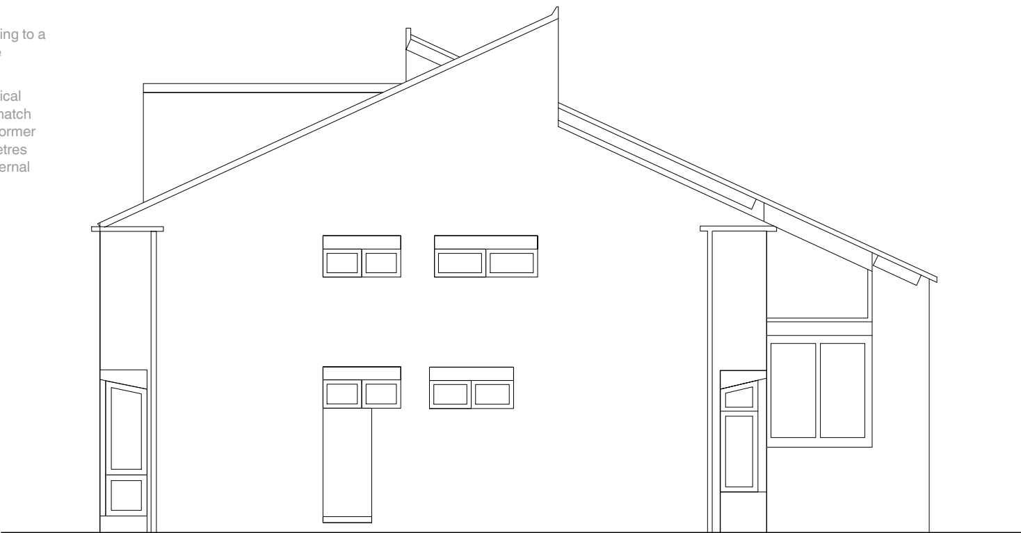
PROPOSED SIDE (WEST) ELEVATION

Proposed skylights projecting to a max of 150mm beyond the existing roof plane. Proposed dormer with vertical roof tiles and windows to match existing. Total volume of dormer to be a max of 50 cubic metres (as measured from the external extent).