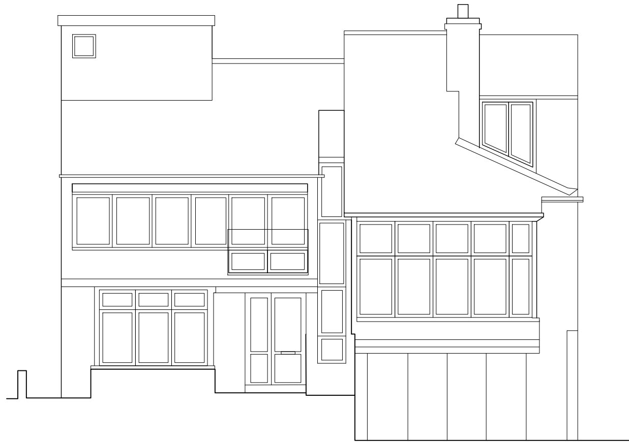
EXISTING FRONT (SOUTH) ELEVATION