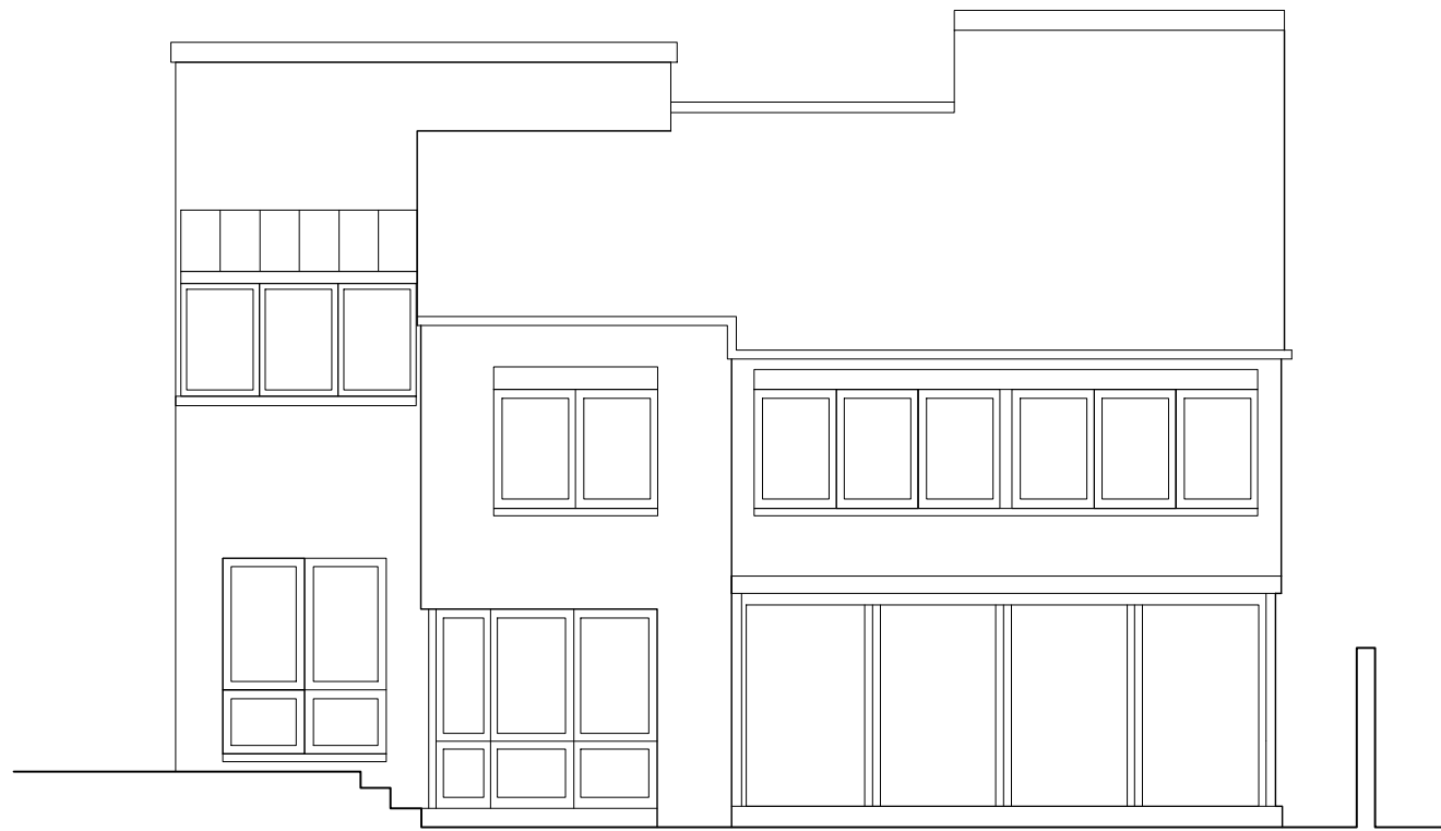
EXISTING REAR (NORTH) ELEVATION