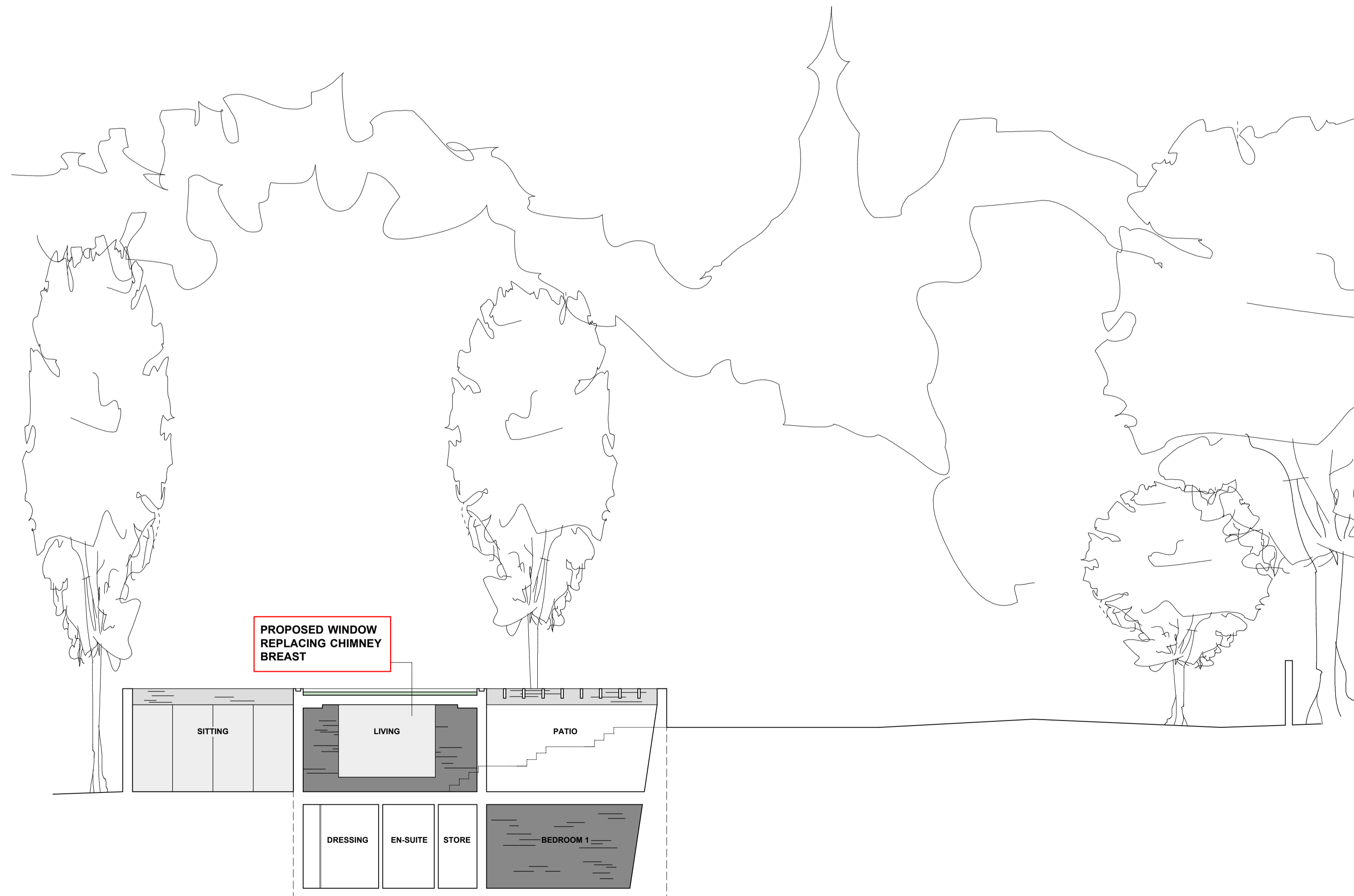
PROPOSED SECTION D 1:100 @ A1