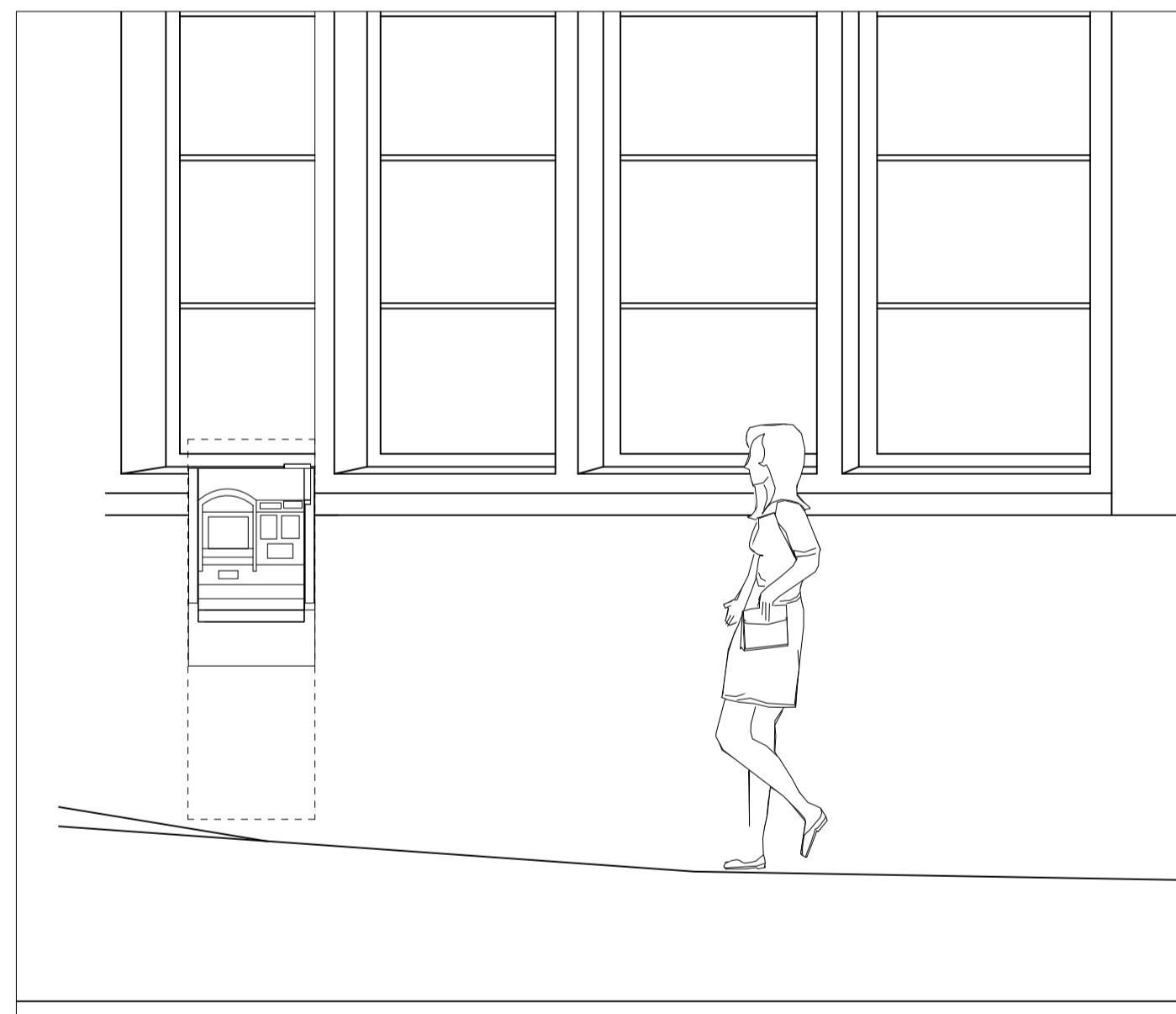
CAMDEN TOWN DETAILED ELEVATION OF AFFECTED AREA (scale 1:25) @ A1