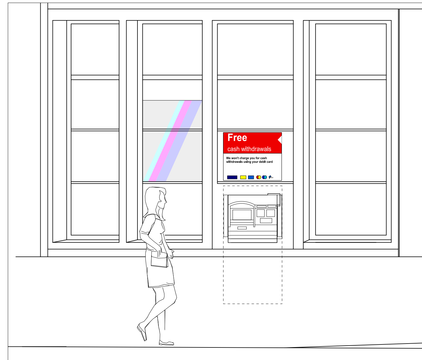
CAMDEN TOWN DETAILED ELEVATION OF AFFECTED AREA (scale 1:25) @ A1