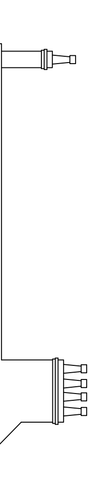
NG OPPOSITE SIDE ELEVATION