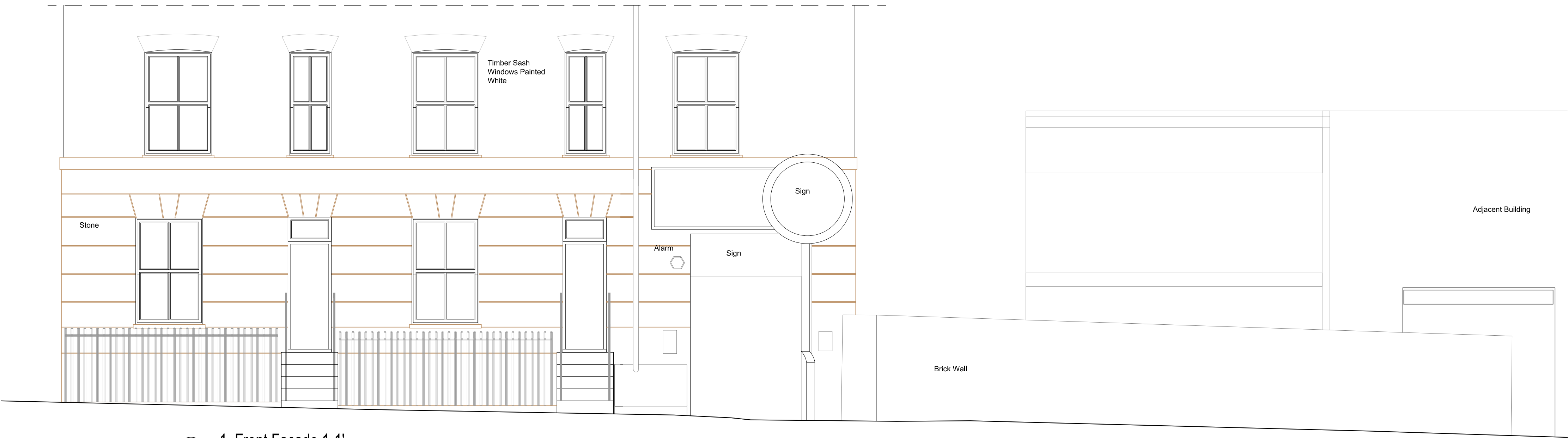
1. Front Facade 1-1' Scale 1/50