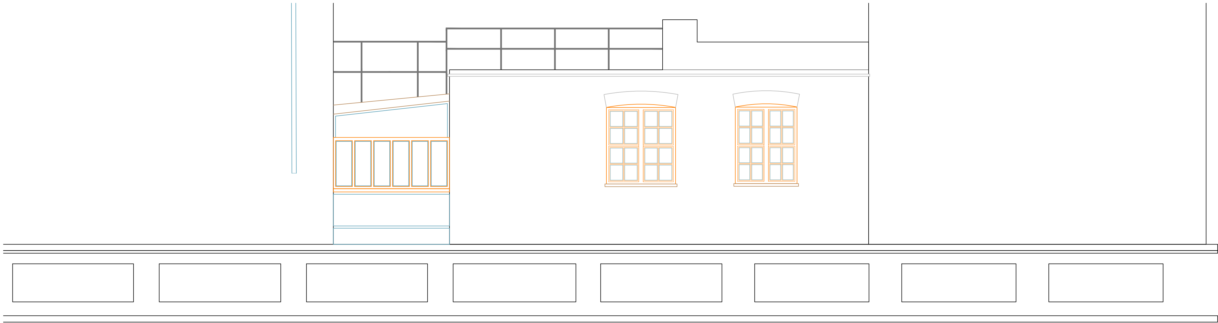
2. East Facade 2-2' Scale 1/50