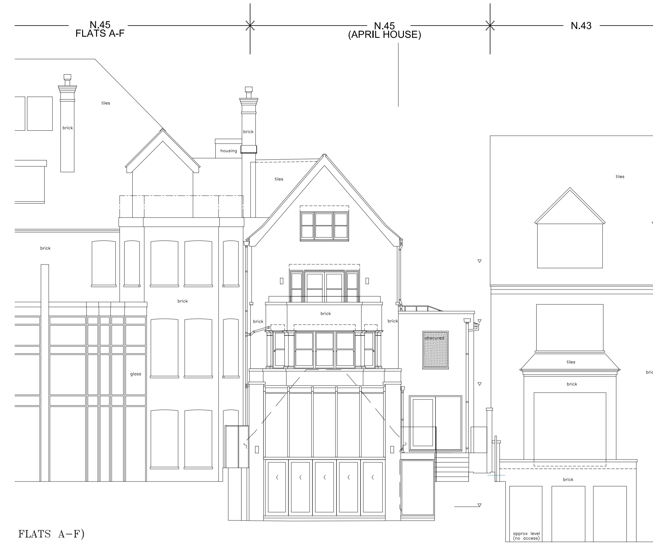
2 REAR (west) ELEVATION