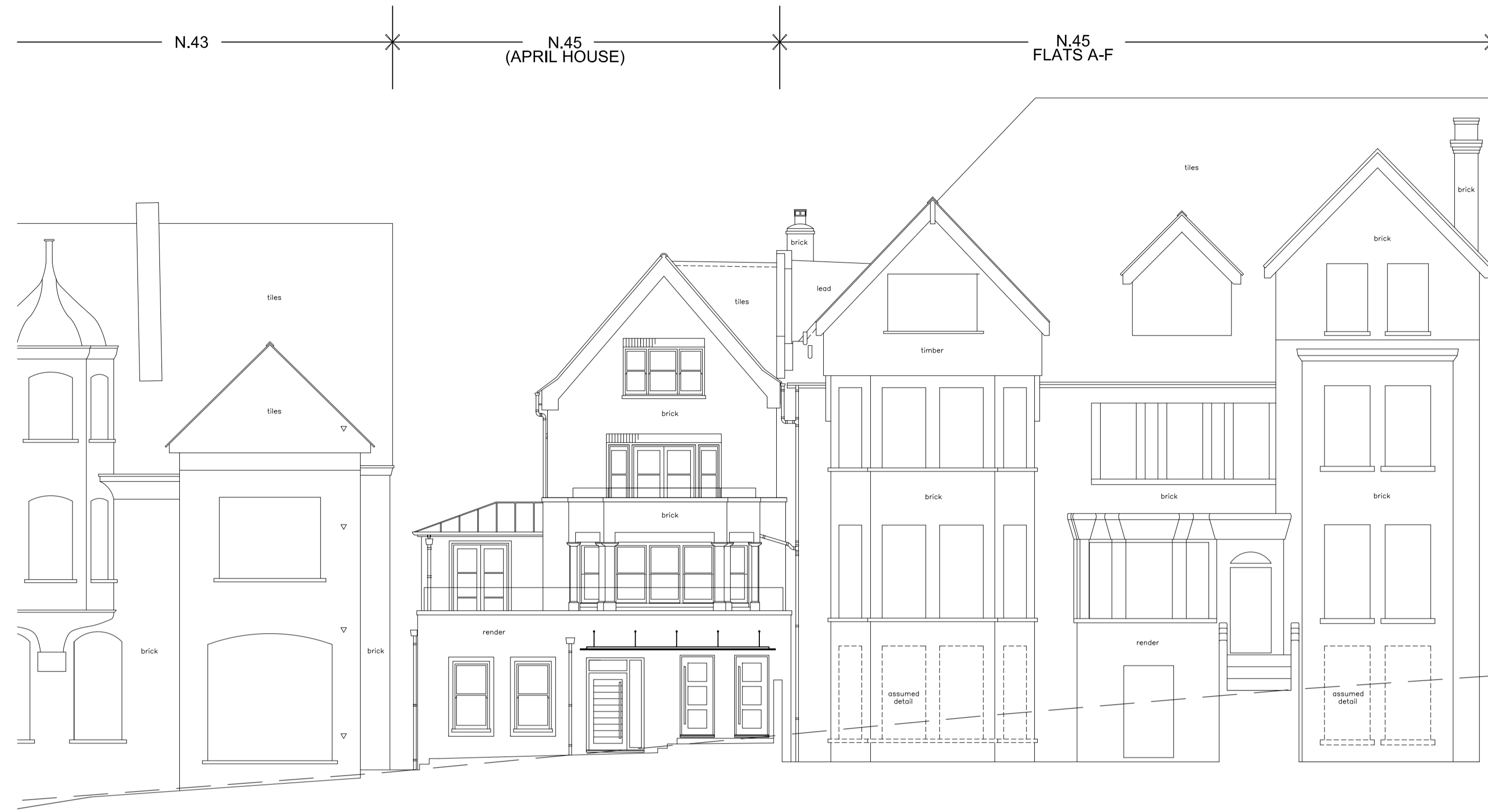
1 FRONT (east) ELEVATION