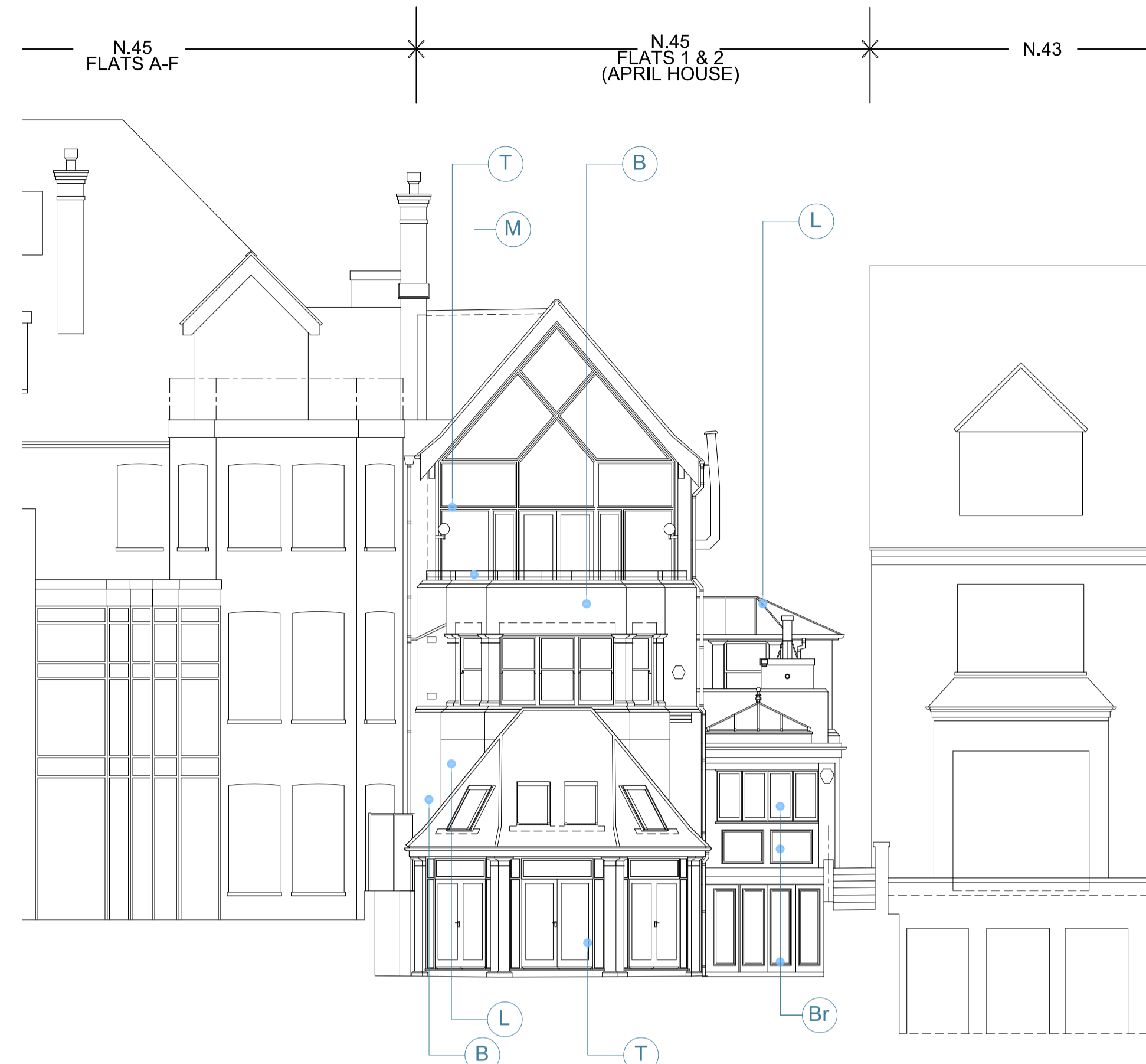
2 REAR (west) ELEVATION