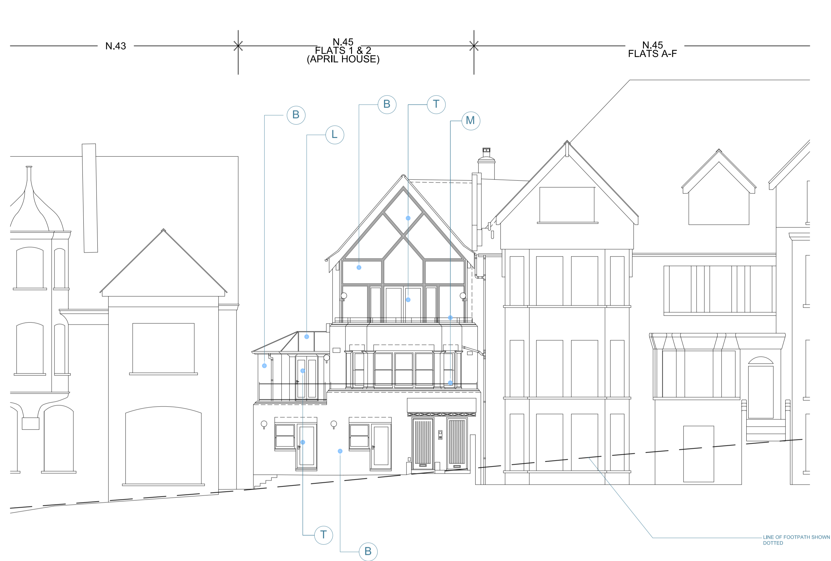
1 FRONT (east) ELEVATION