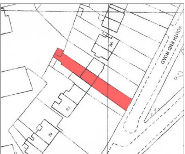
LOCATION PLAN SCALE 1:1250@A3