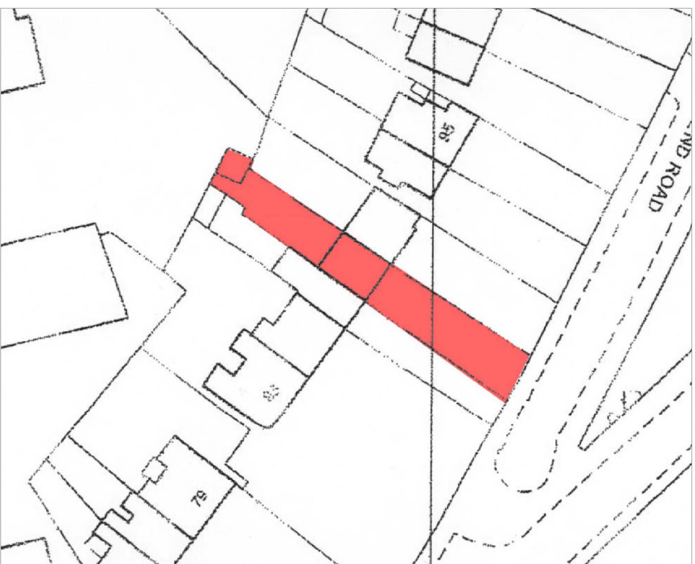
SITE PLAN SCALE 1:500@A3