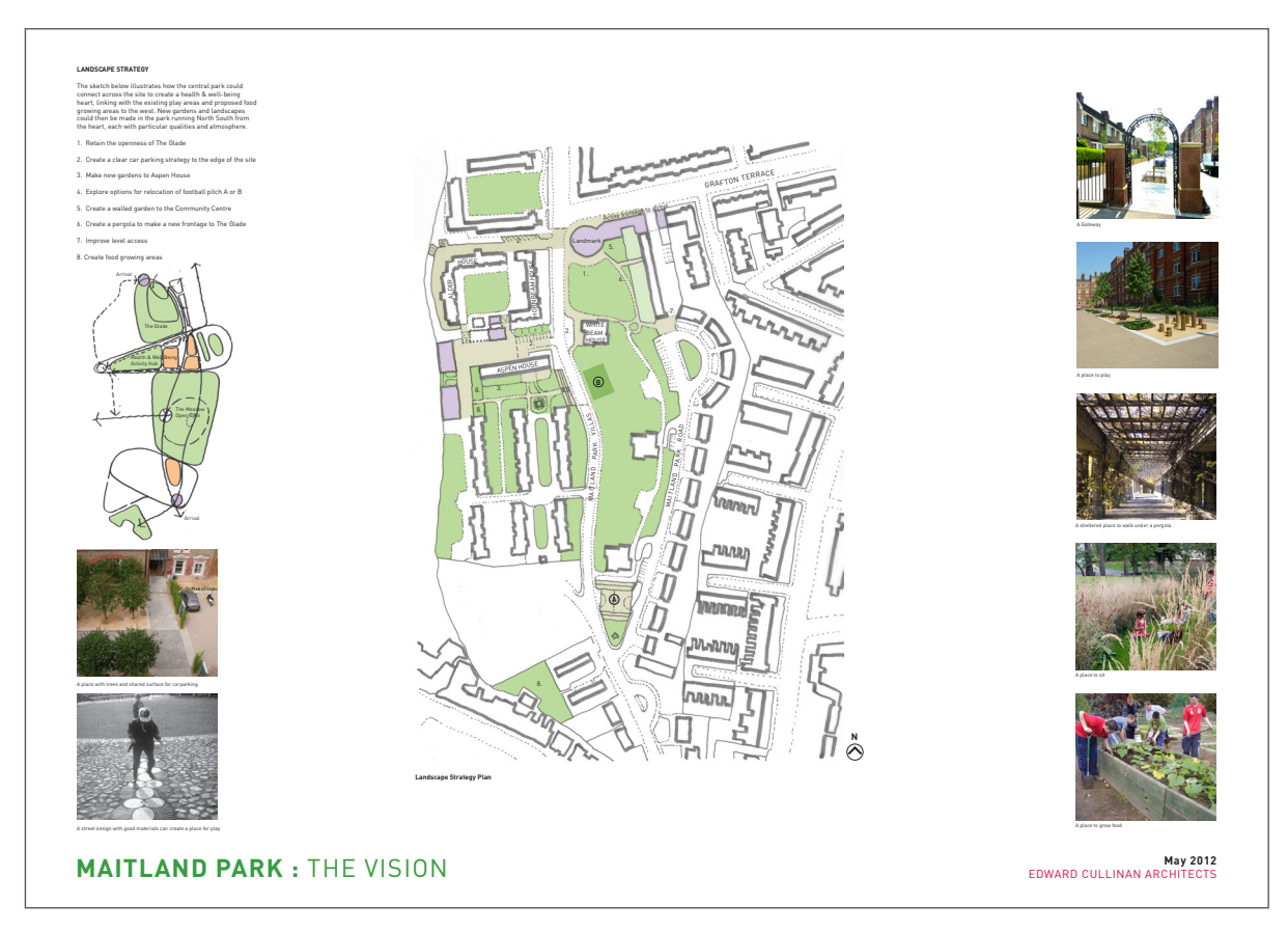
EVENT ONE - May 2012: Stage AB