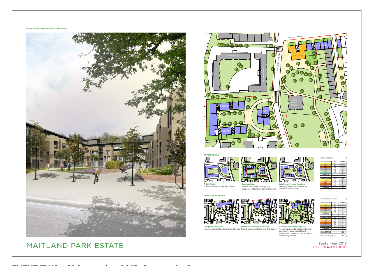
EVENT TWO - 21 September 2013: Community Day