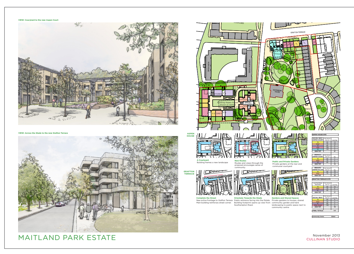
EVENT THREE - 28 November 2013: TRA Exhibition