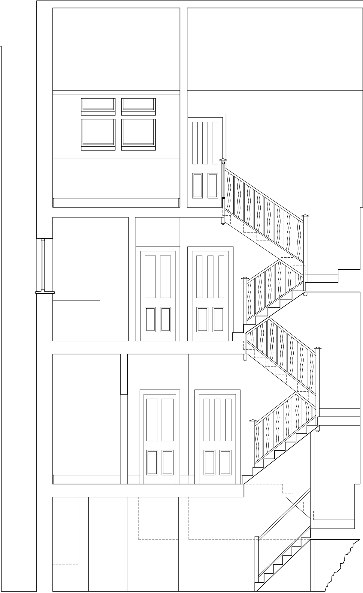
Existing Section B-B