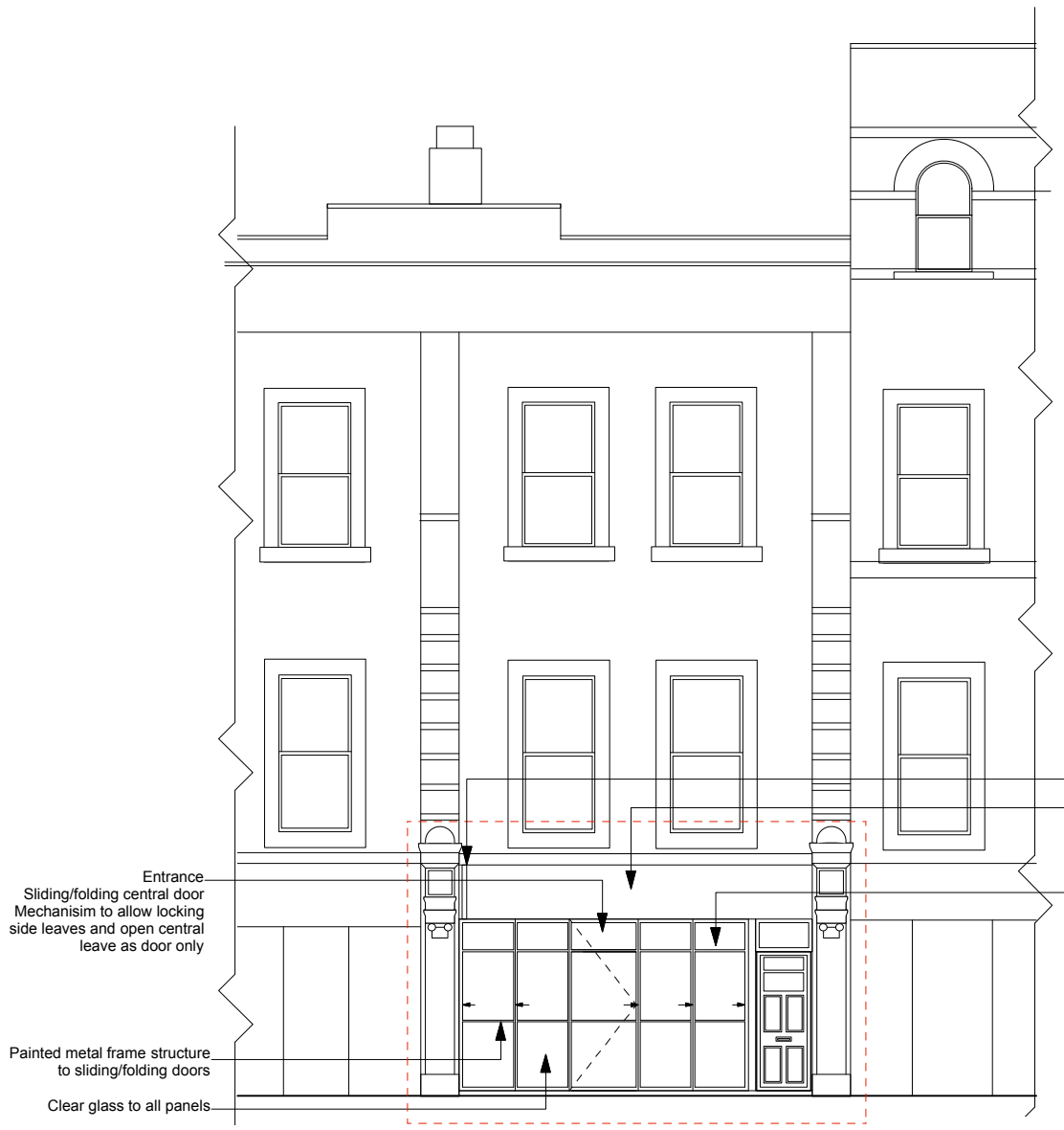
Front Elevation- Proposed