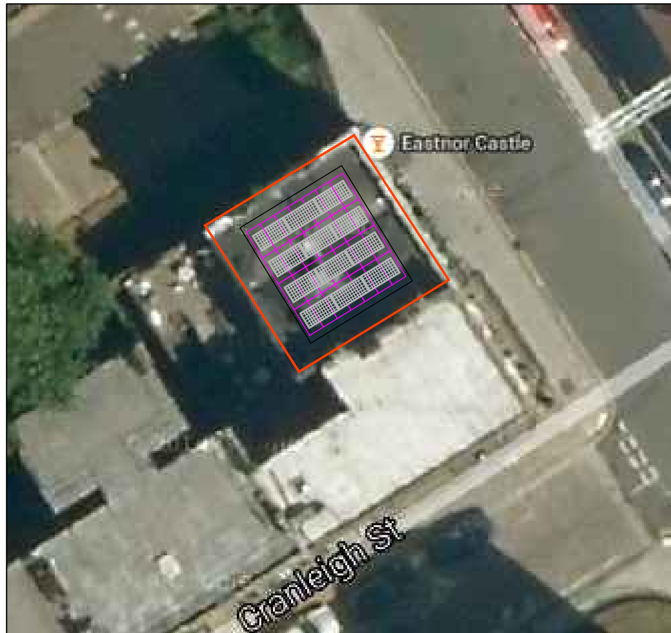
Google View, Scale 1:200