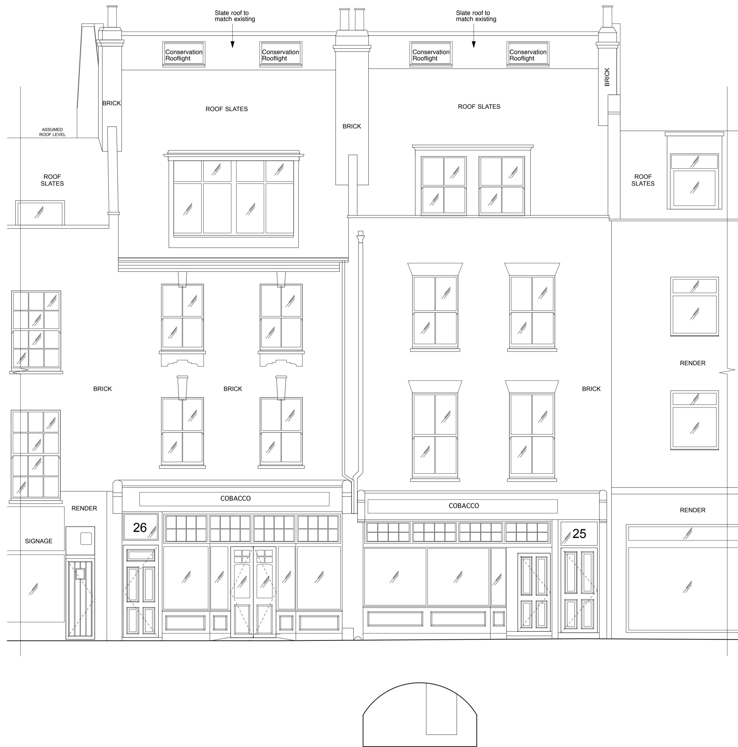
01/P11 Proposed Front Elevation