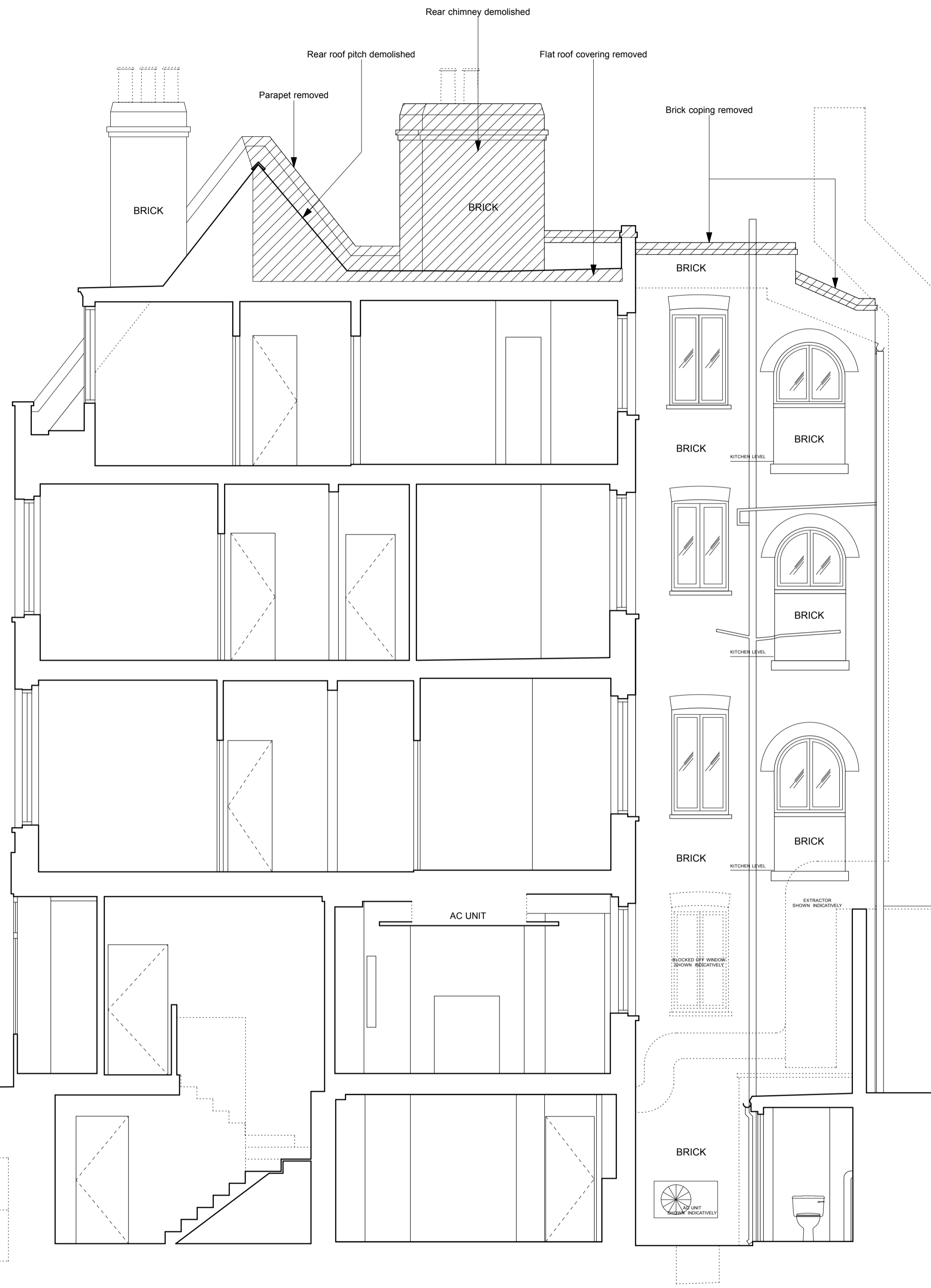
01/P07 Existing Section