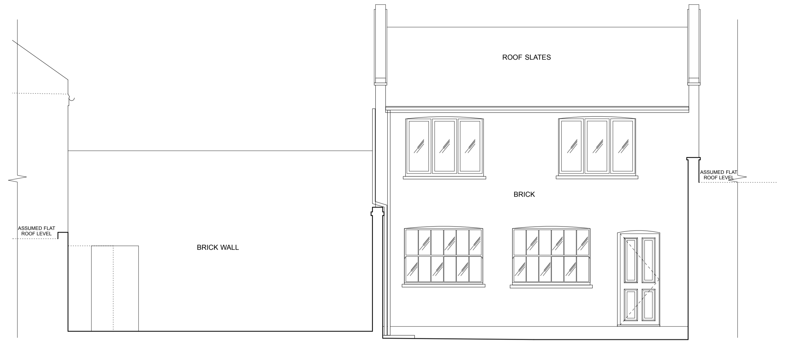
02/P07 Existing Mews House Elevation