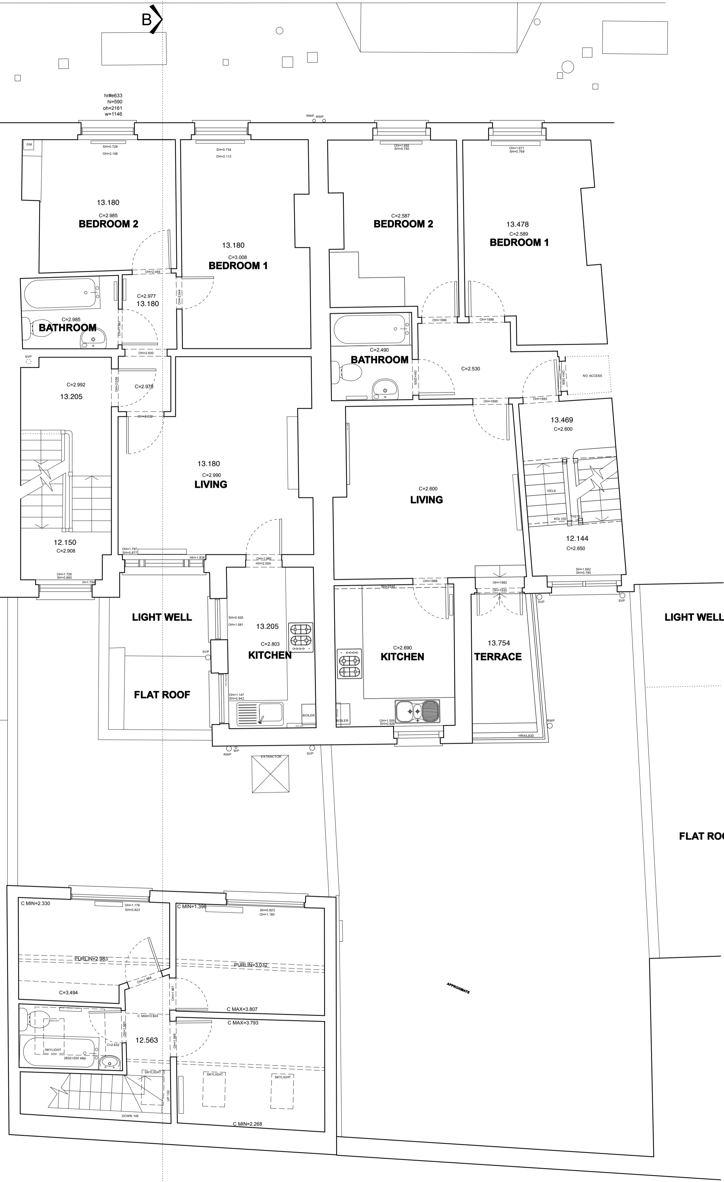
01/P03 Existing First Floor Plan