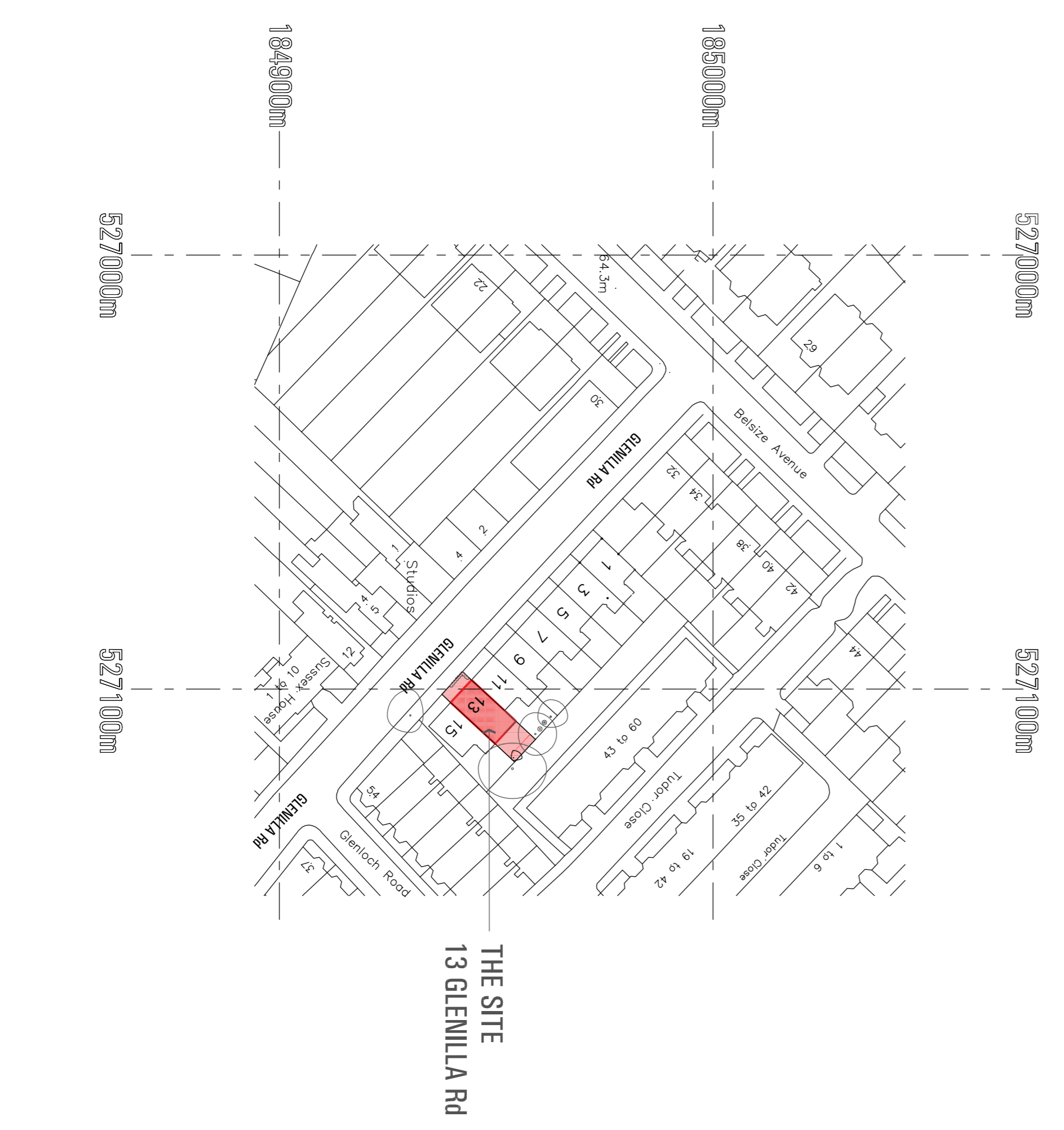
01. LOCATION PLAN 1:1250