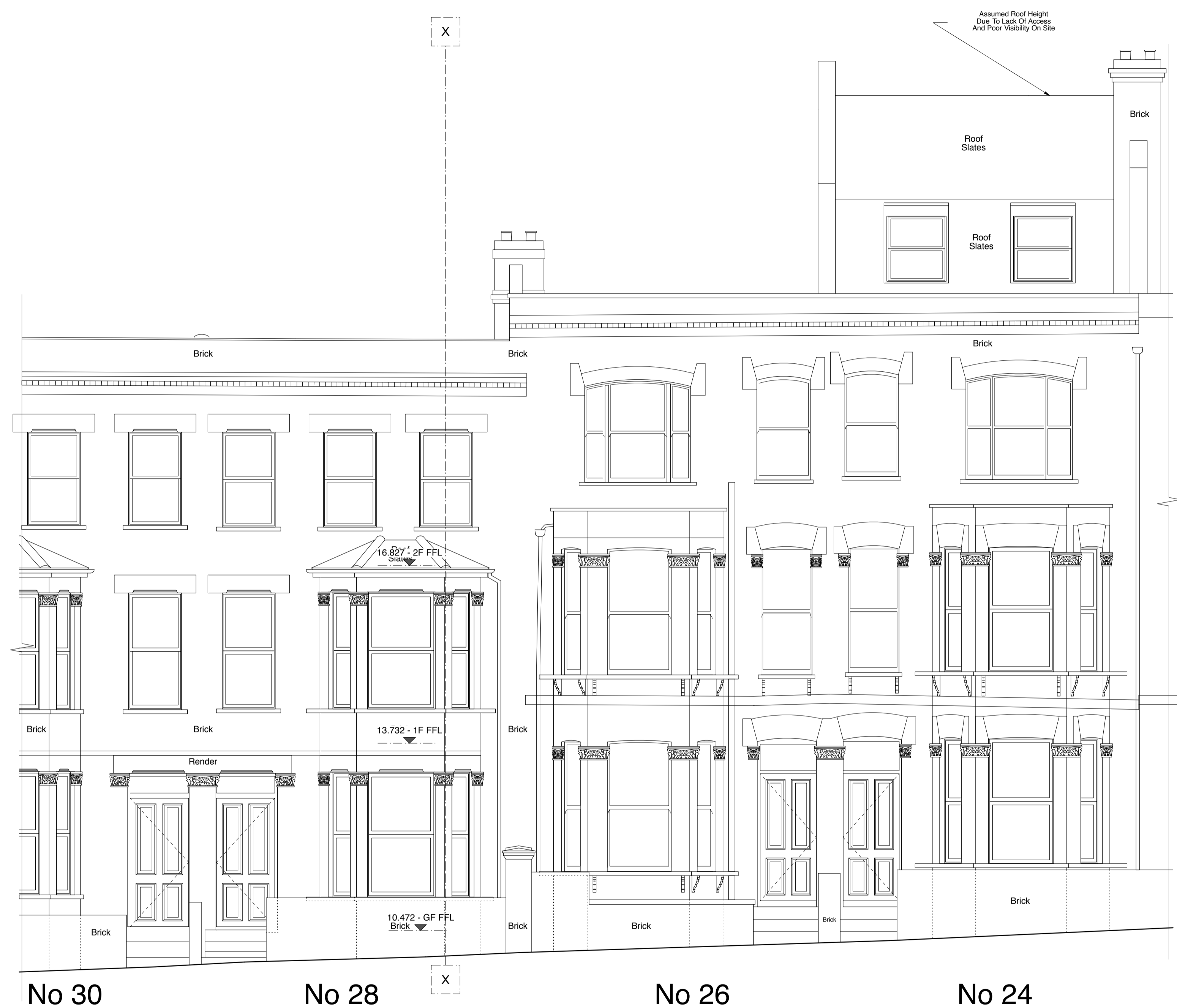
01/P07 Existing Front Elevation E1