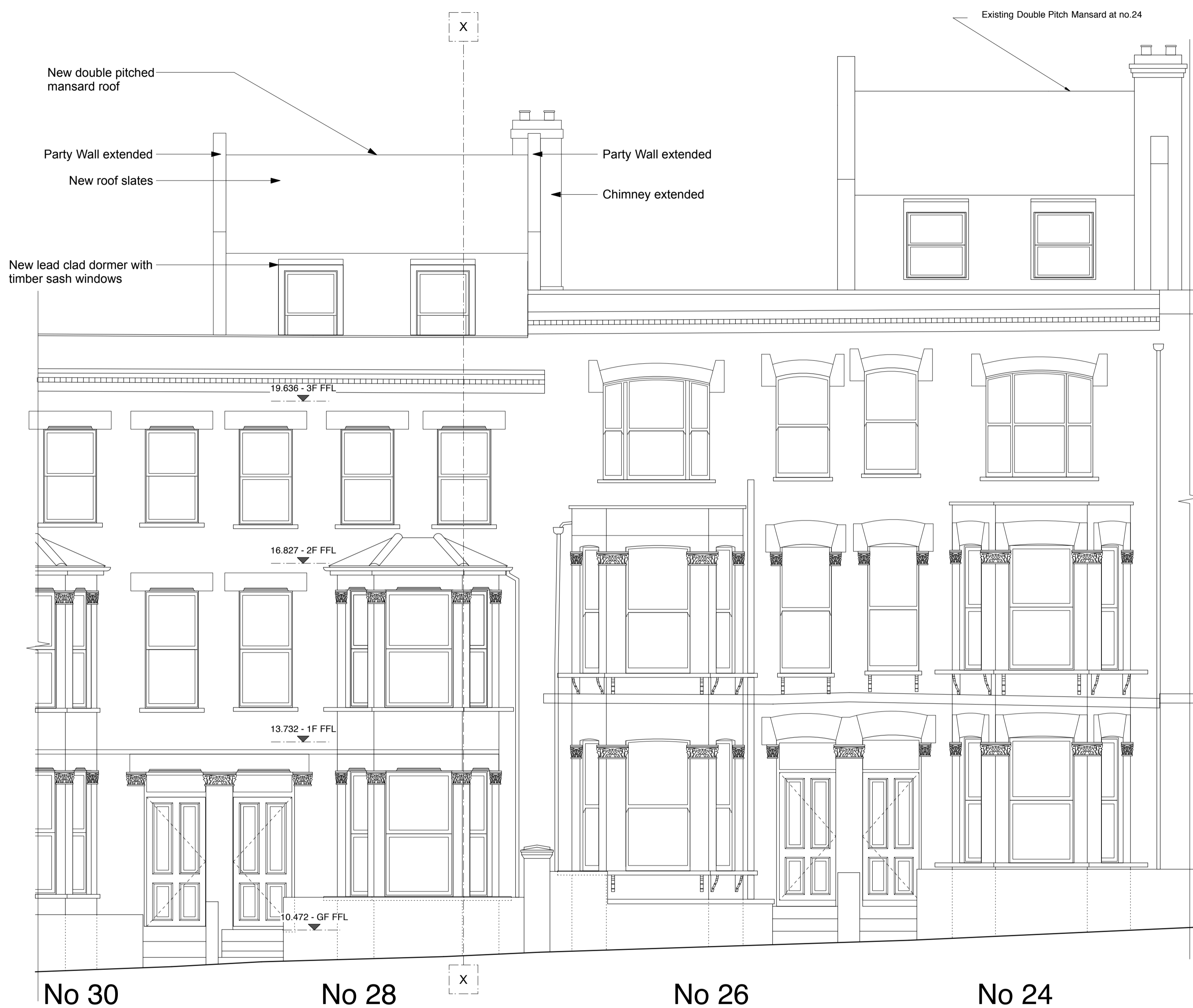
01/P14 Proposed Front Elevation E1