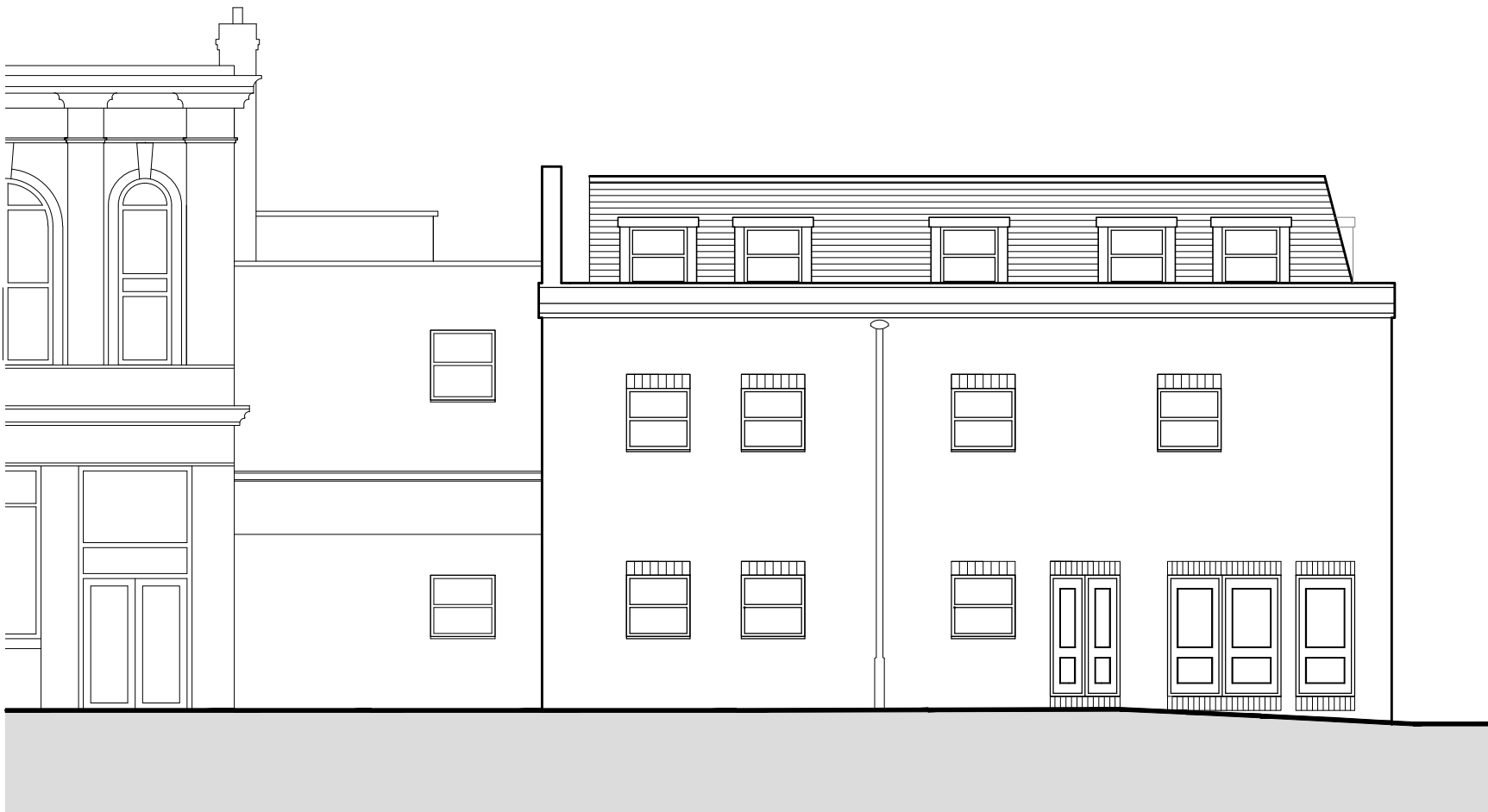
South Elevation to Palmerston Road

This Drawing is Copyright. © Note: All dimensions to be checked on site and not to be scaled from drawing.