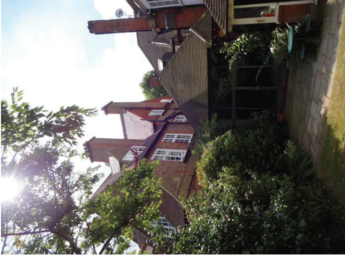
③ No. 19 Wadham Gardens as viewed from the rear garden of No.17