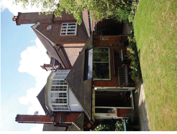
④ No. 15 Wadham Gardens as viewed from the rear garden of No.17