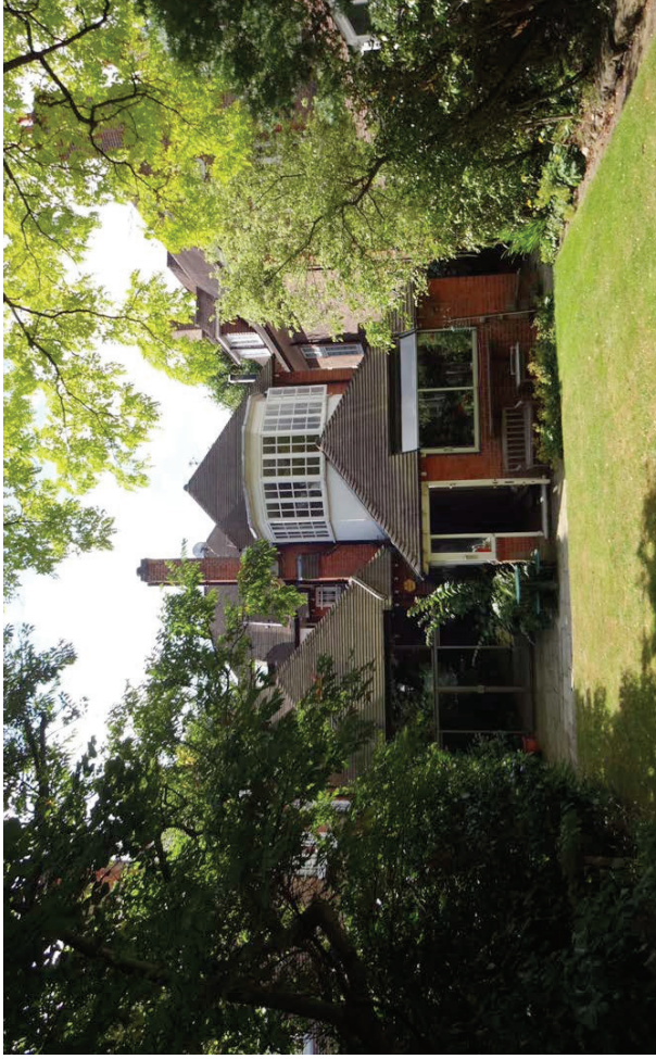
② No. 17 Wadham Gardens as viewed from the rear garden