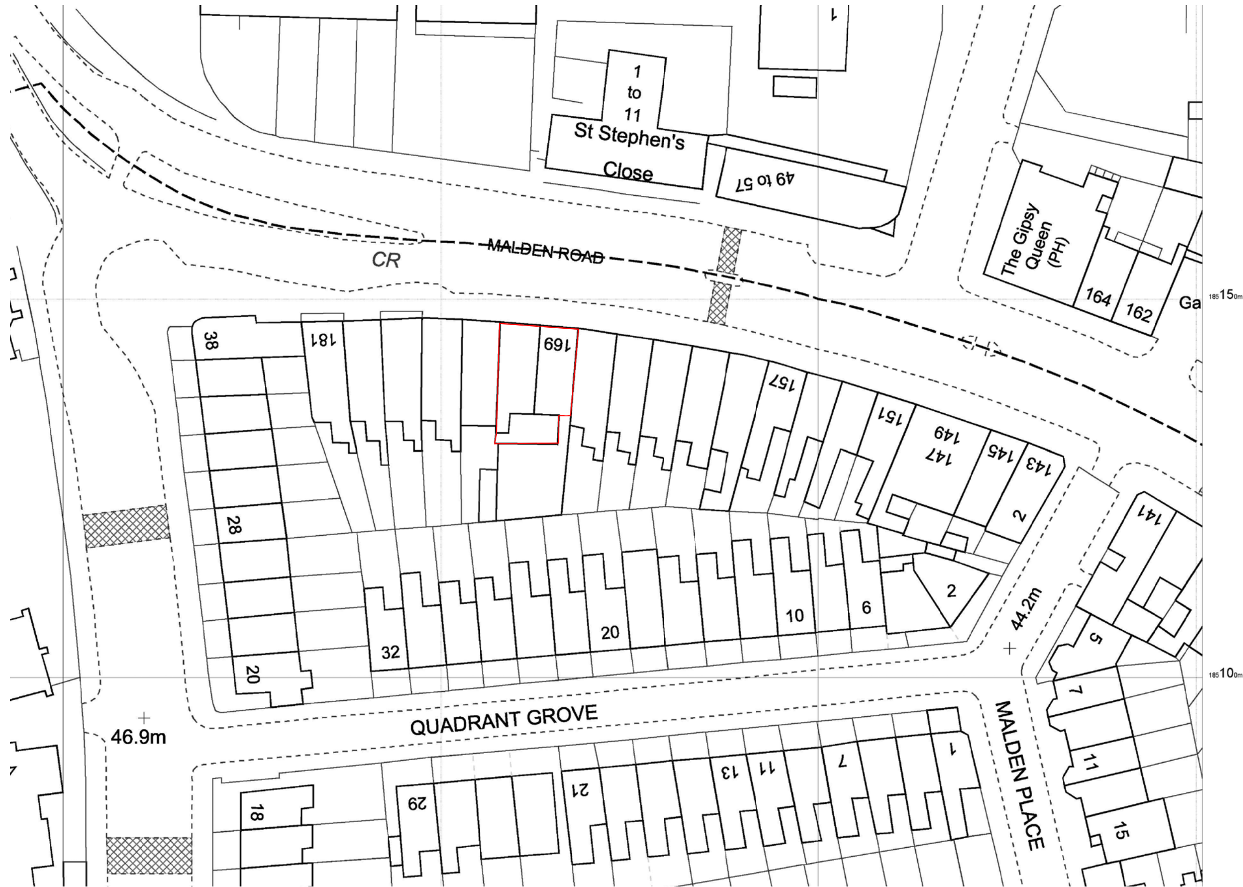
LOCATION MAP 1:500