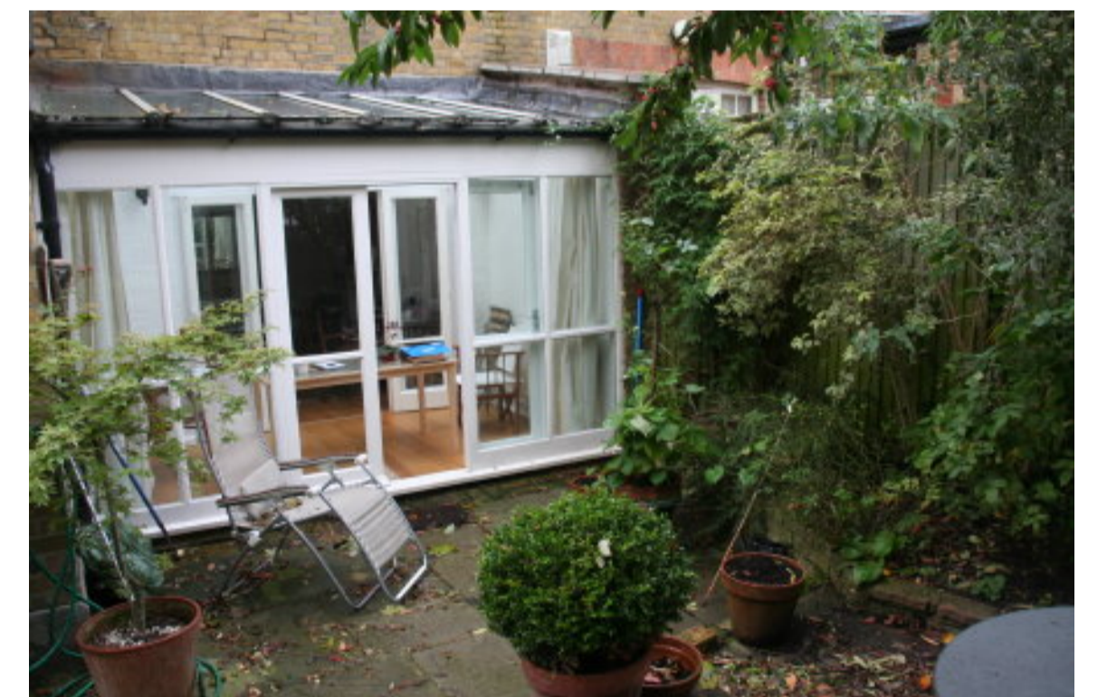
Photo 2: view of the conservatory/study to the rear of 41A Howitt Road, with the existing masonry Party Wall with no. 39 to the right.