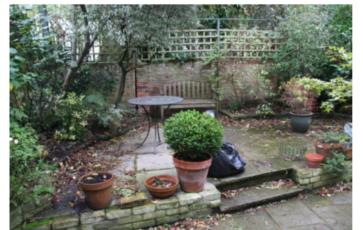
Photo 3: view of the rear garden to 41A Howitt Road, showing the impervious stone paving covering most of the existing garden.