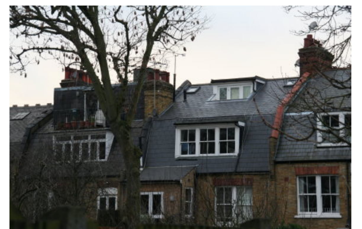
Photo 4: view of the rear of 41 Howitt Road in the centre of this photo, with no. 43 to the left and no. 39 to the right, showing the existing pollarded tree just behind no. 41's garden.