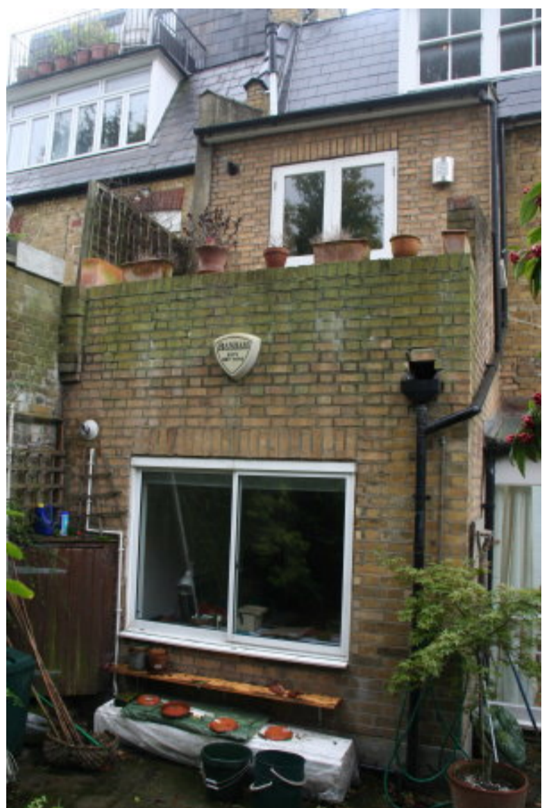
Photo 1: view of existing single storey rear extension to 41A Howitt Road and first floor extension above. rear of no. 43 is to the left.