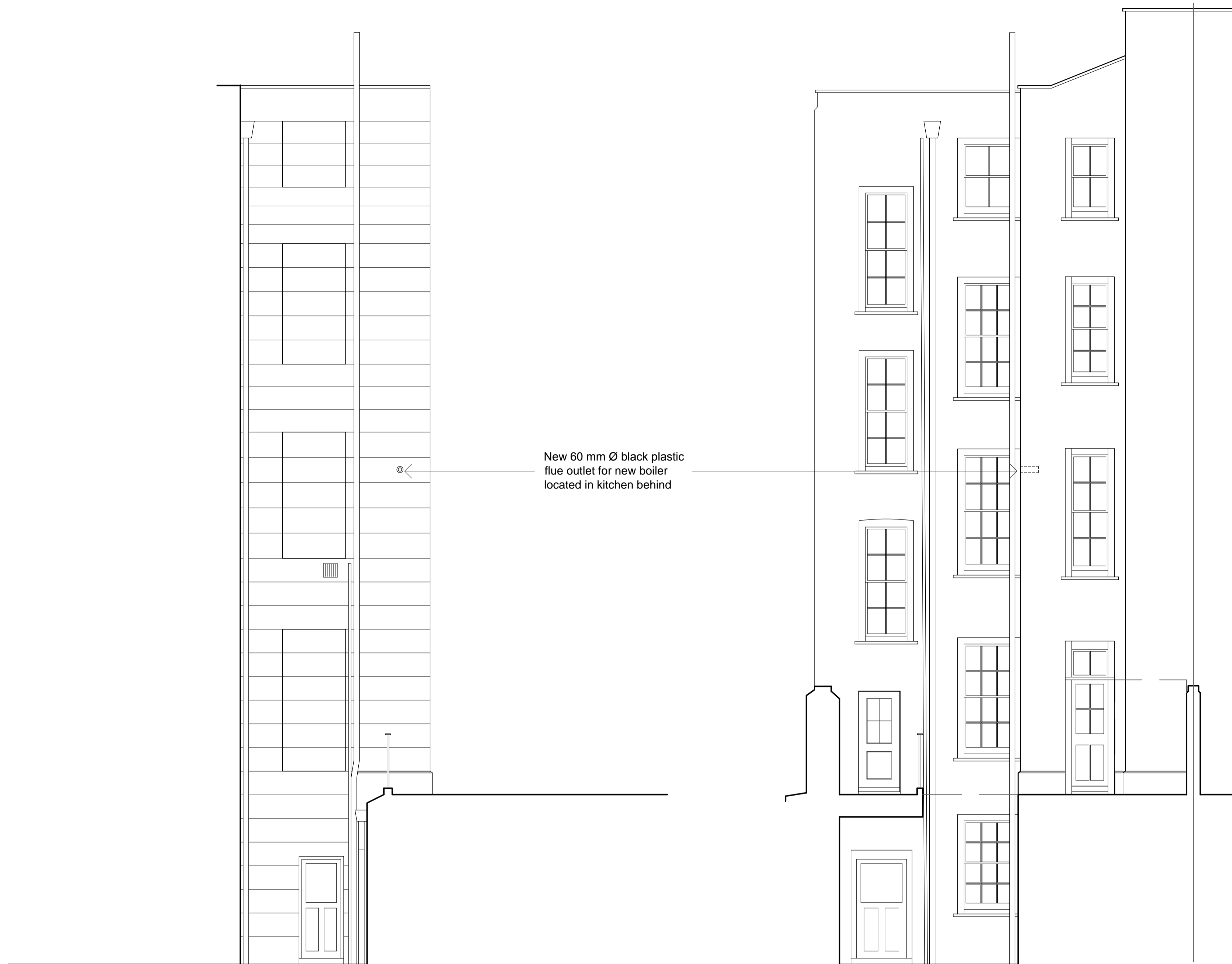
01 Rear External Elevation as Proposed 2200 1:50