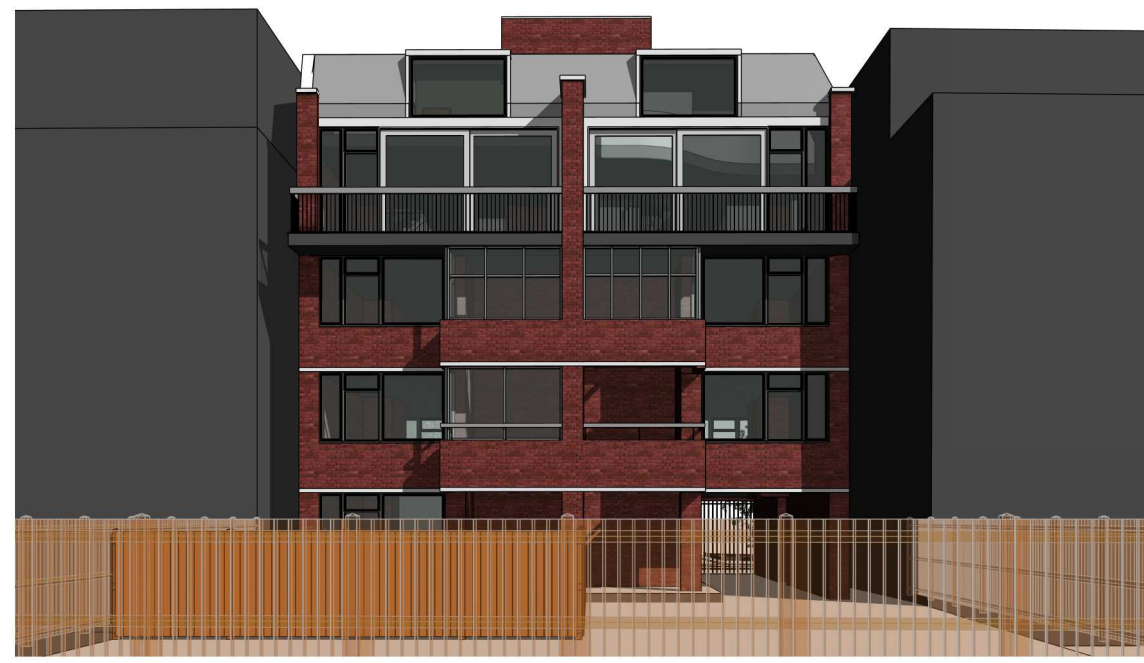
2 View from Rear Garden