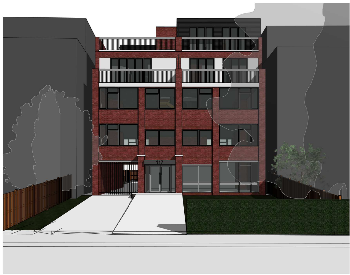
1 View from Haverstock Hill