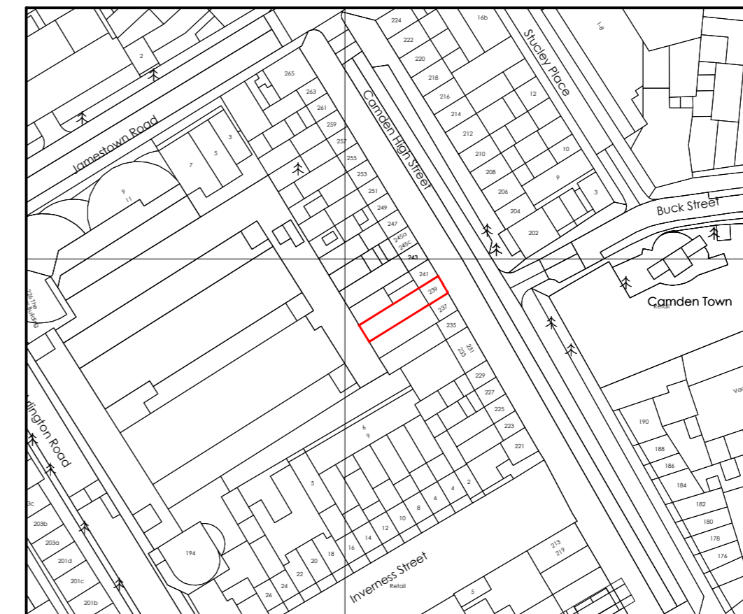
proposed store existing site location plan scale - 1:1250 @ A2

ALL DIMENSIONS TO BE CHECKED ON SITE. DO NOT SCALE FROM THIS DRAWING EXCEPT FOR THE PURPOSES OF LOCAL AUTHORITY PLANNING