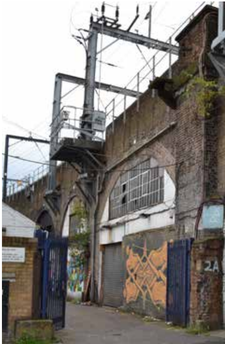
Plate 239: Exterior view from Water Lane