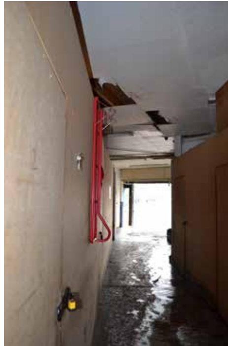
Plate 246: Ground floor, view towards the entrance