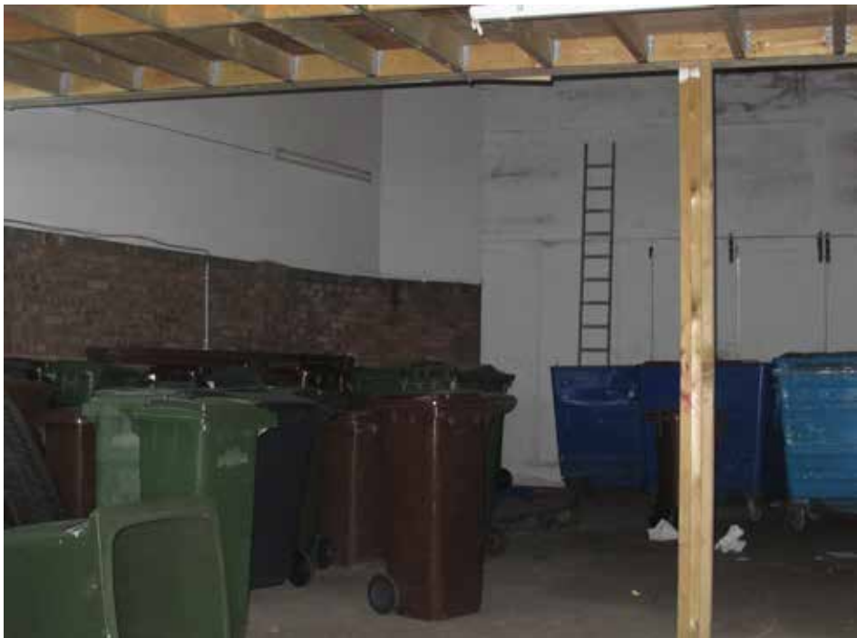
Plate 277: In- fill interior