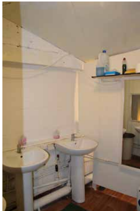
Plate 249: First floor - mosque wash room