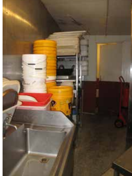
Plate 301: Hallway from the kitchen to toilet