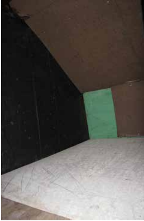
Plate 374: Arch - First floor space