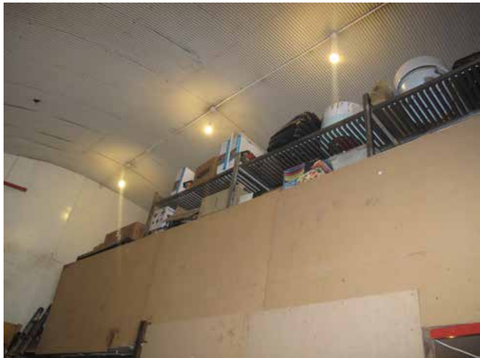
Plate 290: Mezzanine floor created by wooden partitions