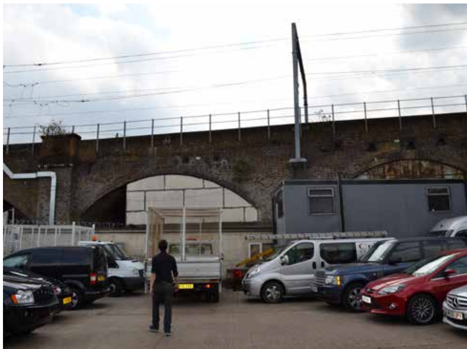
Plate 273: Entrance of in-filled part of arch from Torbay Street