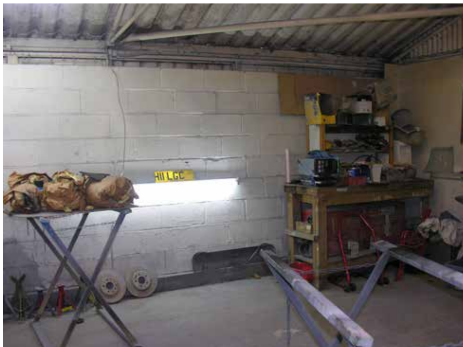
Plate 313: Interior of arch - view towards arch N12