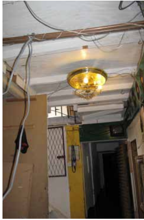
Plate 338: Arch - Corridor at landing of stair 1 (ground floor)