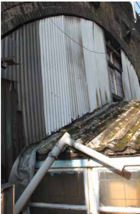
Plate 288: Arch - rear view