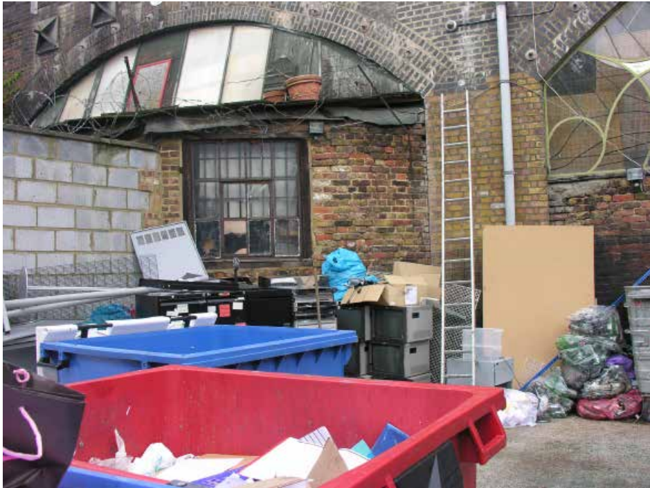
Plate 349: Arch - frontal view from Leyborune Road