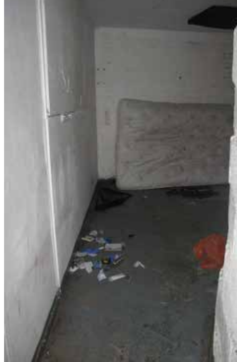
Plate 323: Arch - room 1 to immediate left from entrance (ground floor)