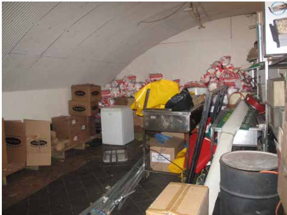
Plate 295: Mezzanine floor - view towards the front of the arch