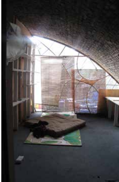
Plate 337: Arch - Room 3 to left (towards Leybourne Street) (first floor)