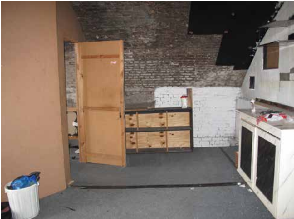
Plate 376: Arch - First floor space