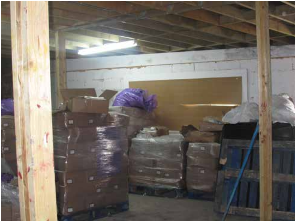
Plate 274: In- fill interior