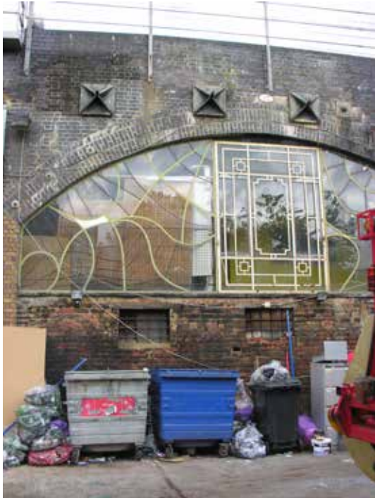
Plate 320: Arch - frontal view from Leyborune Road