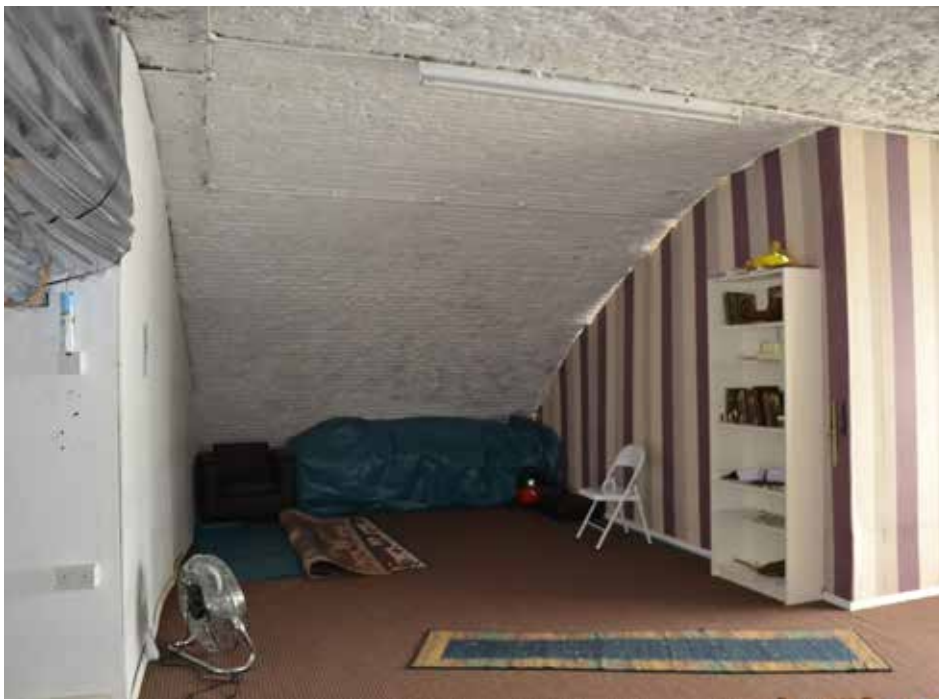
Plate 253: First floor - mosque prayer room