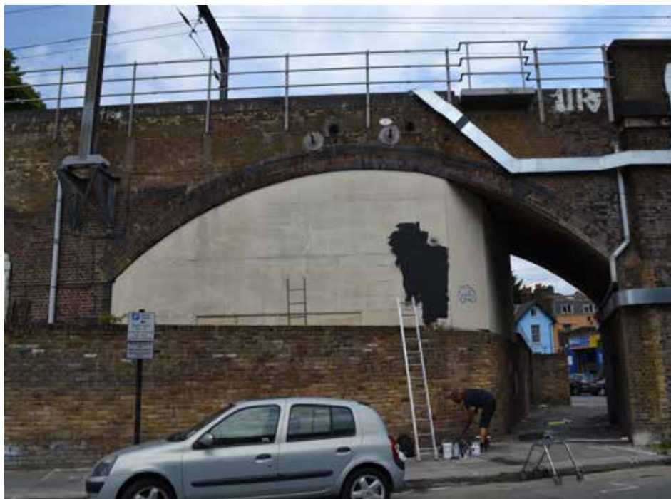
Plate 268: Side view of arch from Leybourne Road