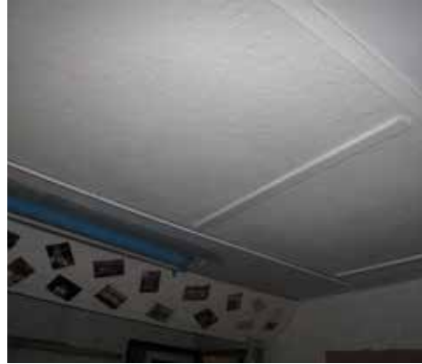
Plate 326: Arch - room 2 on left side (ground floor)