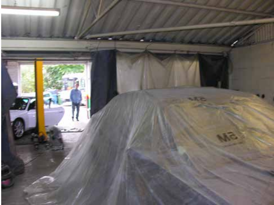
Plate 316: Interior of arch - view towards the entrance