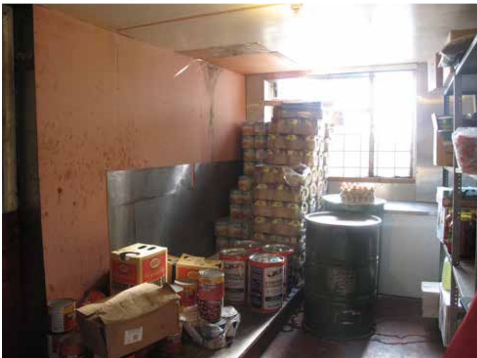
Plate 299: External window to the rear of the arch - view from the food storage area