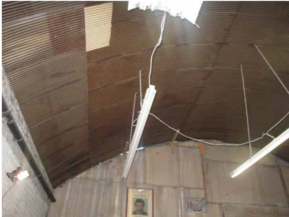
Plate 306: Under-side of arch