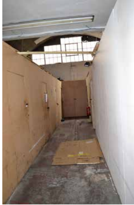
Plate 242: Ground floor, view towards rear of arch