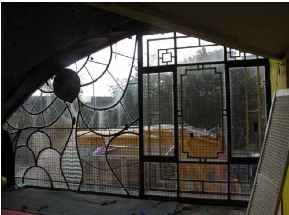
Plate 336: Arch - Room 2 to left (towards Leybourne Street) (first floor)