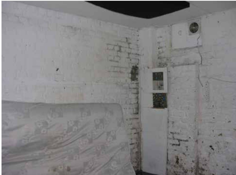
Plate 324: Arch - room 1 to immediate left from entrance (ground floor)