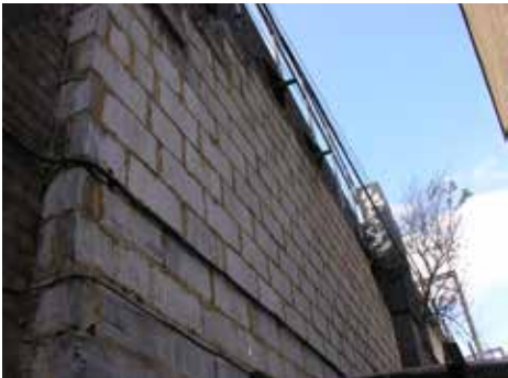
Plate 364: Concrete masonry in-fill to the rear of the arch