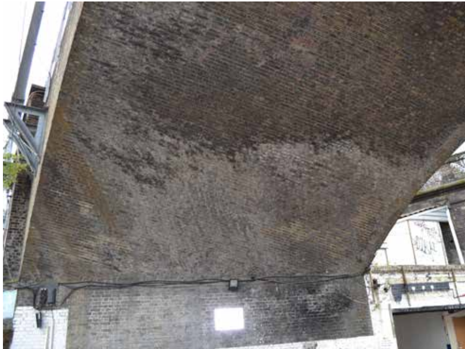
Plate 262: Underside view of arch