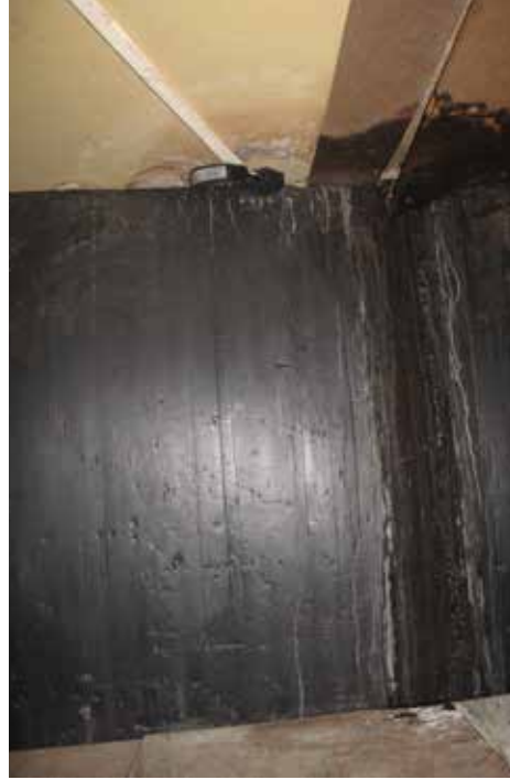
Plate 375: Arch - First floor space