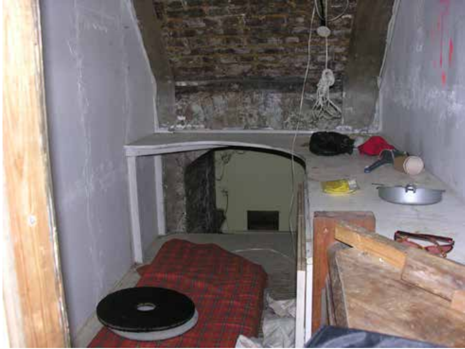
Plate 377: Arch - First floor space