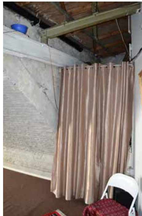
Plate 256: First floor - mosque prayer room, end of arch