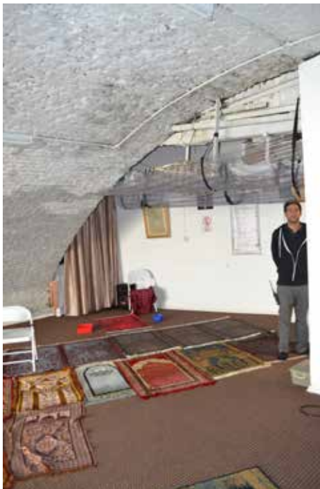
Plate 255: First floor - mosque prayer room, end of arch