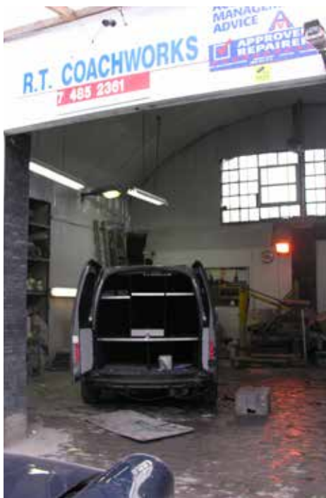
Plate 281: Interior of arch