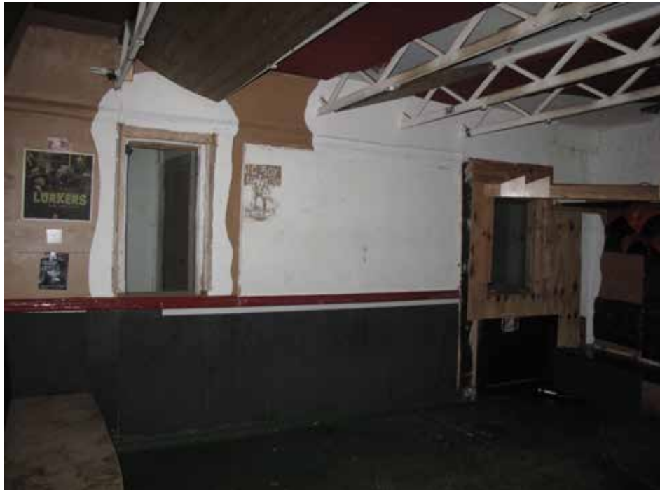
Plate 353: Arch - main space (ground floor)