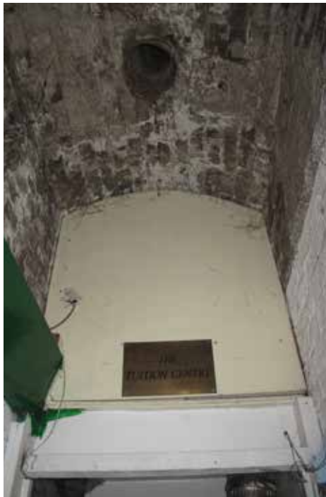
Plate 339: Partition between arch N12 and N13