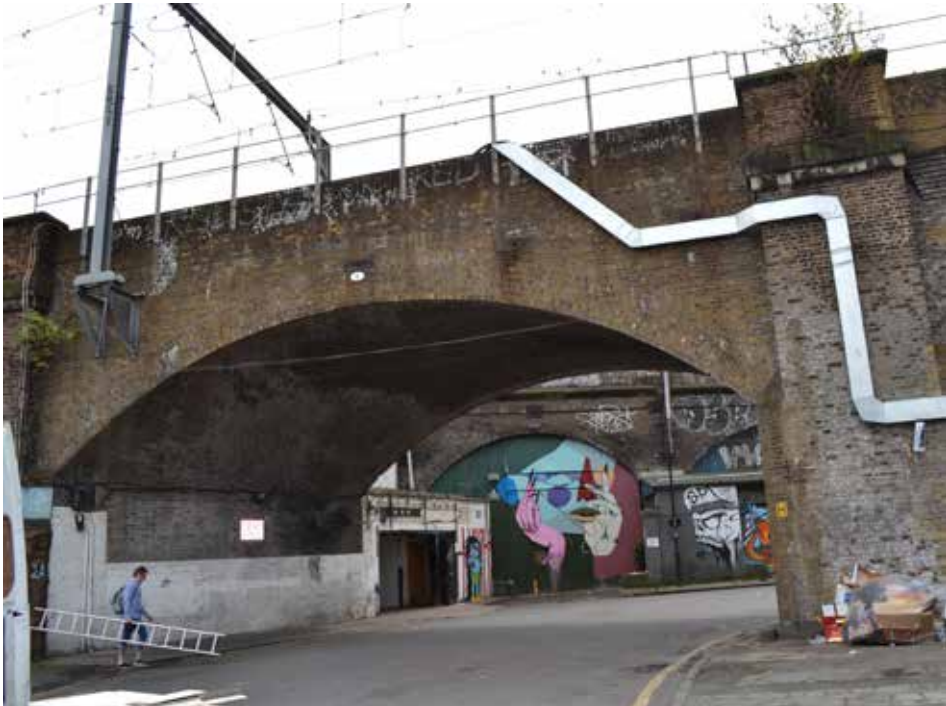
Plate 260: Side view of arch from Torbay Street