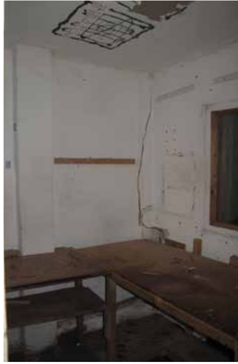
Plate 371: Arch - Ground floor space