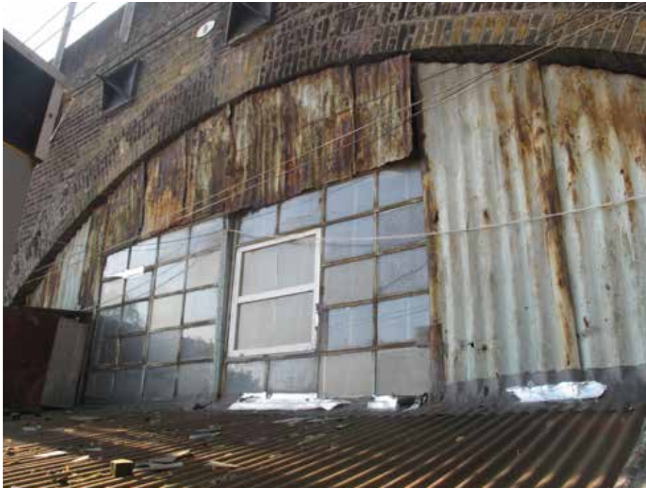
Plate 280: Top of arch - rear view