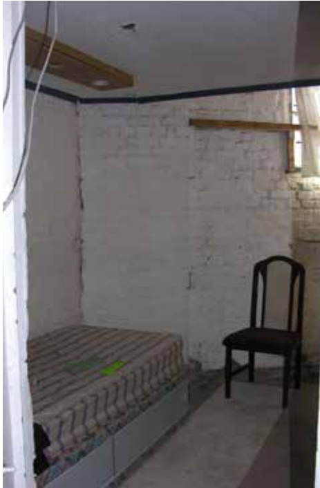
Plate 328: Arch - room 3 on left side (ground floor)