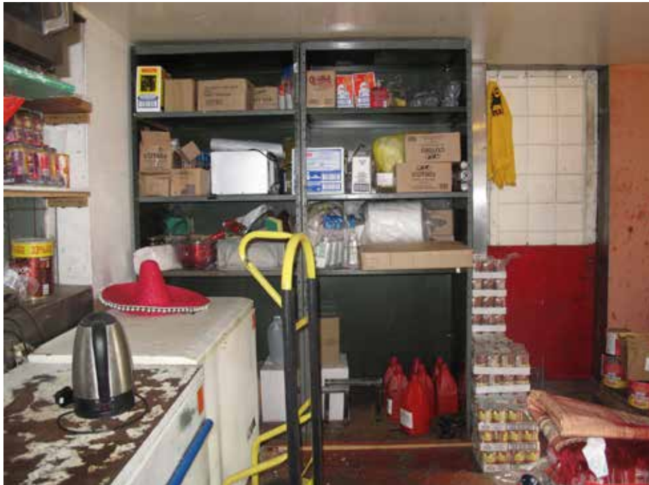
Plate 298: Back door - view from the food storage area