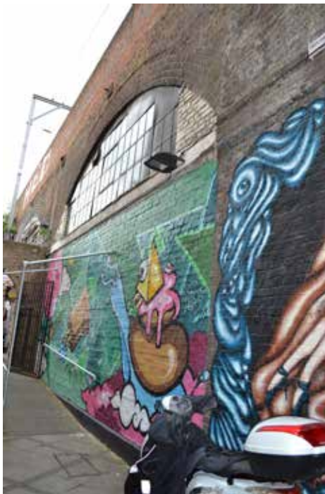
Plate 237: Rear arch view