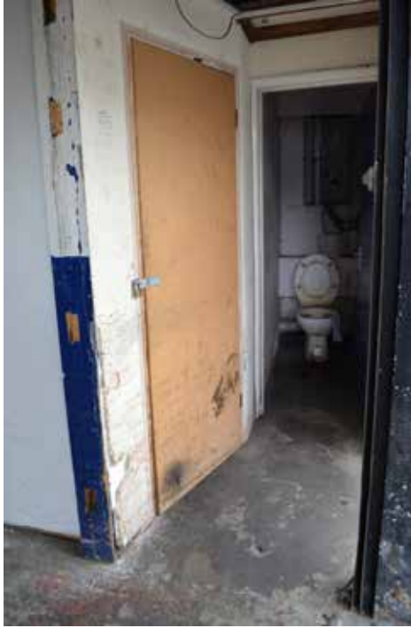
Plate 241: Ground floor, view from entry towards side Toilet