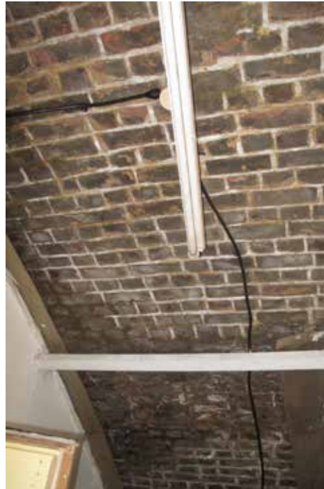
Plate 379: Arch - First floor space