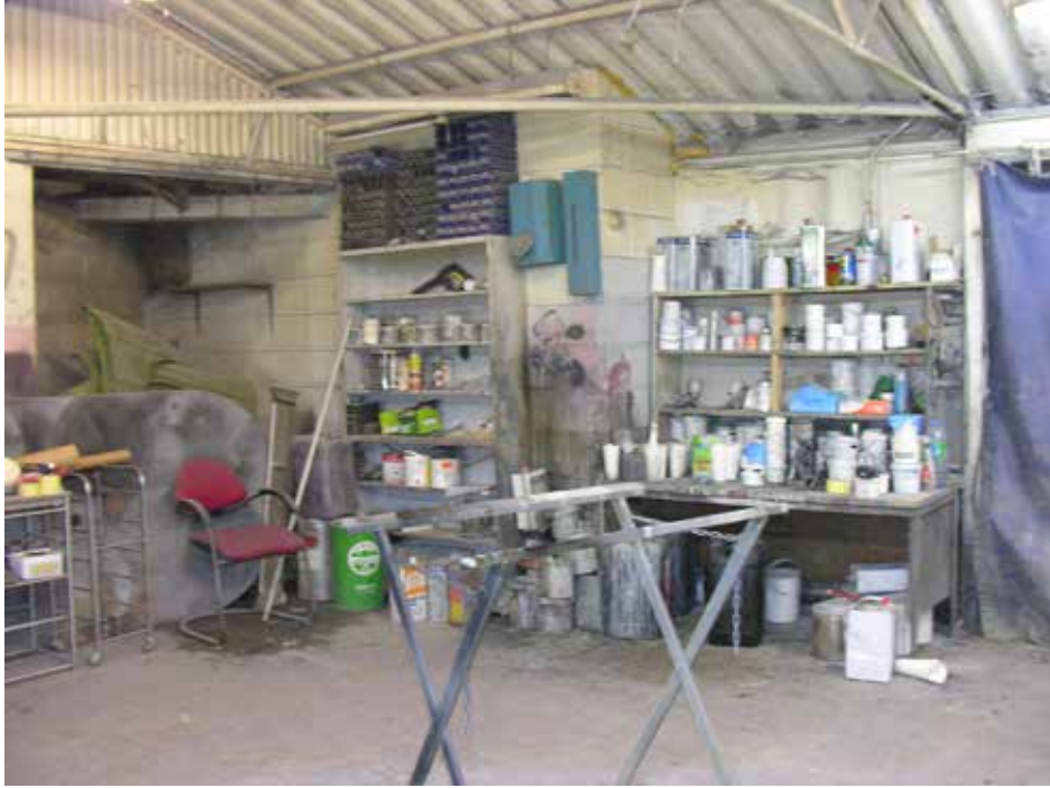
Plate 314: Interior of arch - view towards arch N10