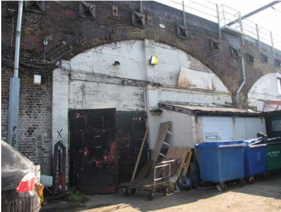
Plate 287: Arch - view from yard accessible from Leybourne Road