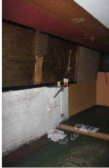
Plate 351: Arch - main space (ground floor) Plate 352: Arch - main space (ground floor)