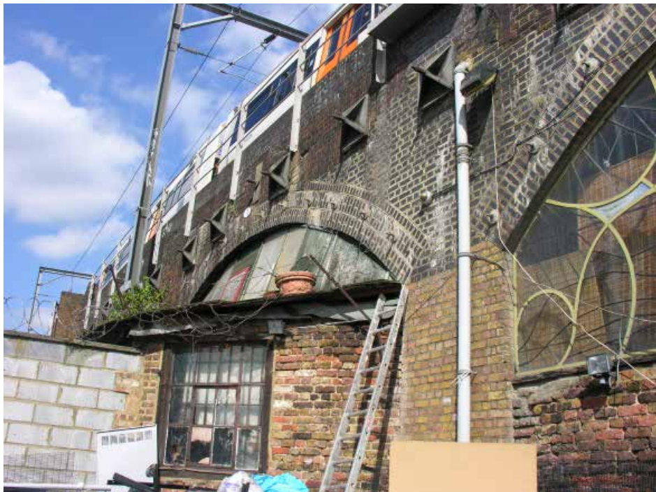
Plate 350: Arch - view from Leyborune Road (Arch N12 situated to the right)