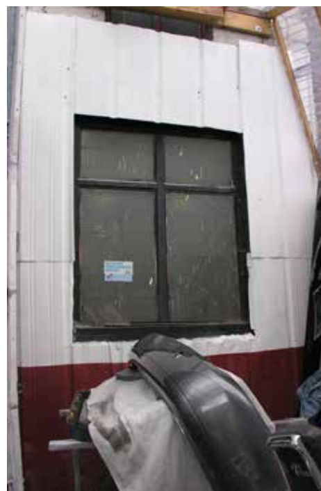
Plate 282: Exterior window, right of the entrance, Leybourne Road