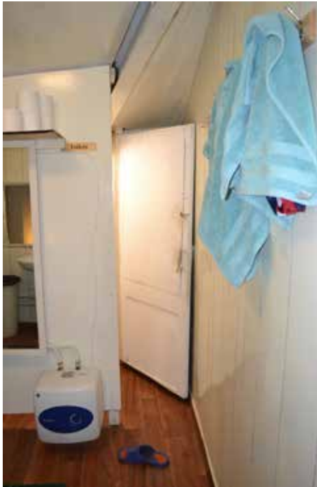
Plate 250: First floor - mosque wash room