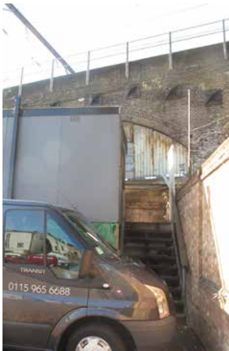
Plate 279: Arch - rear view