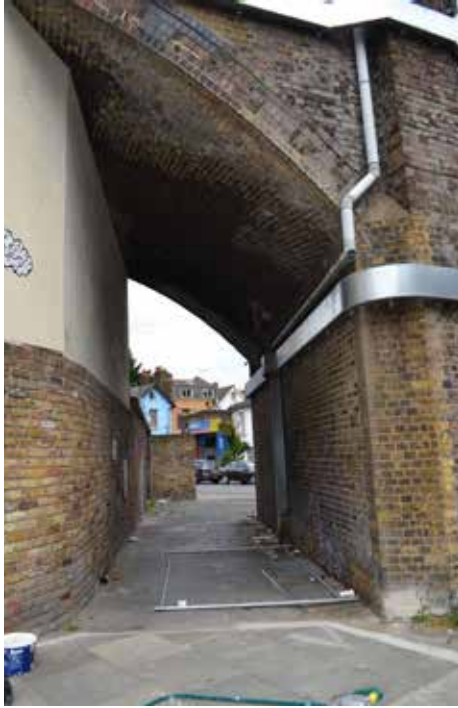
Plate 269: View of public access route of arch from Leybourne Road