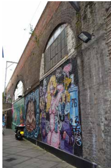
Plate 238: Rear arch view