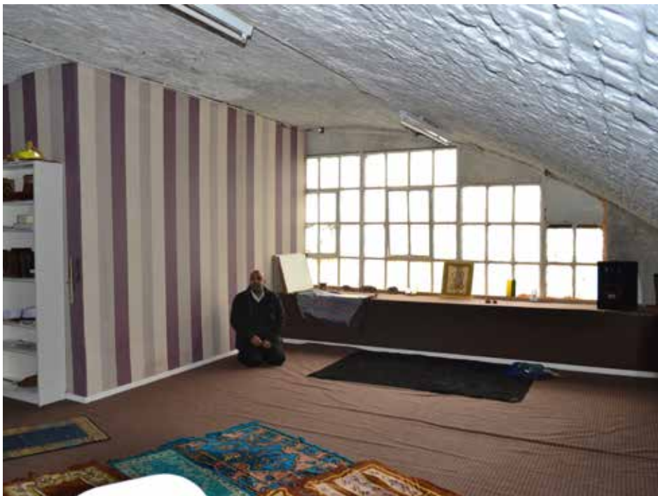
Plate 251: First floor - mosque prayer room, view towards water lane