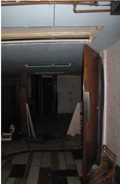
Plate 354: Arch - secondary space (ground floor)