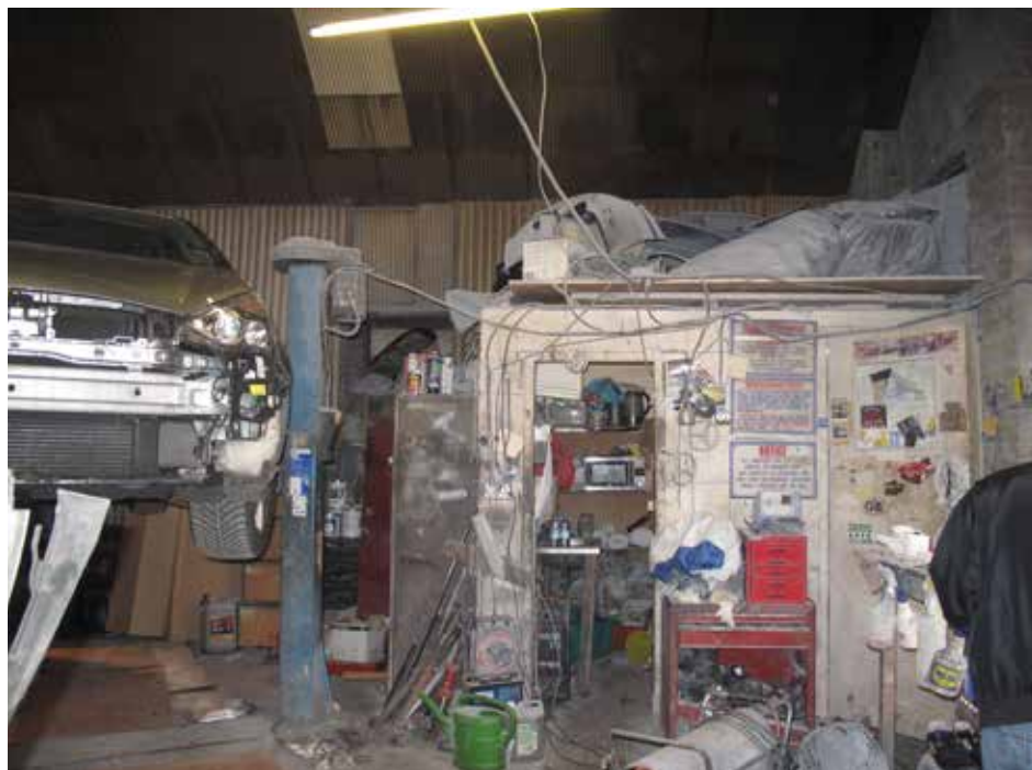
Plate 307: Wooden shed built inside the arch - view towards arch N9