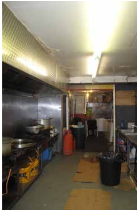
Plate 303: Kitchen - view towards the food storage area