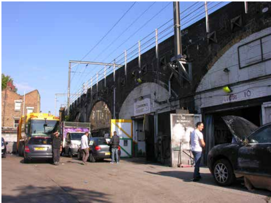
Plate 311: Arch - view in relation to arch N10 and N12