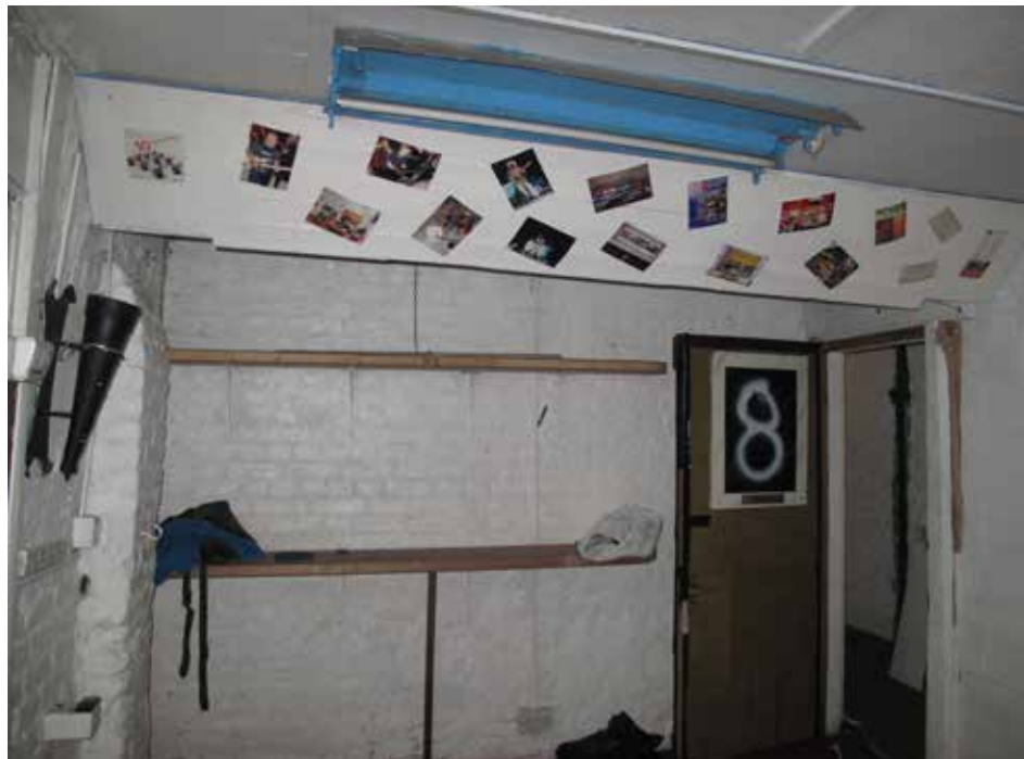
Plate 327: Arch - room 2 on left side (ground floor)