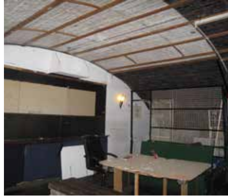
Plate 357: Arch - main space (stair from ground floor landing to the right in the background (first floor))