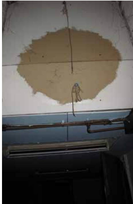
Plate 373: Partition between arch N13 and N14