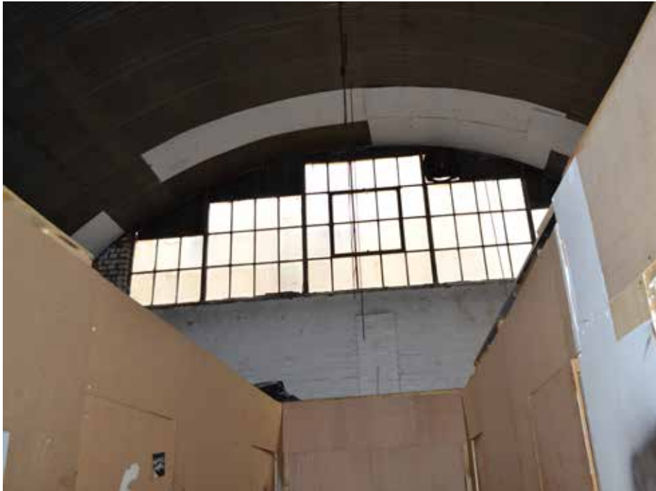
Plate 243: Ground floor, glazing of rear arch