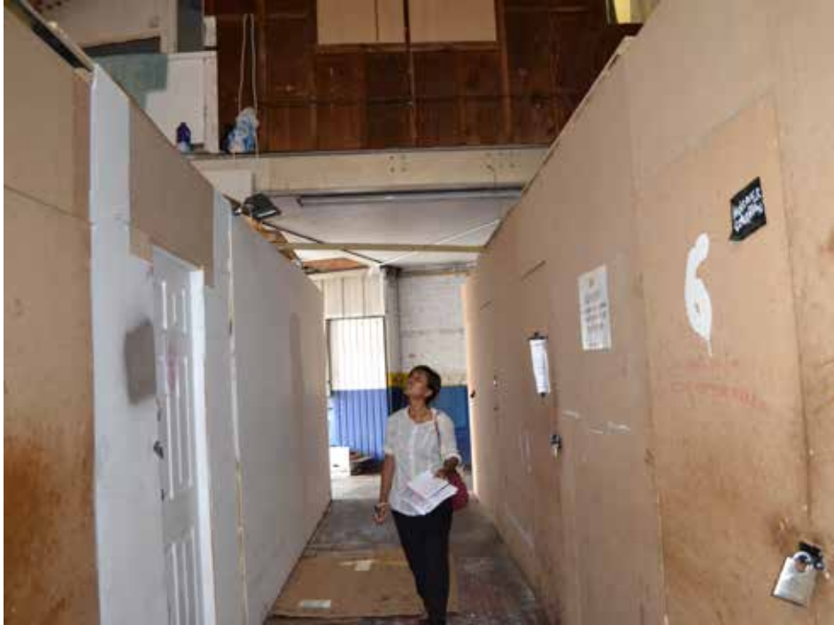
Plate 244: Ground floor, view towards side of arch