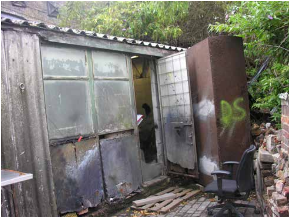
Plate 318: Back door to the rear of the arch - exterior view