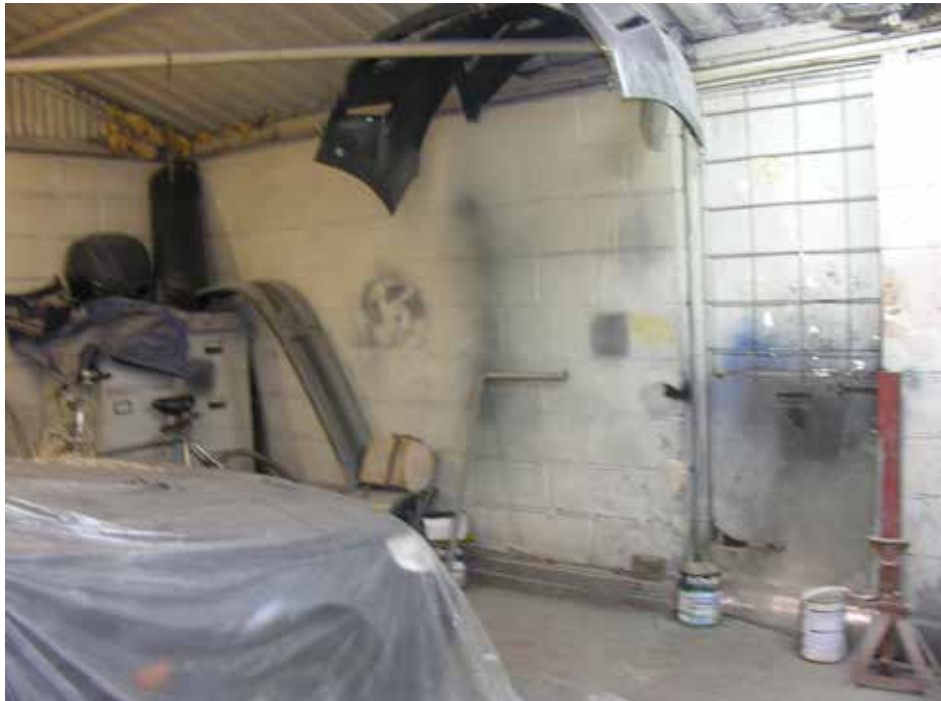
Plate 317: Back door to the rear of the arch - interior view