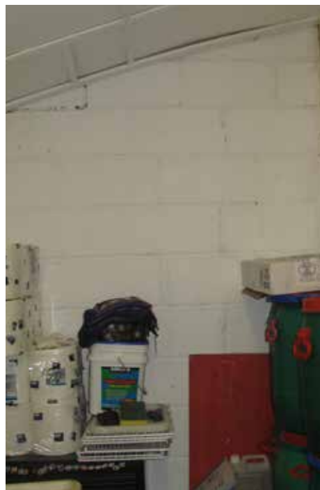
Plate 293: Below mezzanine storage space - view towards the front of the arch