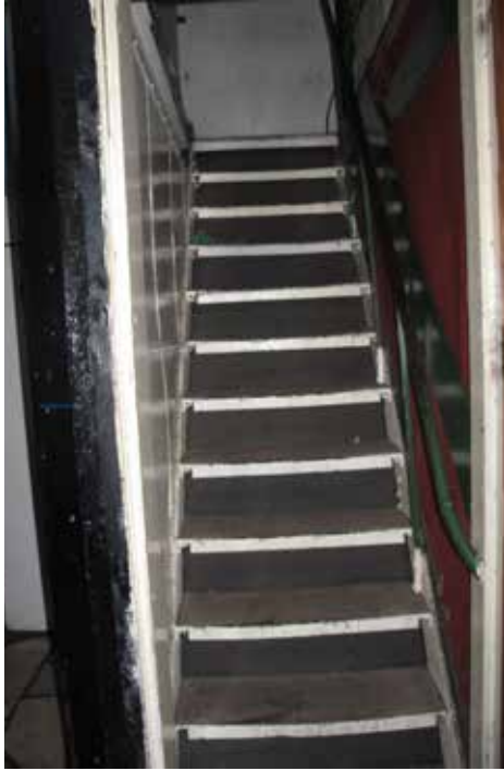
Plate 356: Arch - Stair to first floor (ground floor)