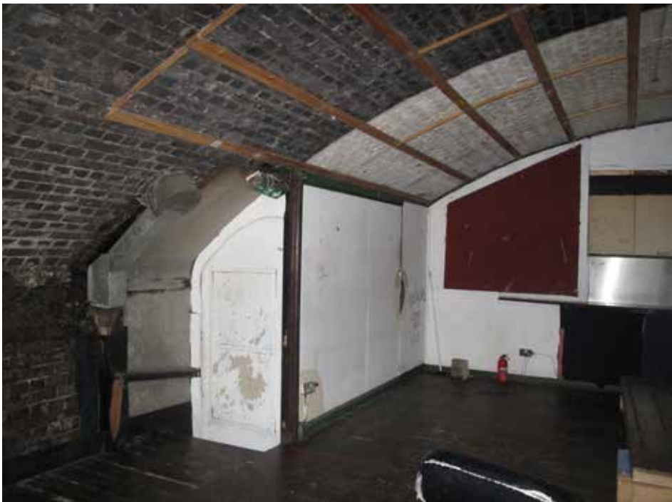
Plate 360: Arch - main space