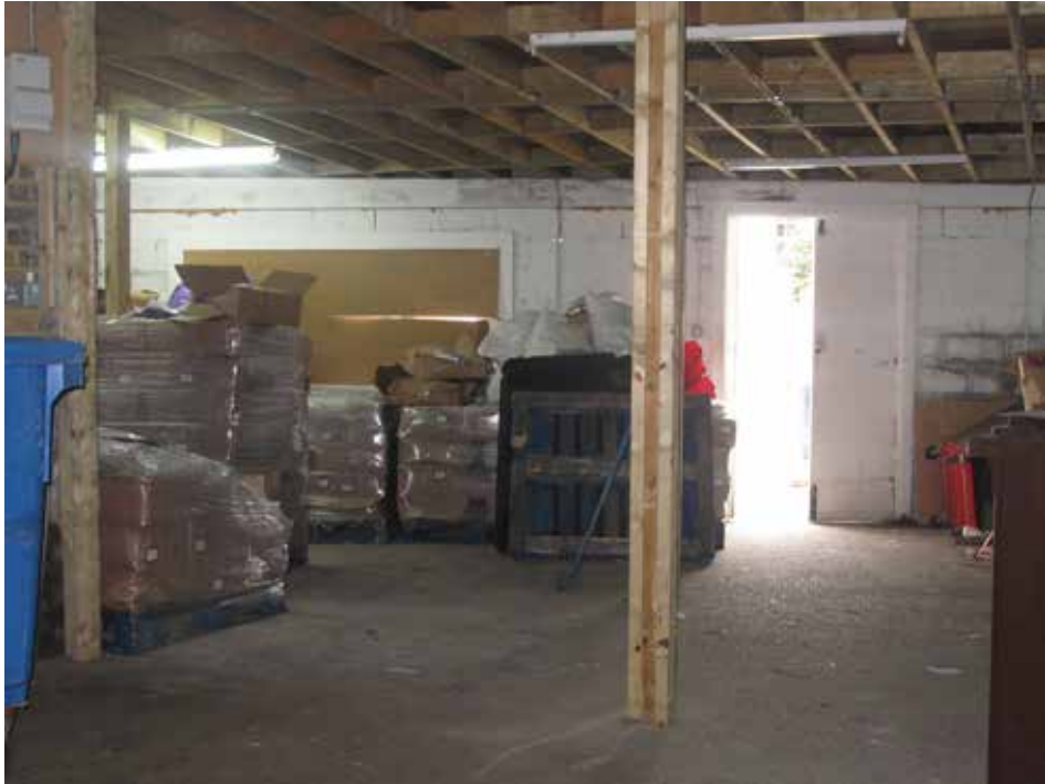
Plate 276: In- fill interior