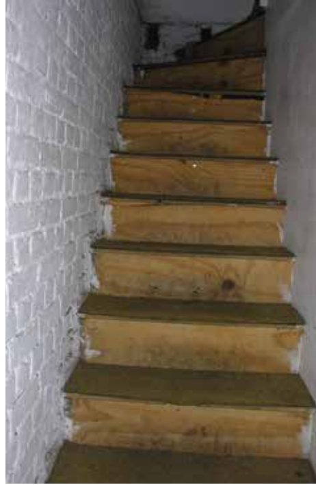
Plate 333: Arch - Stair 1 leading to first floor