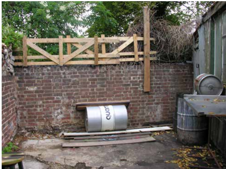
Plate 319: Back yard to the rear of the arch