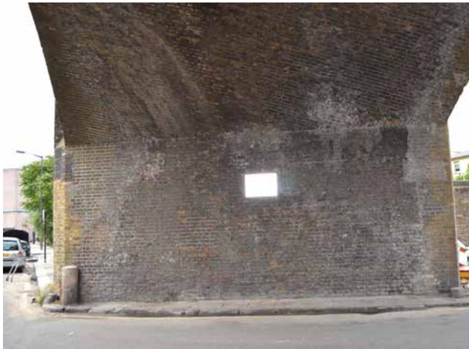
Plate 263: Underside view of arch