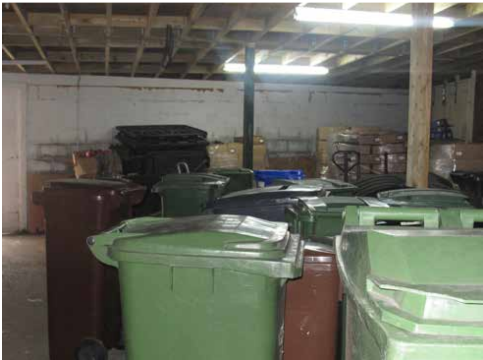
Plate 275: In- fill interior