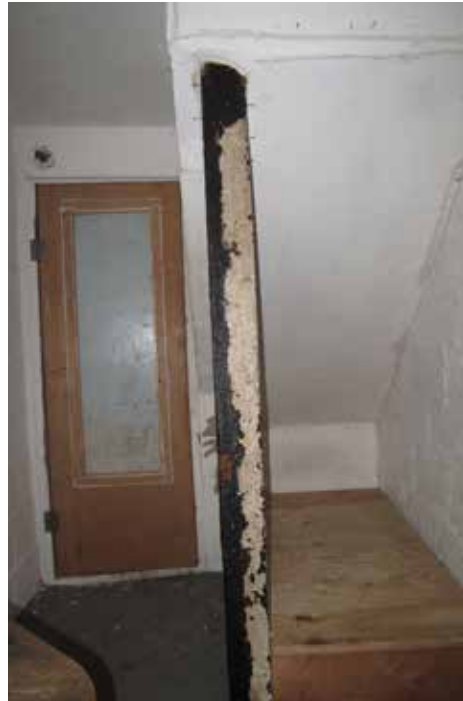
Plate 369: Arch - Ground floor space