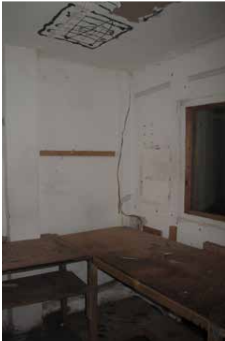
Plate 368: Arch - Ground floor space