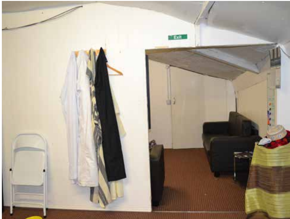
Plate 257: First floor - mosque room