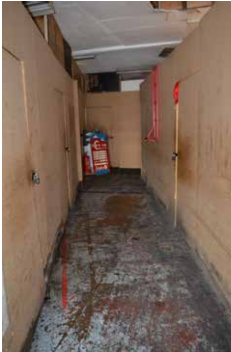
Plate 245: Ground floor, view between subdivided cubicles