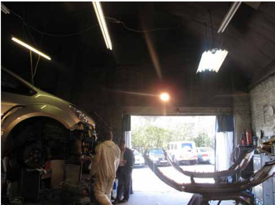
Plate 309: Arch - view towards the front