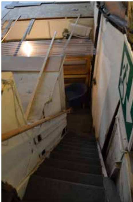
Plate 248: First floor- stairs to mosque