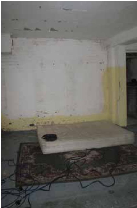
Plate 330: Mezzanine at stall no.240