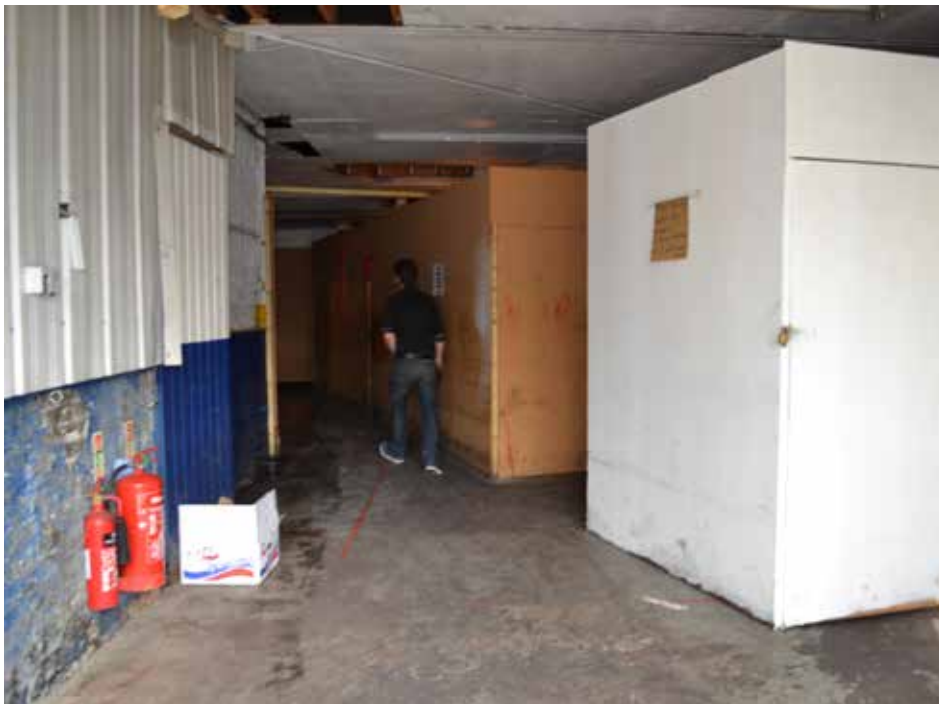
Plate 240: Ground floor, view from entry, interior subdivided into small cubicles