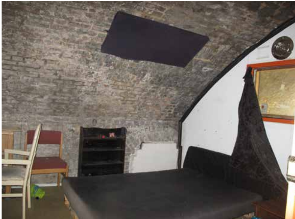
Plate 335: Arch - Room 1 to left (first floor)