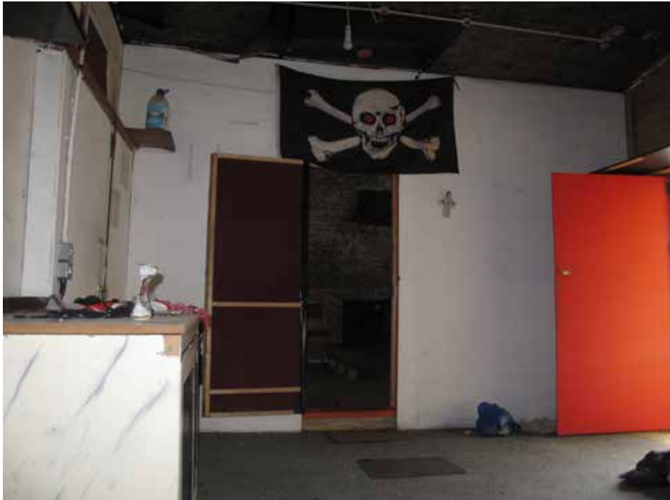
Plate 334: Room 1 ( landing for ground floor stair (as shown in plate 280) (first floor))