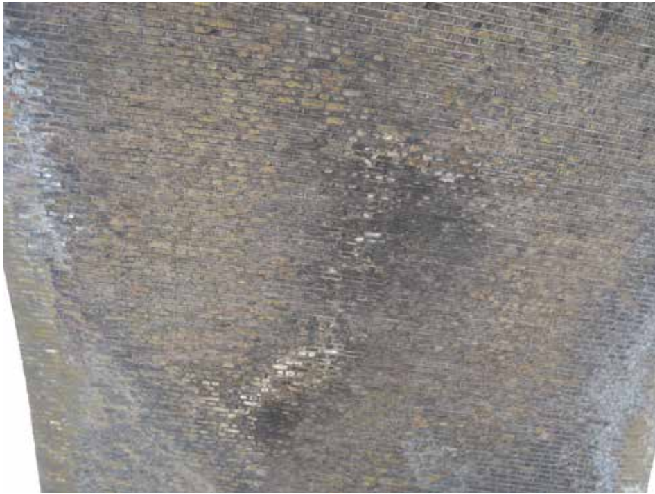
Plate 264: Underside view of arch