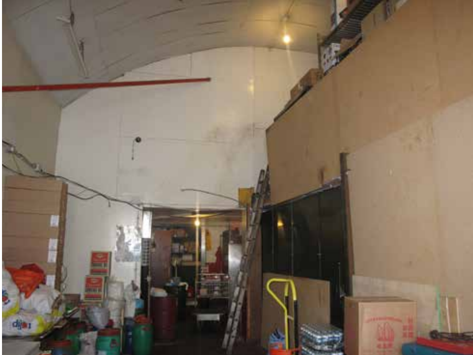
Plate 289: Interior of arch - view from the entrance