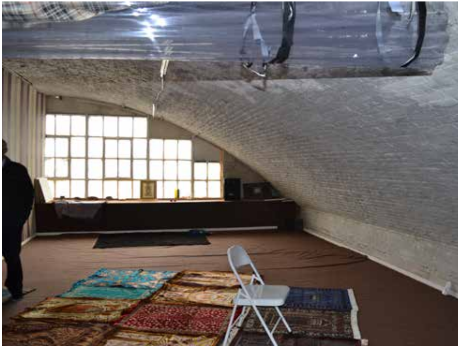
Plate 252: First floor - mosque prayer room, view towards water lane