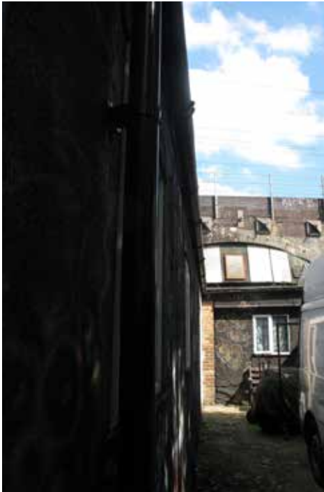
Plate 363: Arch - frontal view from Leyborune Road