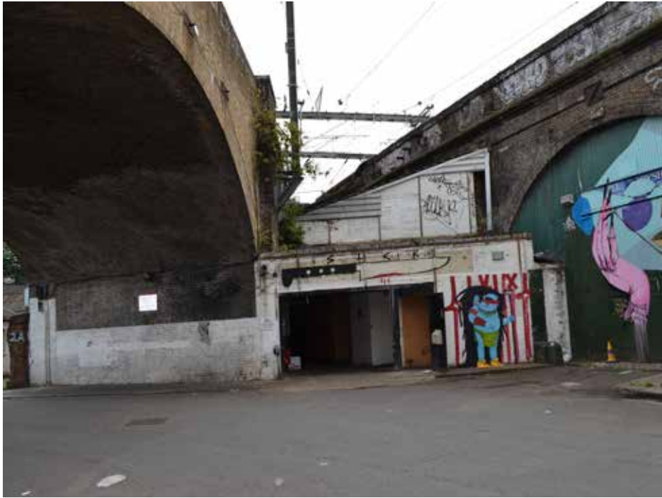
Plate 236: Front exterior view from Leybourne Road, enclosure between arches