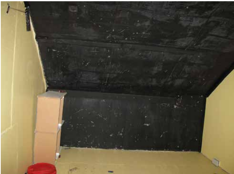
Plate 345: Room 2 to left (first floor)