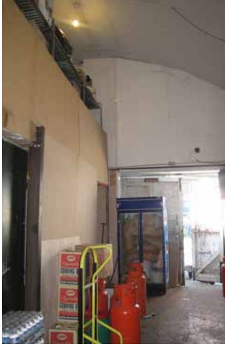
Plate 294: Interior of arch ,front space - view towards the entrance