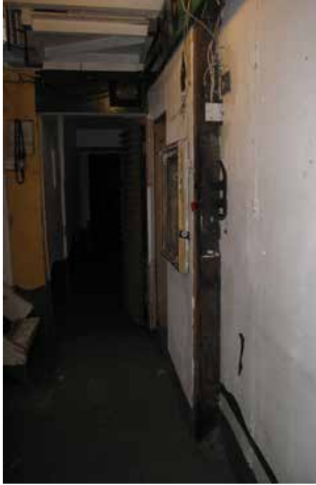
Plate 332: Arch - Hallway (leading into Arch N13 (ground floor))