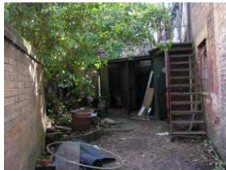
Plate 348: Arch - Rear space accommodation