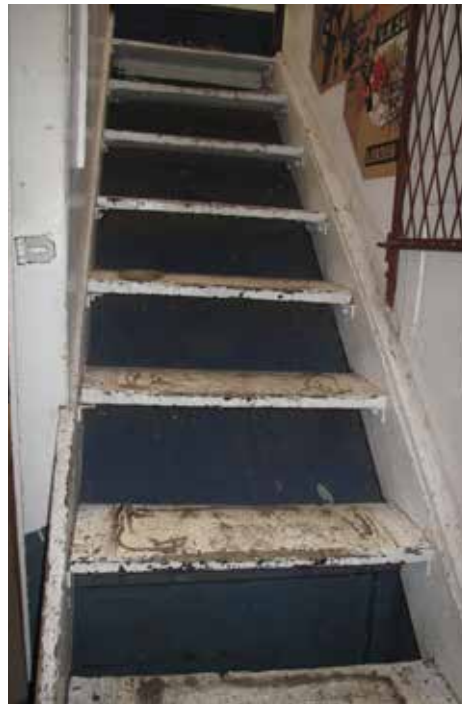
Plate 340: Arch - Stair 2 to first floor