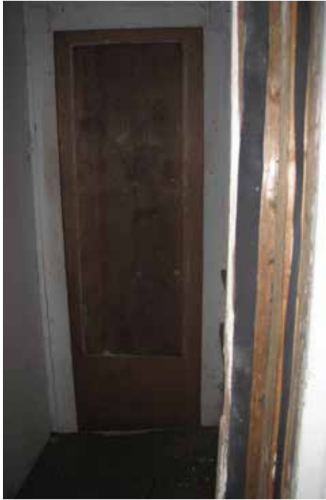
Plate 370: Arch - Ground floor space