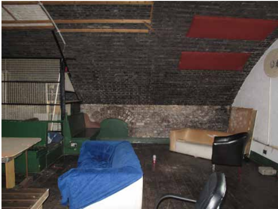
Plate 359: Arch - main space