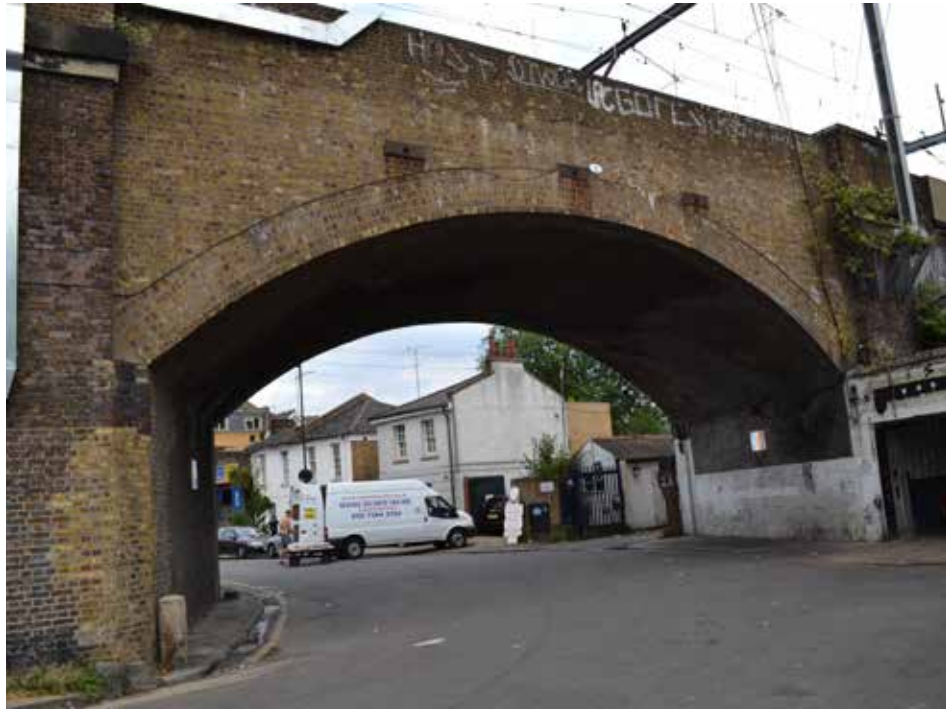
Plate 266: Side view of arch from Leybourne Road