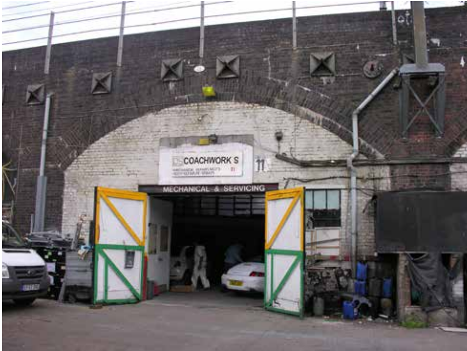
Plate 310: Arch - view from yard accesible from Leybourne Road