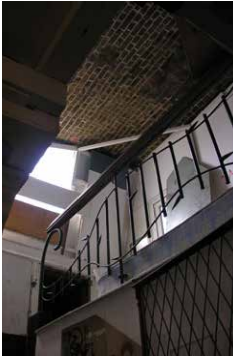
Plate 341: Arch - Stair 2 landing on first floor (ground floor)