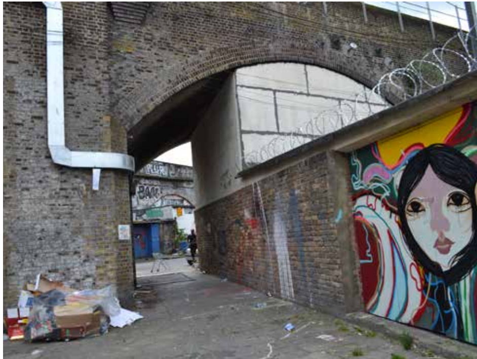
Plate 267: Side view of arch from Torbay Street, arch divided in two and partially in-filled