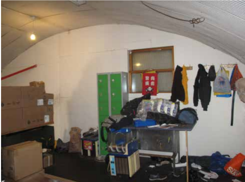
Plate 296: Mezzanine floor - view towards the rear of the arch