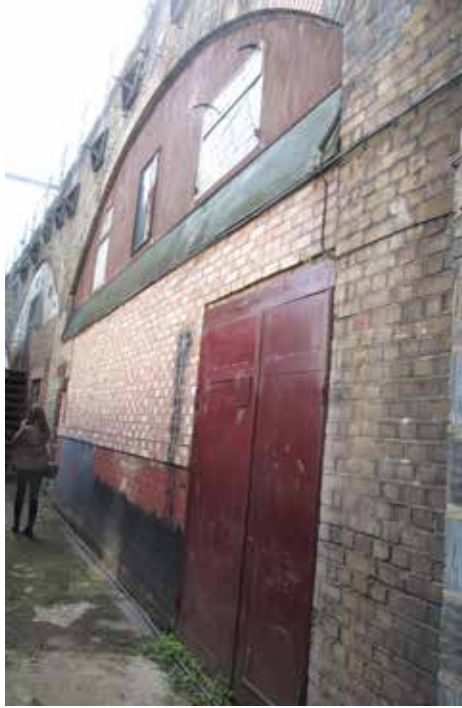
Plate 361: Arch - Rear exterior - towards Chalk Farm Road