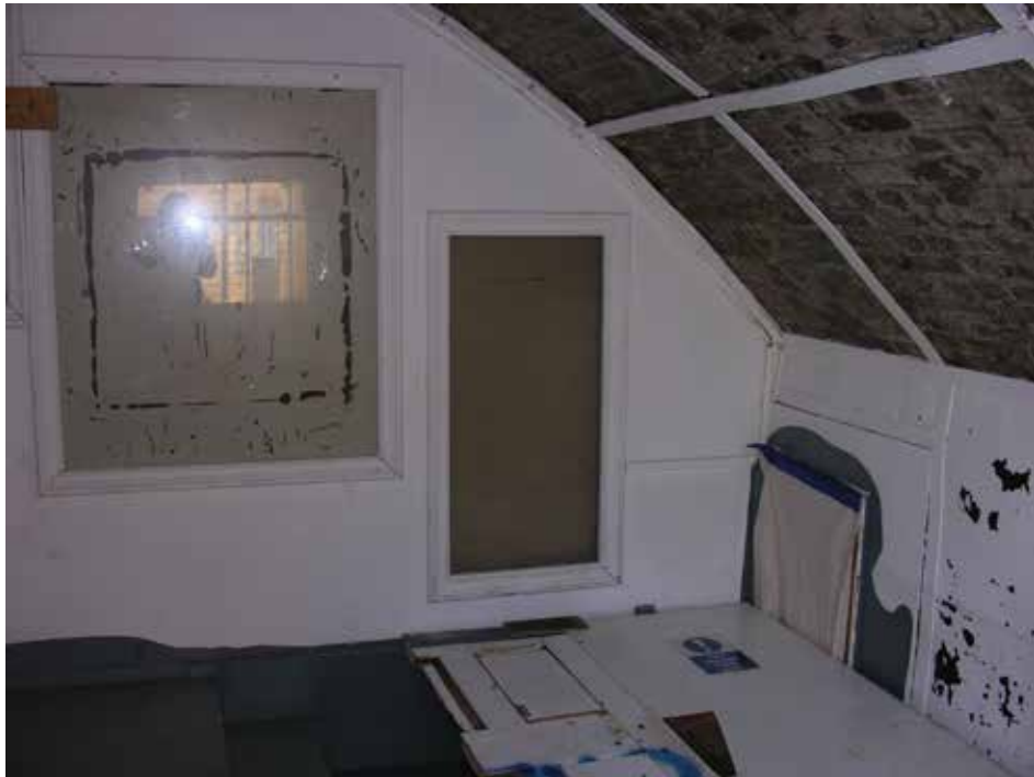
Plate 344: Arch - Room 1 to left (first floor)