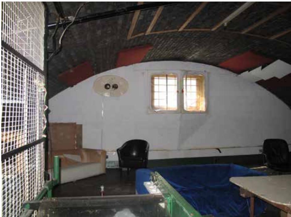
Plate 358: Arch - main space