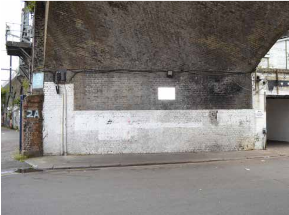
Plate 261: Underside view of arch