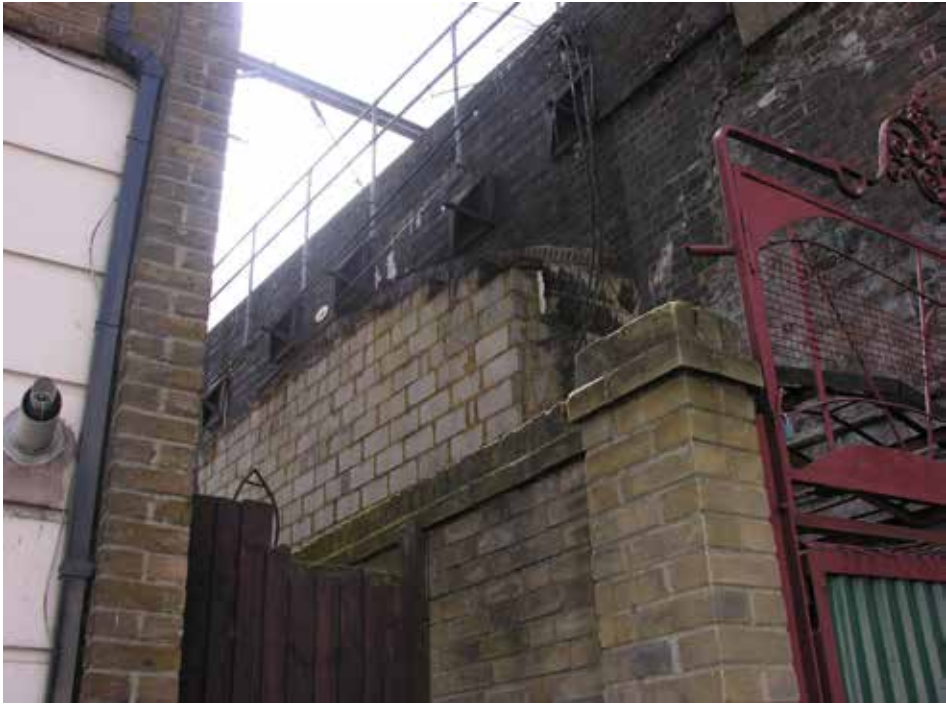
Plate 365: Arch - view from Castleheaven Road