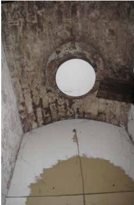
Plate 372: Vault between arch N13 and N14