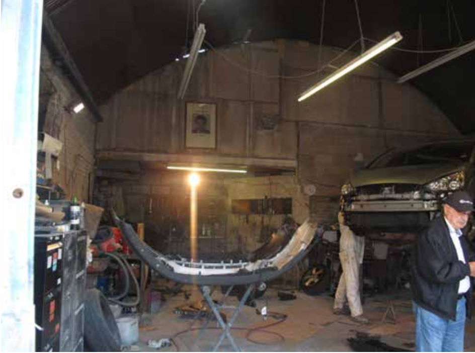
Plate 305: Interior of arch - view towards the rear