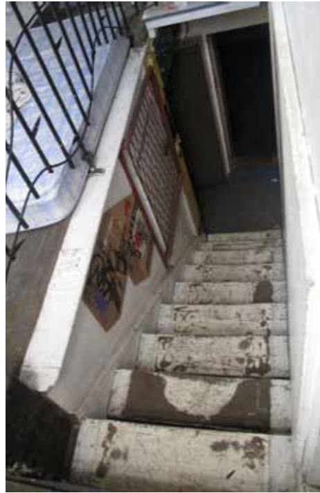
Plate 342: Arch - Stair 2 to first floor (first floor)