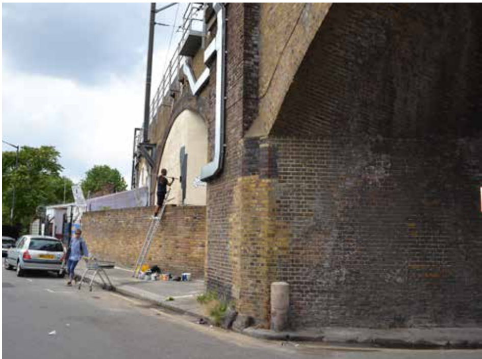
Plate 265: View of arch from Leybourne Road