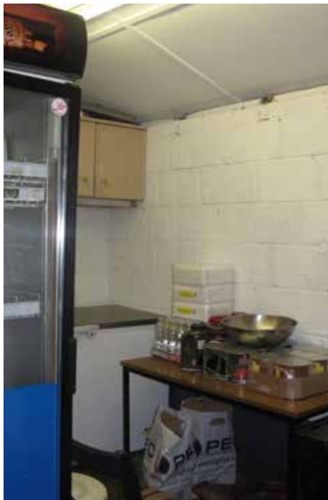
Plate 292: Below mezzanine storage space - view towards arch N8 and front