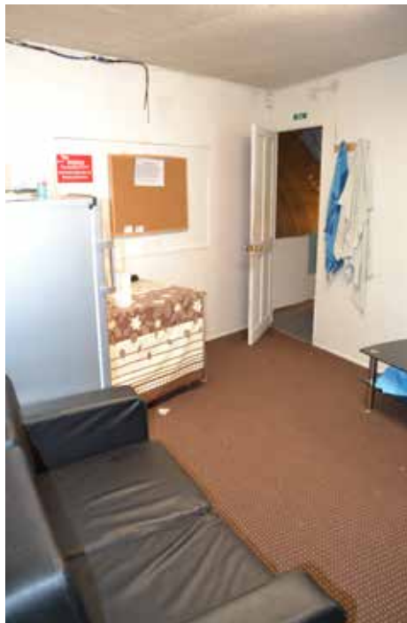
Plate 258: First floor - mosque, view towards its entrance