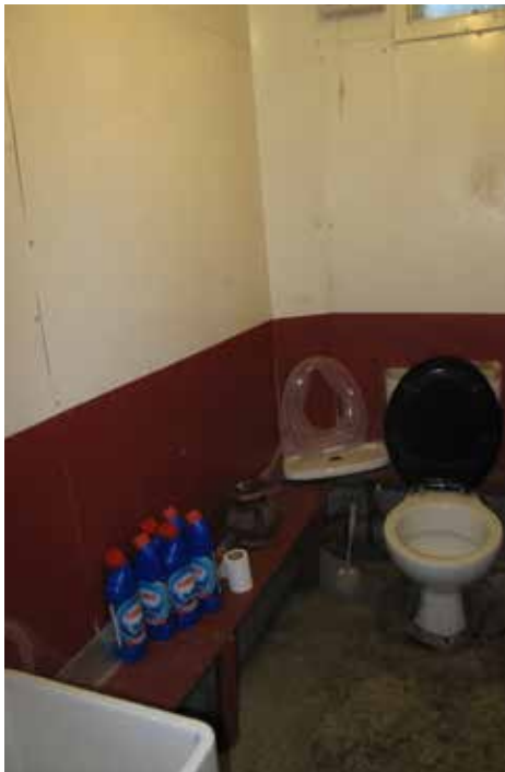
Plate 302: Toilet