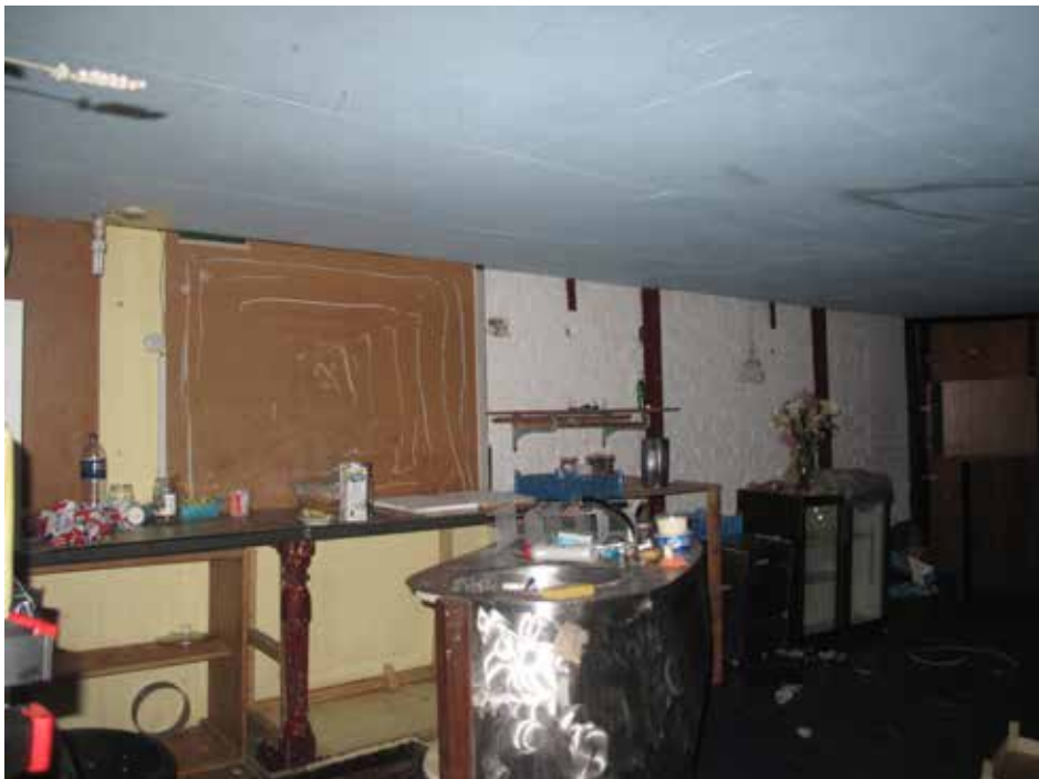
Plate 355: Arch - secondary space (ground floor)