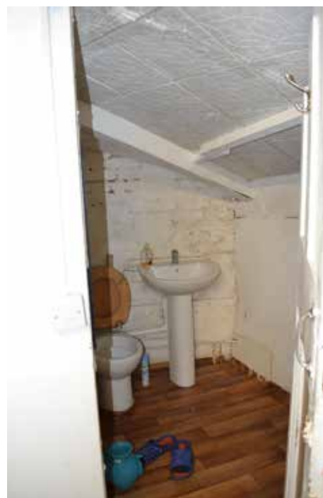
Plate 259: First floor - mosque small toilet