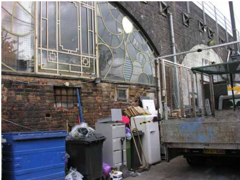
Plate 321: Arch - view from Leyborune Road (Arch N11 situated to the right)