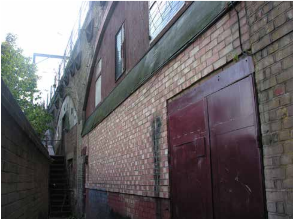
Plate 362: Arch - rear space