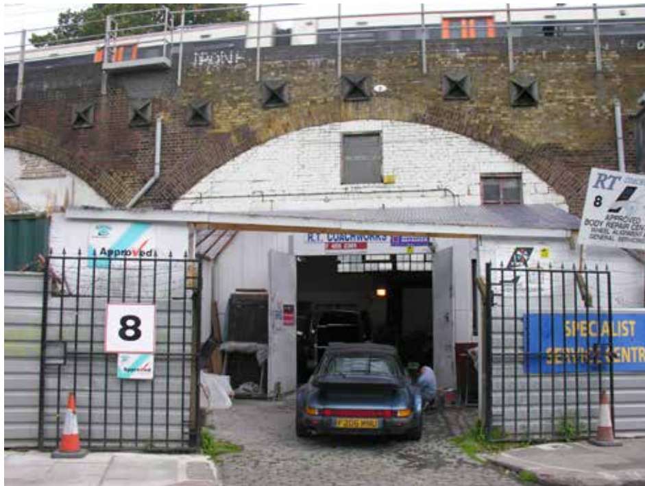
Plate 278: Arch - view from Leybourne Road