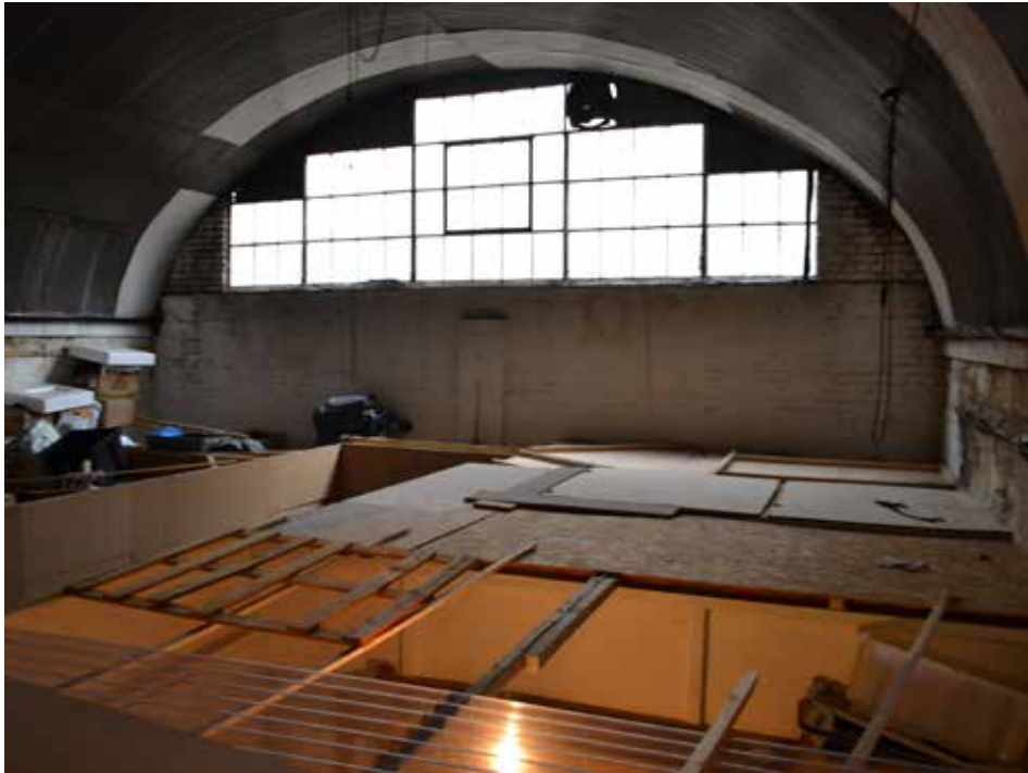
Plate 247: first floor- view over cubicles to the rear of arch