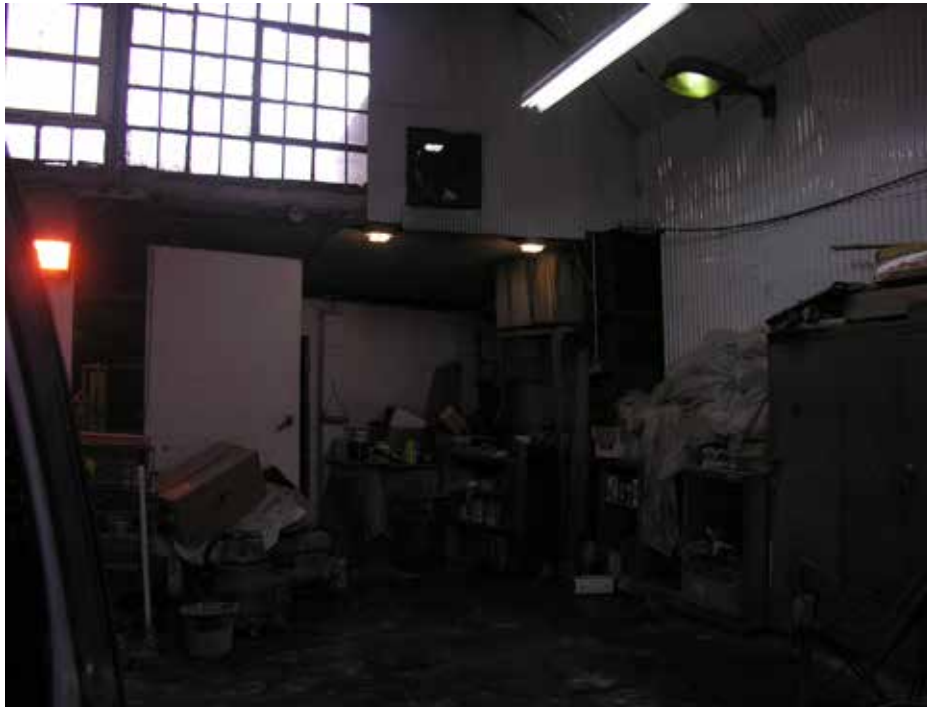
Plate 283: Interior of arch - view towards the back