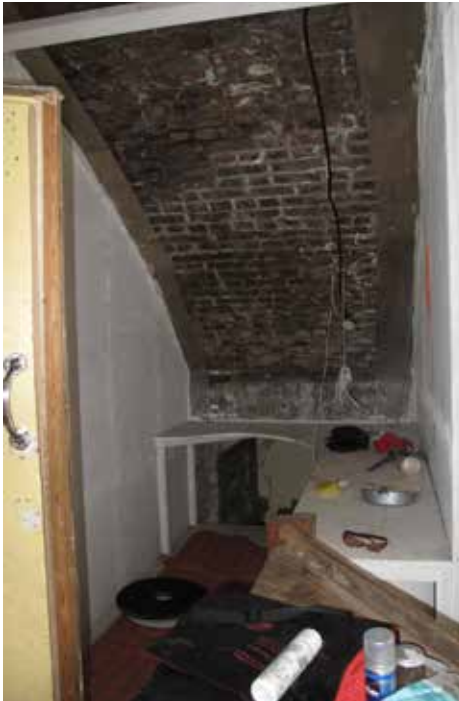
Plate 378: Arch - First floor space