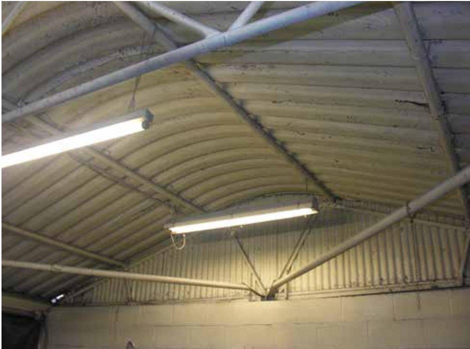
Plate 315: Underside of arch