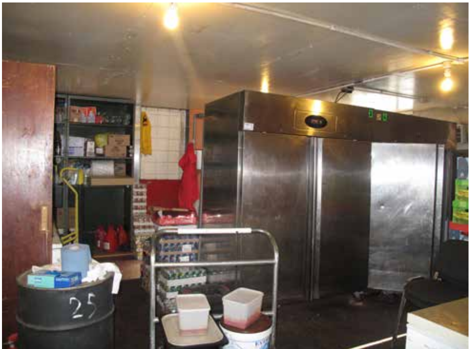
Plate 297: Food storage area - view towards the back of the arch