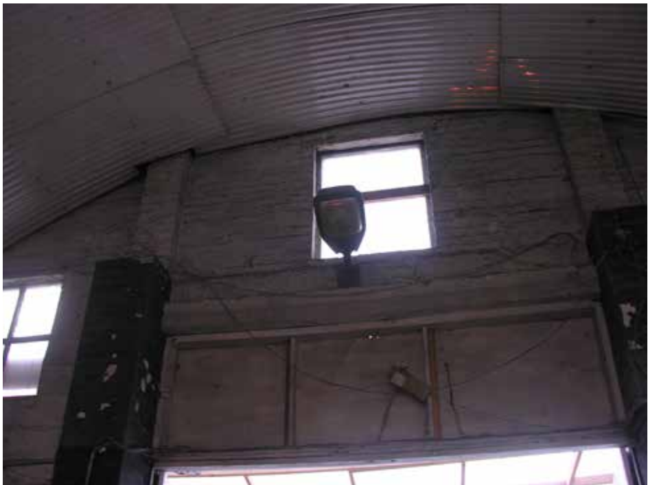
Plate 286: Interior of arch - view above the entrance