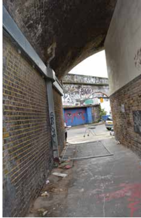
Plate 270: View of public access route of arch from Torbay Street