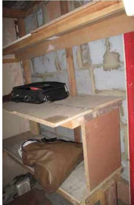
Plate 367: Arch - Ground floor space