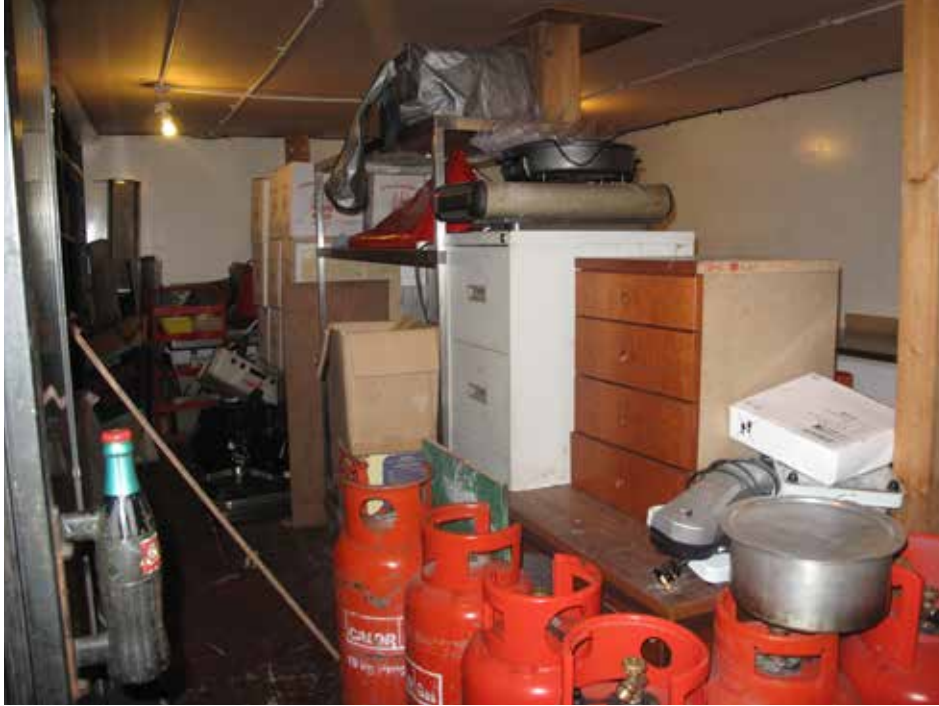
Plate 291: Below mezzanine storage space - view towards the back of the arch