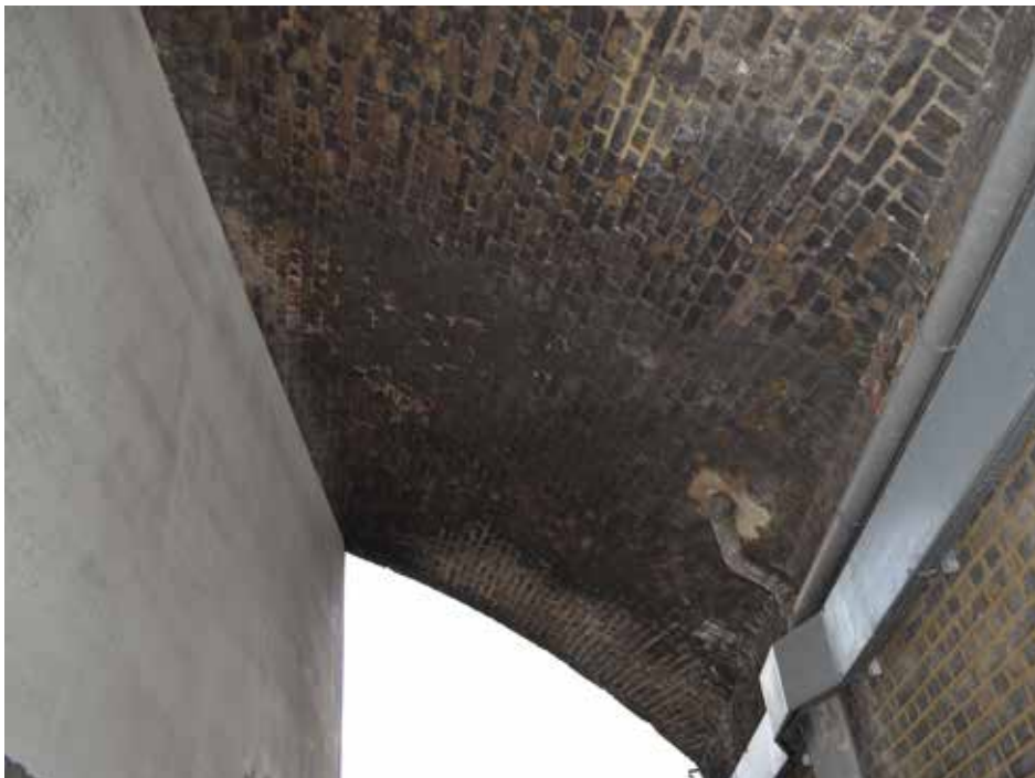
Plate 271: View of underside of unfilled arch