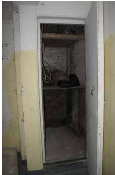
Plate 331: Mezzanine at stall no.240