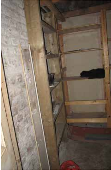
Plate 366: Arch - Ground floor space