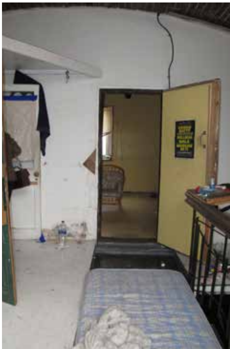
Plate 343: First floor landing (first floor)