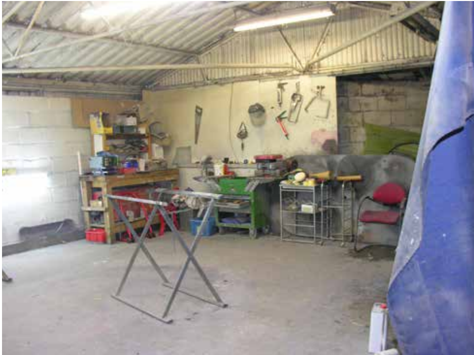
Plate 312: Interior of arch - view towards the rear