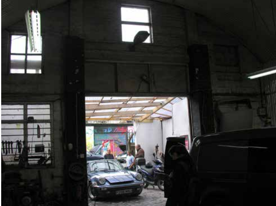
Plate 285: Interior of arch - view towards the entrance