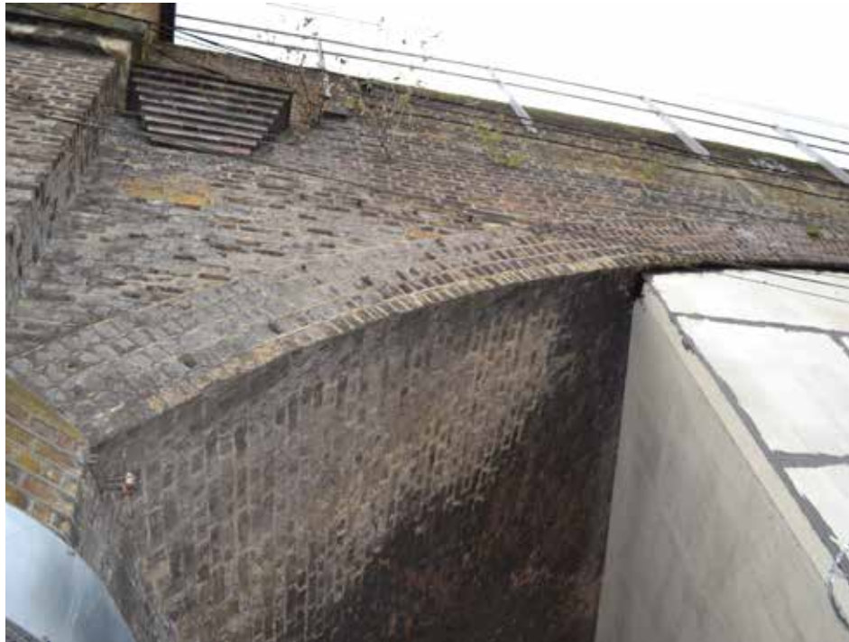
Plate 272: View of underside of unfilled arch