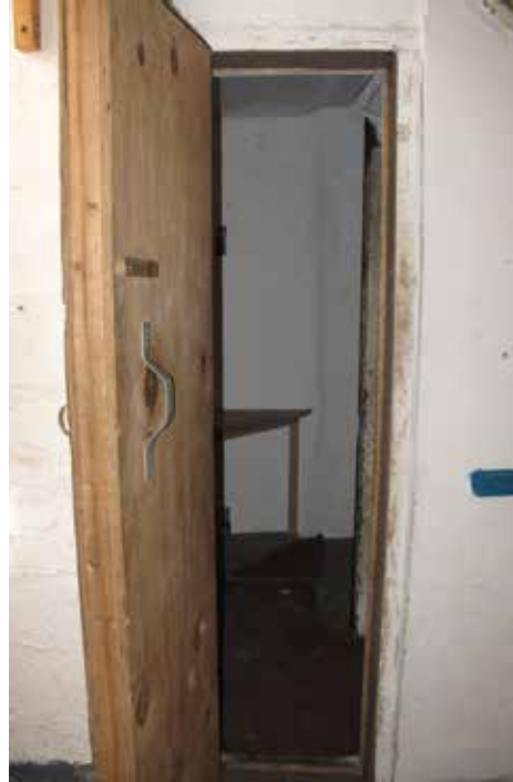
Plate 329: Arch - room 3 on left side (ground floor)