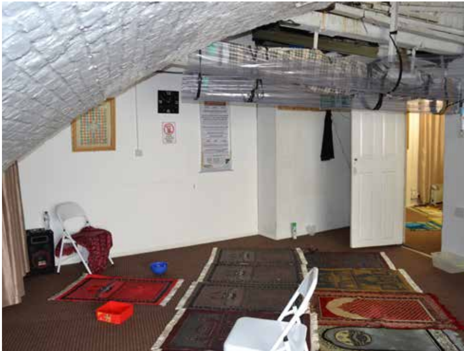
Plate 254: First floor - mosque prayer room