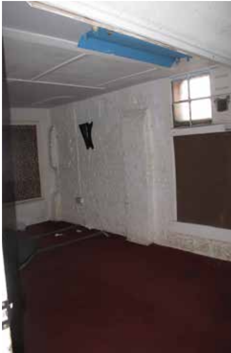
Plate 325: Arch - room 2 on left side (ground floor)