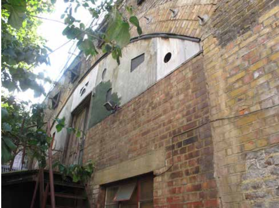
Plate 346: Arch - Rear exterior - towards Chalk Farm Road