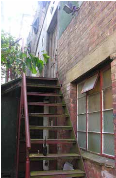
Plate 347: Arch - Rear access to first floor