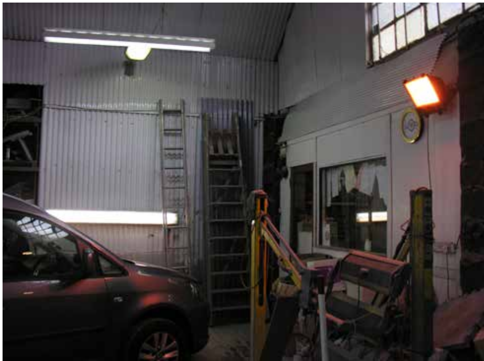
Plate 284: Interior of arch - view towards arch N9