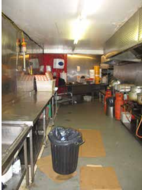
Plate 300: Kitchen - view towards arch N10