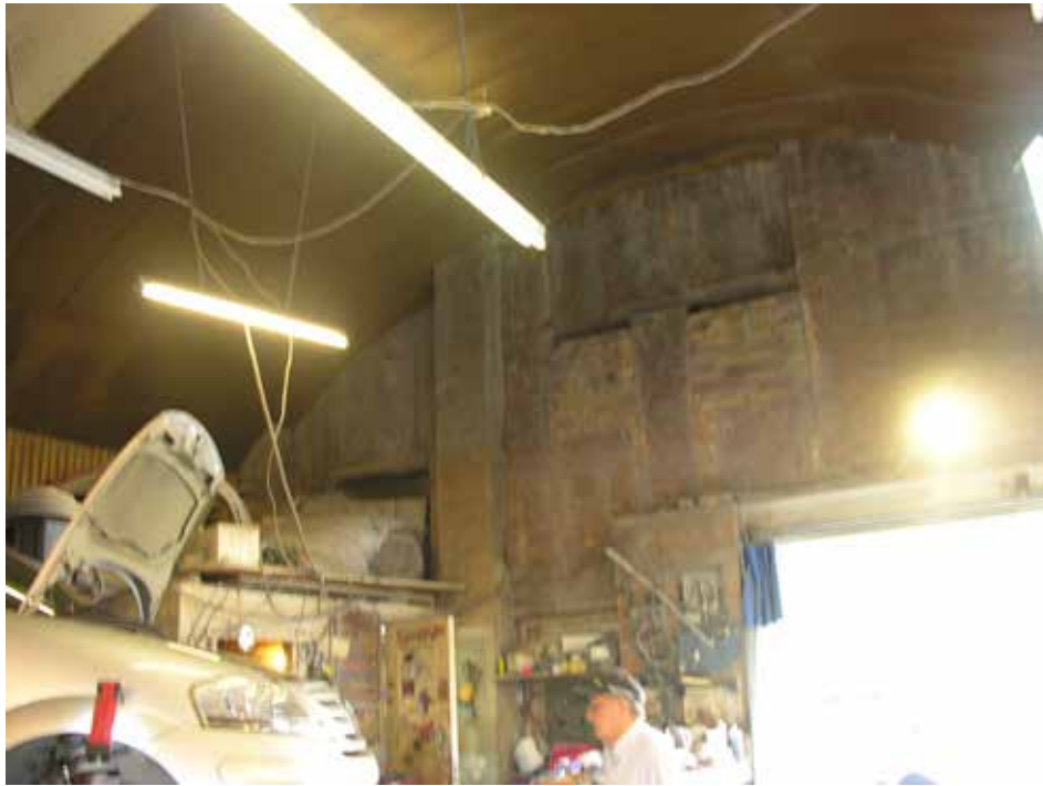
Plate 308: Top of arch - view towards the front