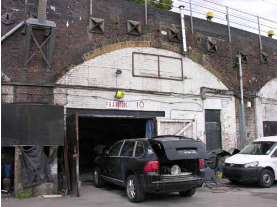
Plate 304: Arch - view from yard accesible from Leybourne Road