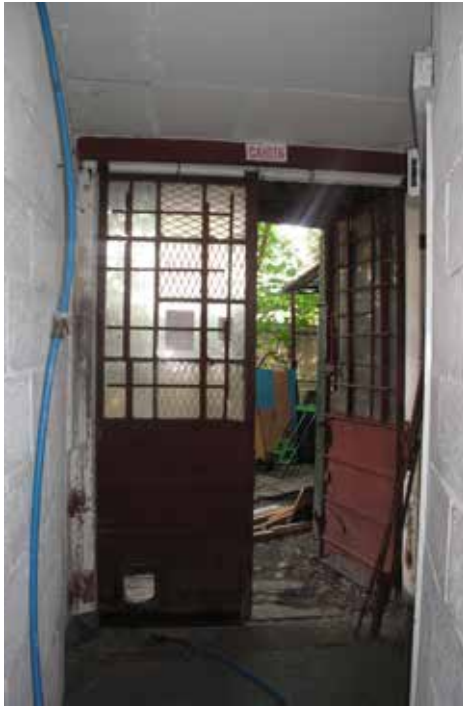
Plate 322: Arch - Interior view of entrance from rear (ground floor)