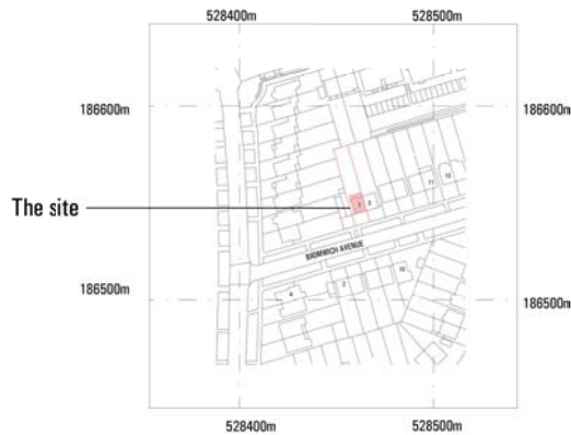
01. LOCATION PLAN 1:1250