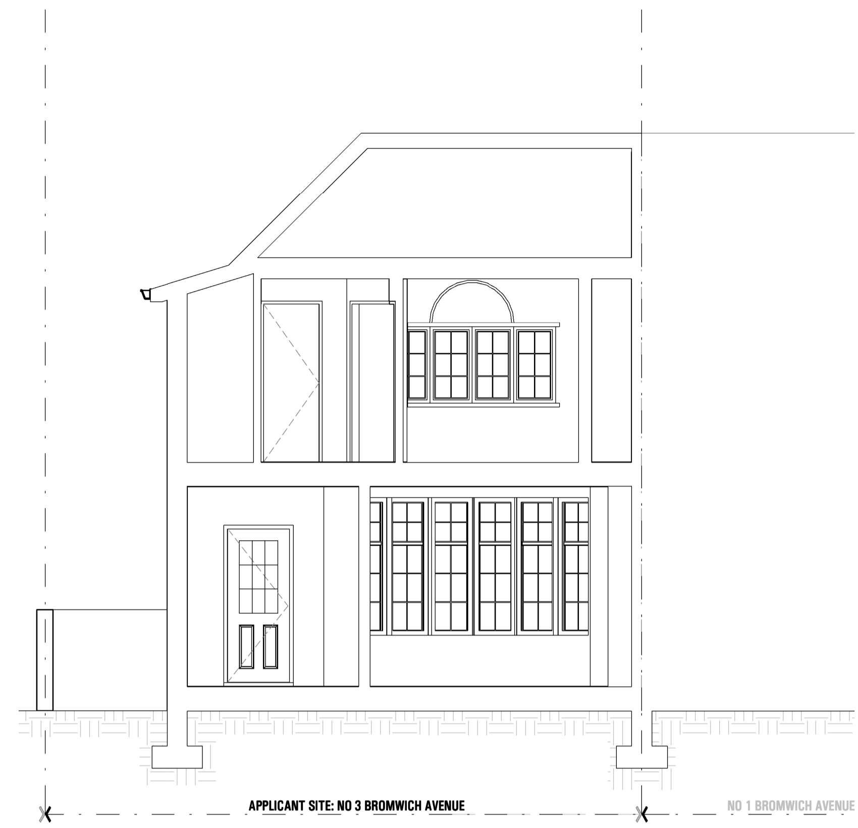
01. SECTION A